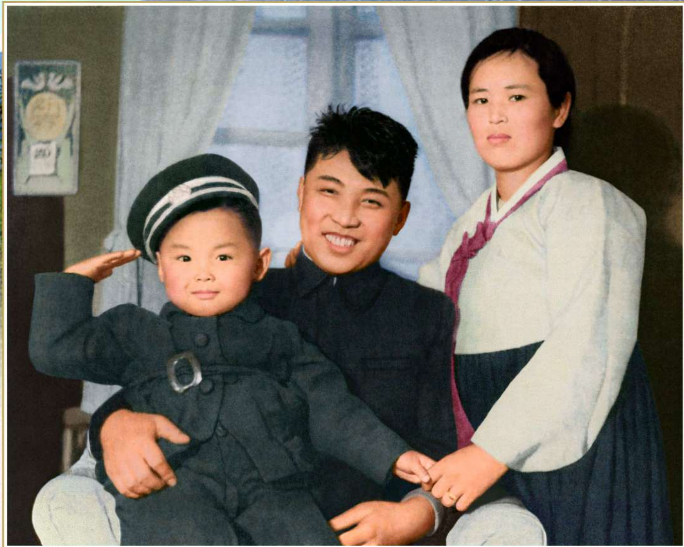
Kim Jong Il with his parents March Juche 36 (1947)

Chairman Kim Jong Il was born in the Paektusan Secret Camp (in the city of Samjiyon, Ryanggang Province) on February 16, Juche 31 (1942).