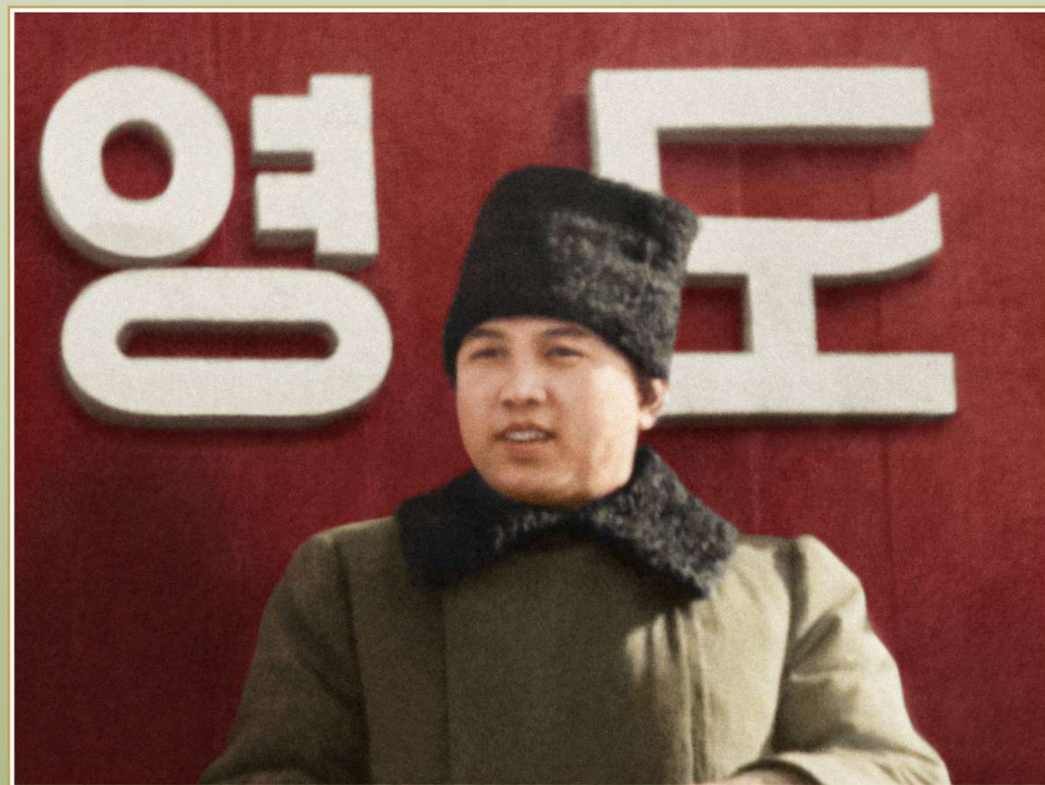
Kim Il Sung on the platform to review the military parade of the Korean People's Army February Juche 37 (1948)

The founding of the Korean People's Army (KPA) on February 8, 76 years ago, marked the start of the victorious course it has followed to reliably defend the security of the country and the people and contribute to the national prosperity.