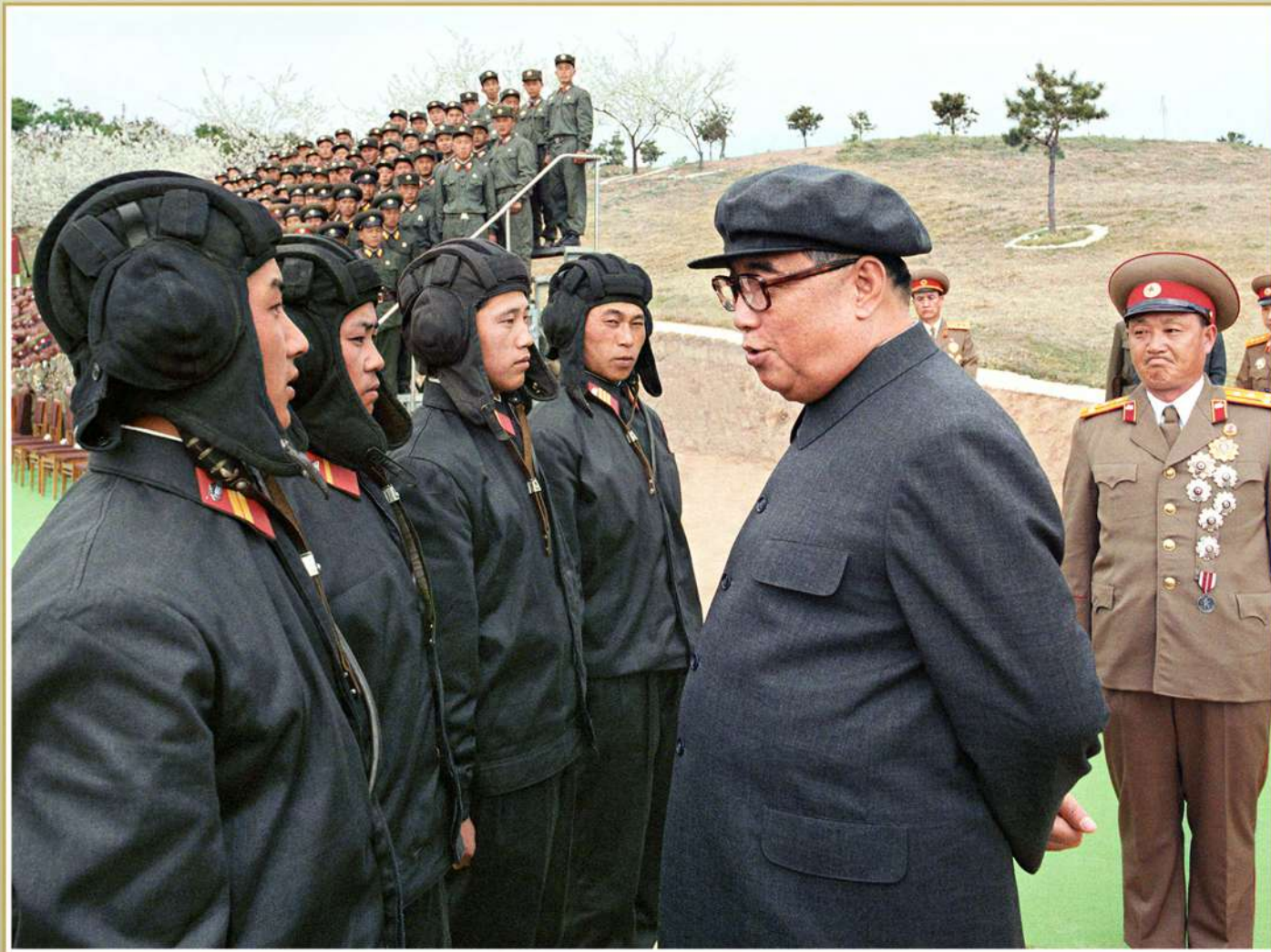
Kim Il Sung meeting tankmen April Juche 72 (1983)

and blazed a trail in building the defence industry.