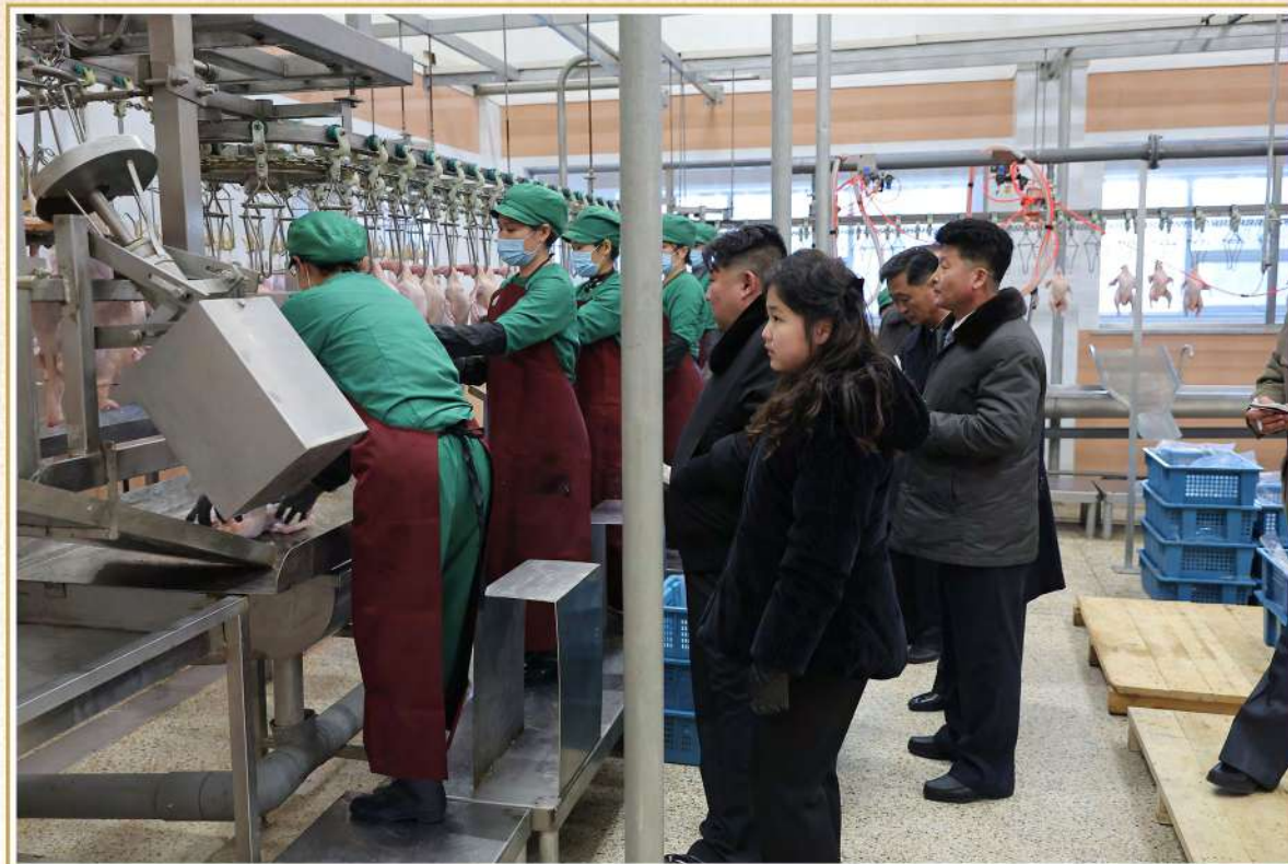
Kim Jong Un makes the rounds of the general control room and production blocks at the farm to learn in detail about its modernity, production capacity and actual state.