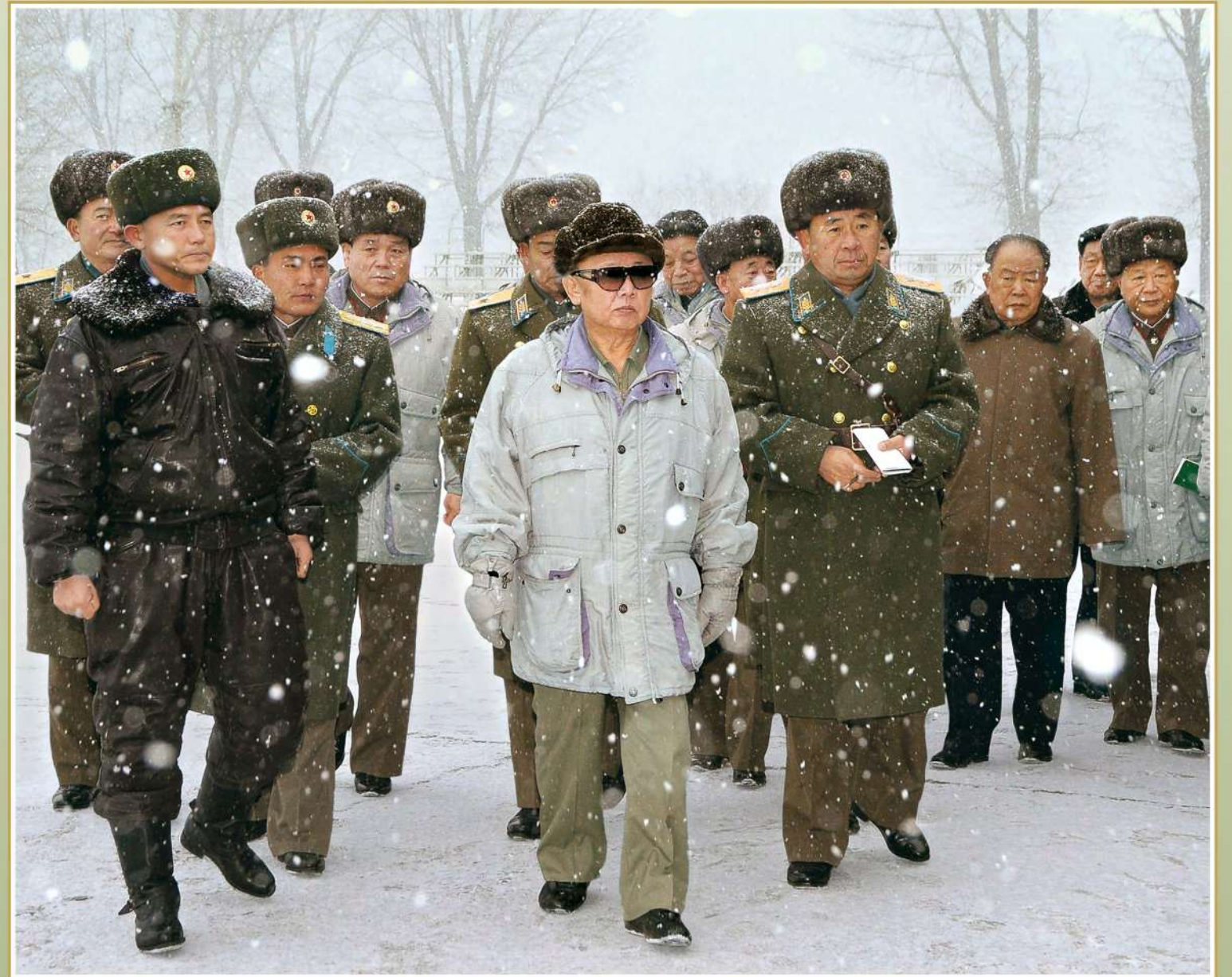
Kim Jong Il visiting a unit of the KPA Air Force December Juche 97 (2008)