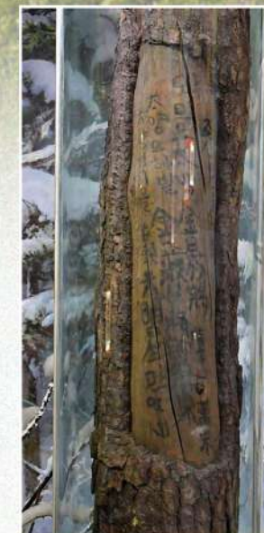
Some of slogans written on the trees by the soldiers of the Korean People's Revolutionary Army to declare the birth of Kim Jong Il