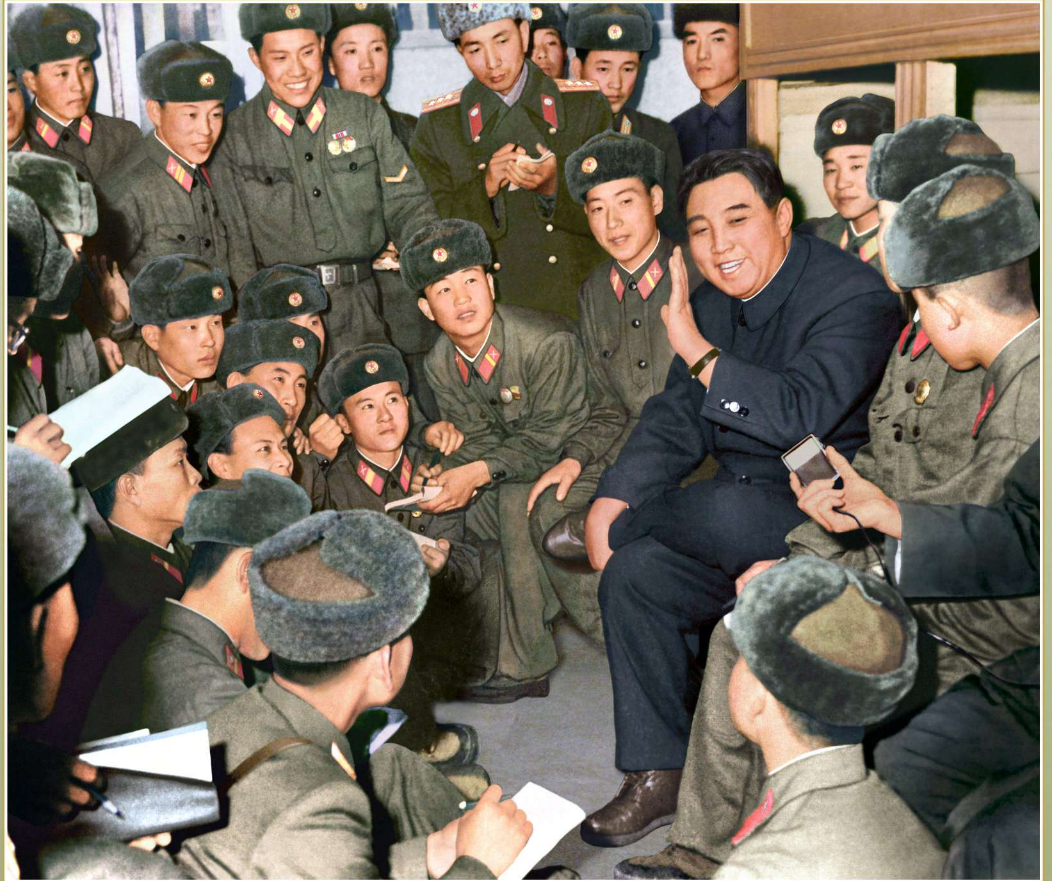
Kim Il Sung among People's Army soldiers February Juche 55 (1966)

He dispatched anti-Japanese revolutionary veterans to play the leading role in founding parent units of various services and arms