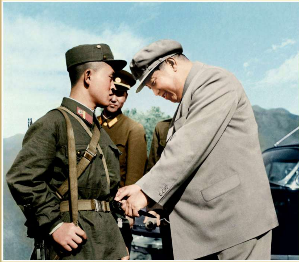
Kim Il Sung seeing weapons and equipment of a People's Army soldier May Juche 54 (1965)

founded the Korean People's Army by putting forward the Juche-oriented army building idea and implementing it successfully.