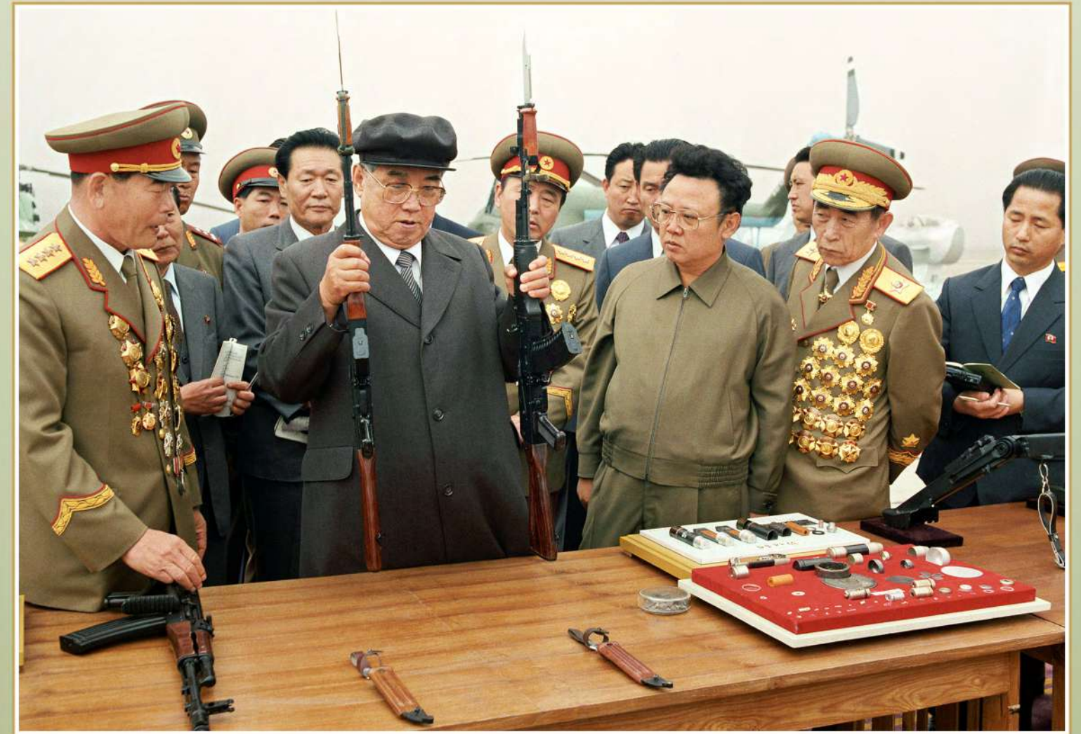
Kim Il Sung and Kim Jong Il seeing weapons and equipment April Juche 75 (1986)

Thanks to his brilliant leadership the Korean people greeted a great national event, the founding of the Korean People's Army, in a little over two years after the country's liberation.