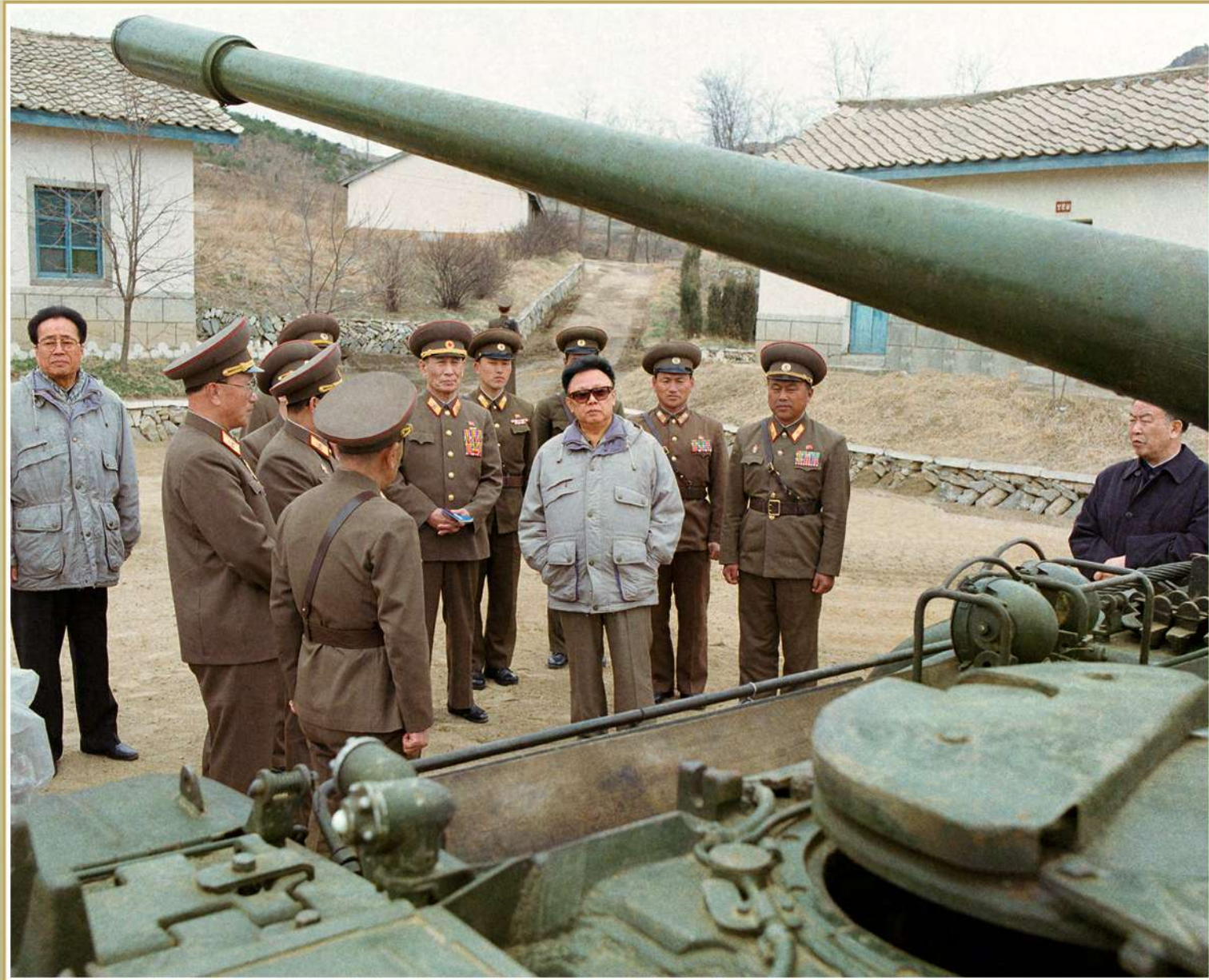
Kim Jong Il seeing combat equipment April Juche 89 (2000)