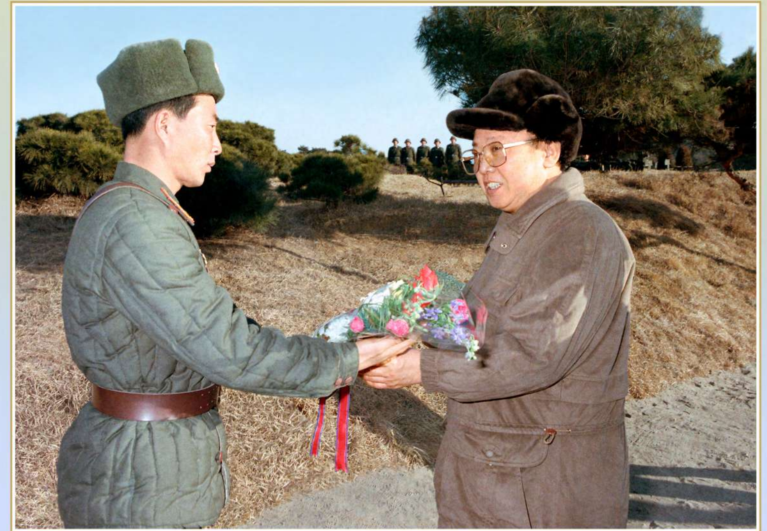
Kim Jong Il visiting the Dwarf Pine Company on the morning of New Year's Day January Juche 84 (1995)

During the Arduous March and forced march in the 1990s the socialist Korea advanced vigorously along the broad avenue for building a thriving country, overcoming harsh trials and difficulties, thanks to the administration of outstanding Songun politics by Chairman Kim Jong Il.