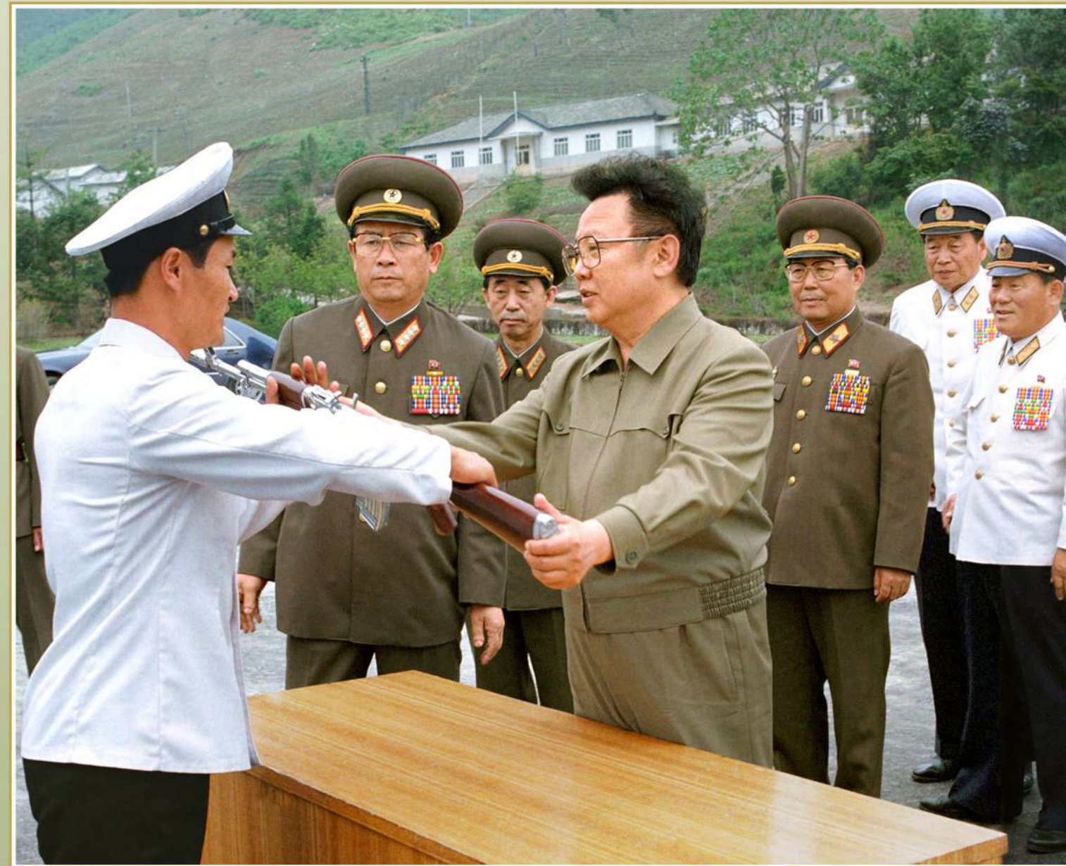
Kim Jong Il handing over a rifle at a unit of the KPA Navy June Juche 86 (1997)

Noting that the might of the unity of the Supreme Commander and soldier masses is more powerful than that of nuclear weapon, the Chairman said the army in which the Supreme Commander and his