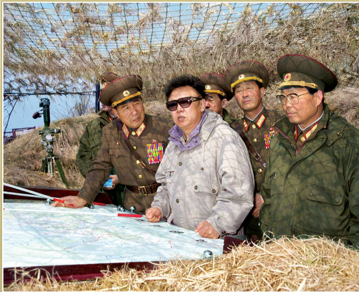
Kim Jong Il at a command post on the front line April Juche 86 (1997)

During those days the Chairman followed the untrodden path of Songun-based leadership braving through numerous difficulties and ordeals, shouldering the responsibility for the destiny of his country and people.