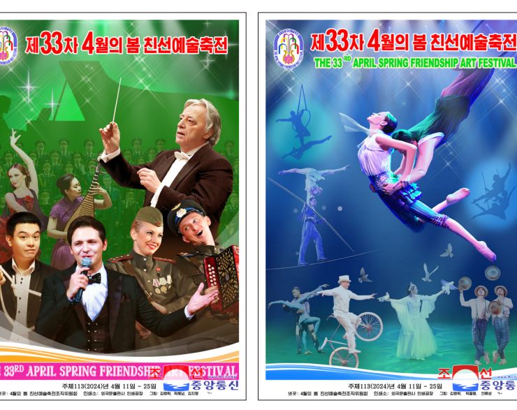
Some of the posters for the 33rd April Spring Friendship Art Festival.