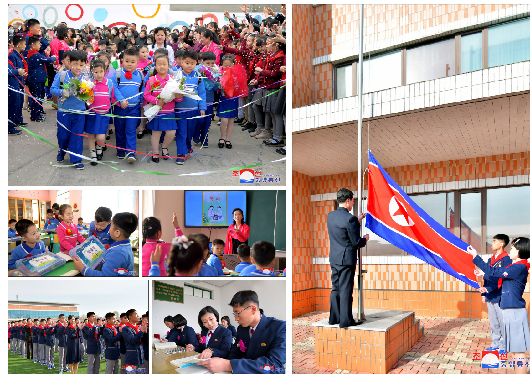
Opening ceremonies of the new school year simultaneously take place at all educational institutions across the DPRK on April 1.

Following the promulgation of the law on the enforcement of universal 12-year compulsory education, 2017 and 2018 were designated as years of science and education to increase nationwide and allsociety interest in improving educational conditions and environment. The slogan "Let us make ours a country of education and a talent power by bringing about a radical improvement in education in the new century" was set