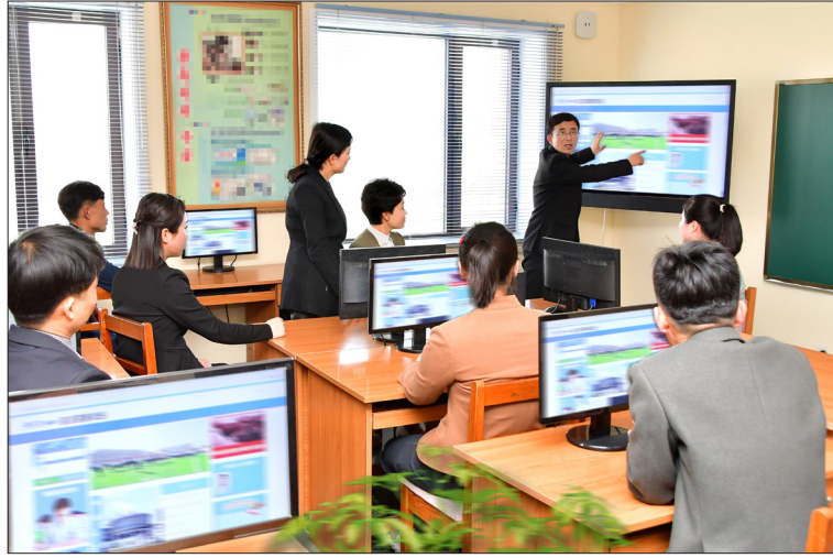
Teachers of Pyongyang Middle School for Orphans hold a discussion on ways to further raise the informatization level of lessons.

Looking round the newly built Pyongyang Middle School for Orphans in July