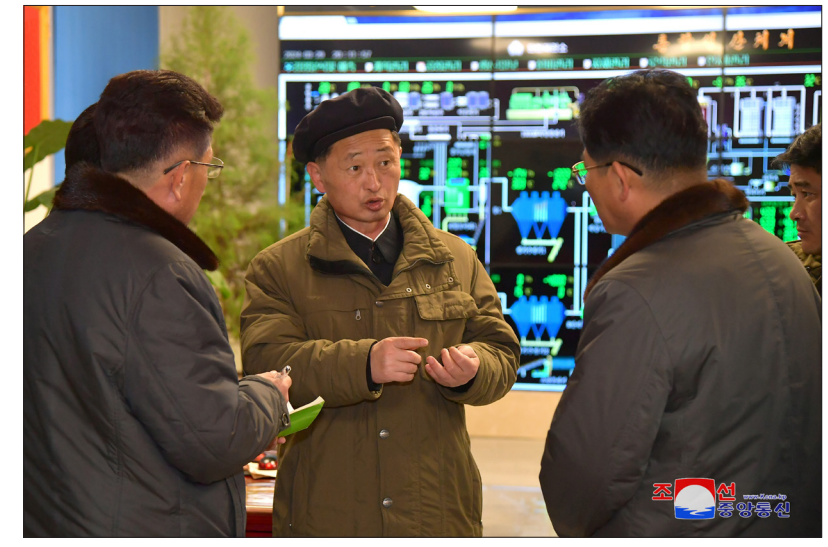
Premier Kim Tok Hun (middle) inspects the Tanchon Smeltery.

Meanwhile, he visited the Ministry of Mining Industry and the Ministry of Machine-building Industry to discuss the practical measures for consolidating the current production bases and expanding capacity of major mines and smelteries and for producing equipment needed for readjusting, reinforcing and further perfecting the irrigation system of the country.