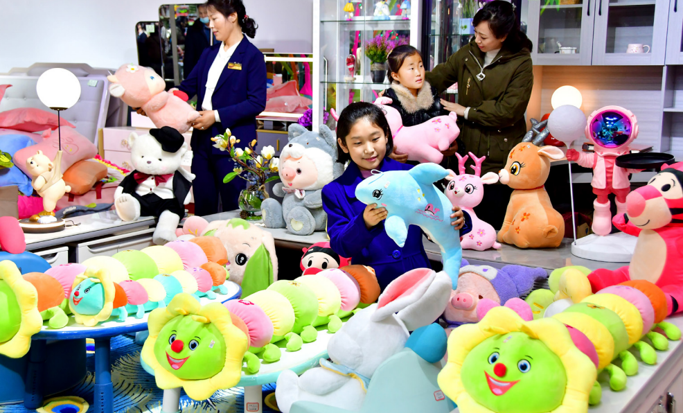
Customers admire home-made toys at the Pyongyang Children's Department Store children's goods exhibition.