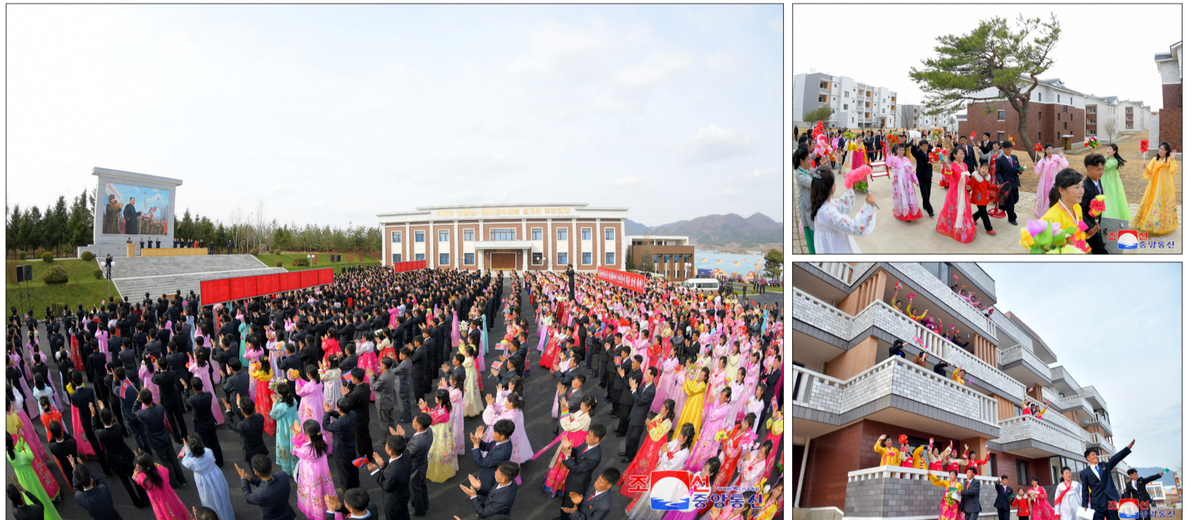
A meeting for moving into new houses takes place at the Kangdong Greenhouse Complex on March 27.

farm and world-class large-scale greenhouse vegetable producer which substantially plays a part in bettering the diet of the citizens of Pyongyang.