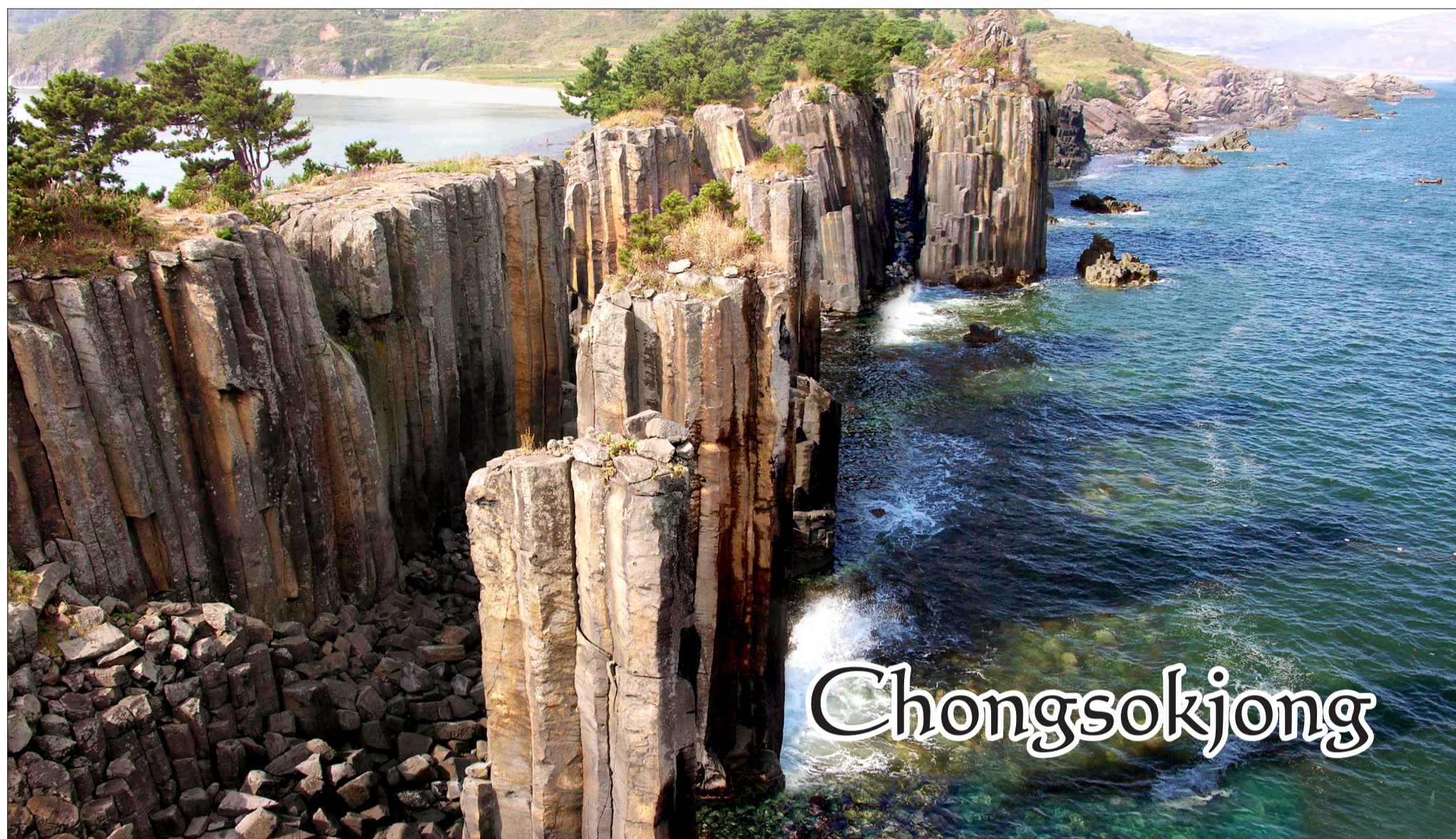
Chongsokjong at the seaside of Thongchon county town in Kangwon Province has been called one of the eight scenes in the Kwandong area since olden times.