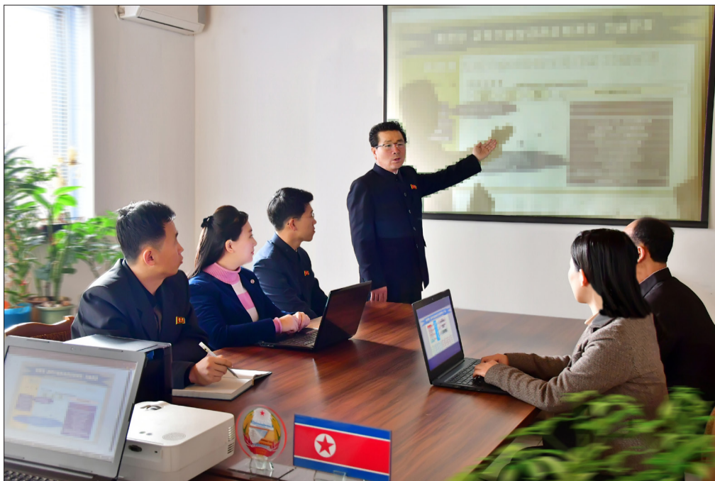
Researchers discuss how to boost the efficiency of sci-tech diffusion at the Sci-tech Diffusion and Management Research Institute.

Last year, too, it disseminated techniques for increasing agricultural productivity, including breeding of new crop varieties and relevant manuring and cultivation methods and data on efficient recycling techniques.