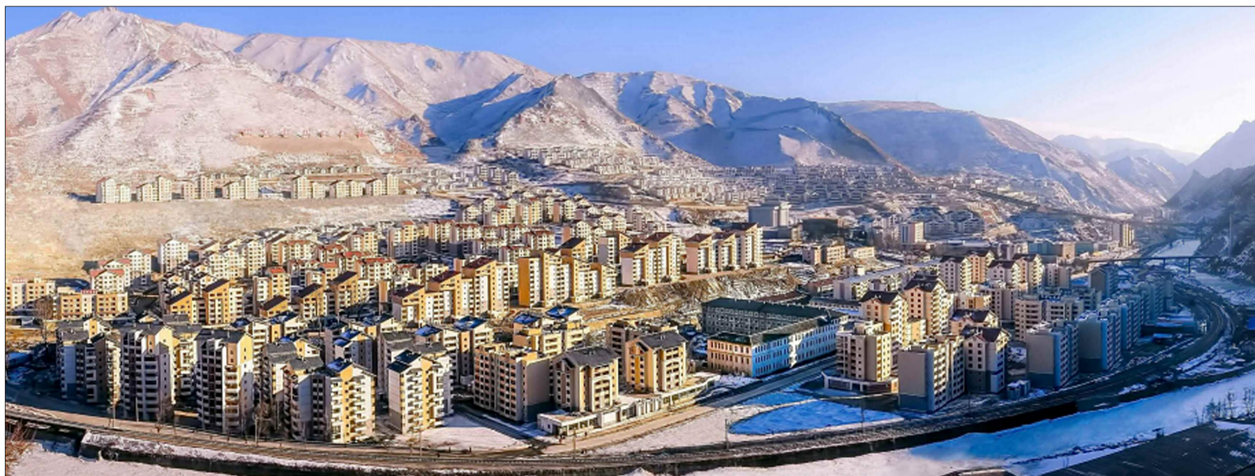
A bird's-eye view of the mountain-gorge city built in the Komdok area.

Every inhabitant in Komdok is determined to repay the favour of the country which provided ordinary miners with many new flats free of charge with increased mineral production.