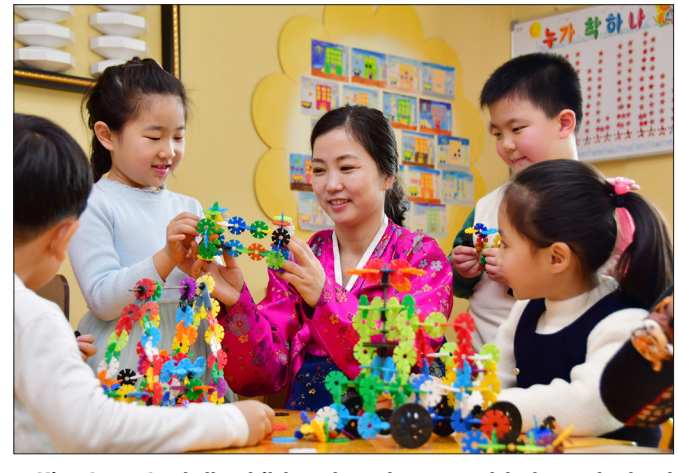
Kaeson Kindergarten affiliated to Pyongyang Teachers Training College.

She attaches importance to the subjects of drawing, abacus and making in developing their intellectual faculty.