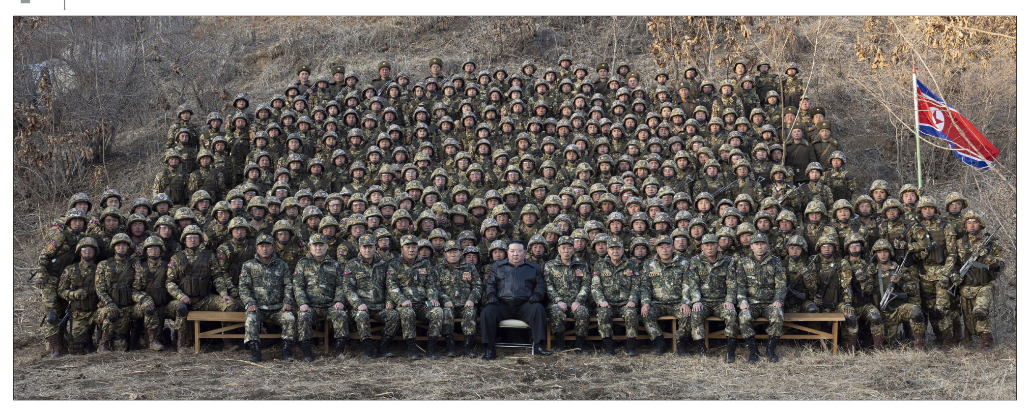
FROM PAGE 3

facilities and training grounds in the base. He appreciated the fact that all the elements have been built in a practical way so that various kinds of training can be conducted in high intensity in an actual war atmosphere, true to the important military policy-oriented tasks set forth by the Party Central Committee before the army. And he stressed the need to make positive use of them so as to practically contribute to strengthening the combat capability of the People's Army, further consolidate the material and technical foundation and properly conduct the maintenance work for them.