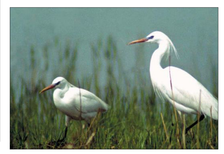
Chinese egret of Unmu Islet.

Chinese egret of Unmu Islet was registered as slopes where various a living monument in