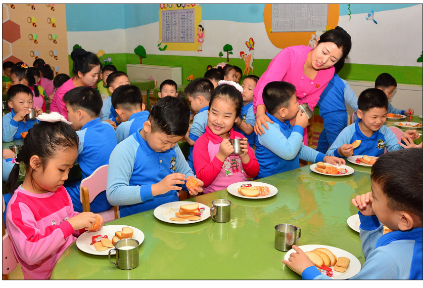
Orphaned children grow healthily under the care of the state at the Pyongyang Orphanage.