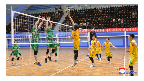
The Civil Servants Sports Games-2024 take place at the Taekwon-Do Hall in Pyongyang on March 5.