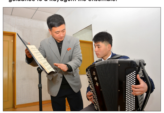
An instructor teaches a student to play bayan.

The university promotes many-sided exchange and cooperation and