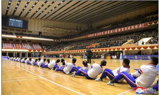
The finals of the Agricultural Workers Sports Games-2024 are held at Pyongyang Indoor Stadium