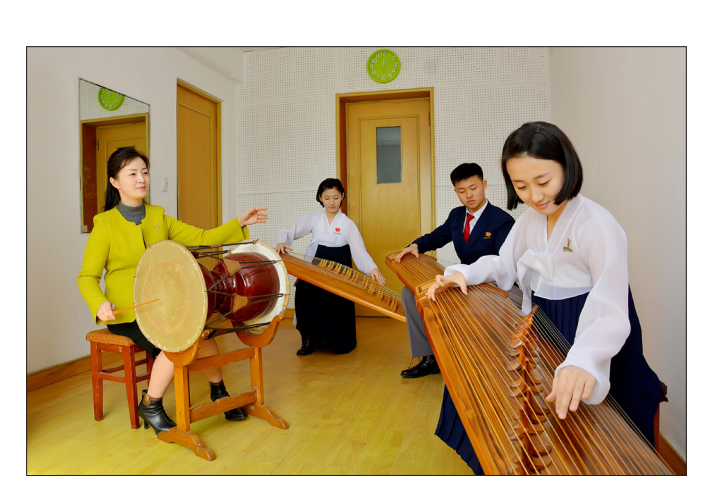
An instructor of the kayagum department gives guidance to a kayagum trio ensemble.

World-famous music professors, renowned instrumentalists and bands gave lectures or performances at the university and many foreign delegations and visiting groups and overseas Koreans visited it.