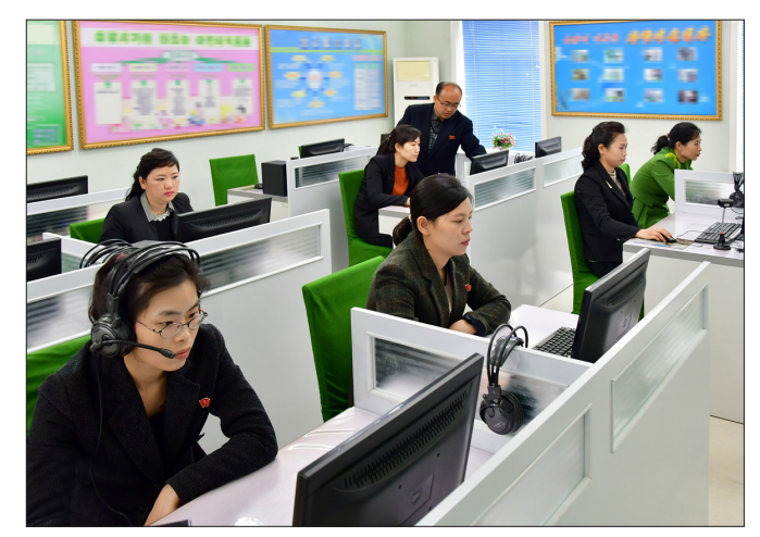
Workers acquire expertise through the sci-tech learning space at the Pyongyang Children's Foodstuff Factory.

"Science and technology and production of goods by should be regarded as the