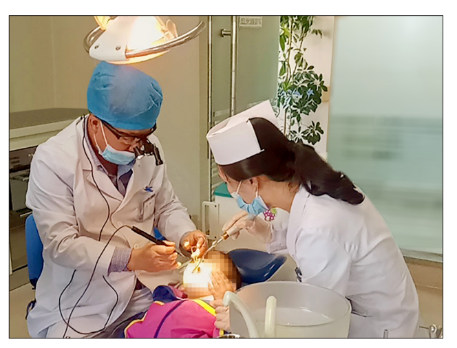
Medical workers are engaged in the treatment of an orphaned child from Pyongyang Primary School for Orphans.

Operation on abnormally attached lingual frenums but medical workers of the department deeply their gratitude to him, studied latest documentary records on the operation with the view that they should give the patients a perfect treatment which would cause no pain and no