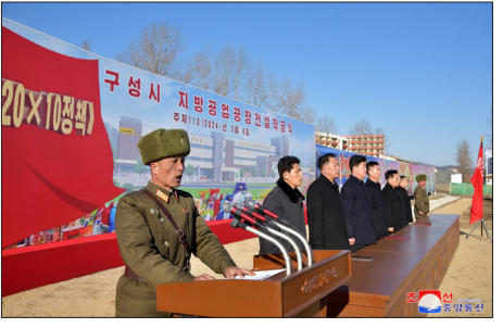
Ground-breaking ceremonies for regional-industry factories take place in Kusong City, Sukchon, Unpha, Kyongsong, Orang and Onchon counties to implement the Regional Development 20×10 Policy.