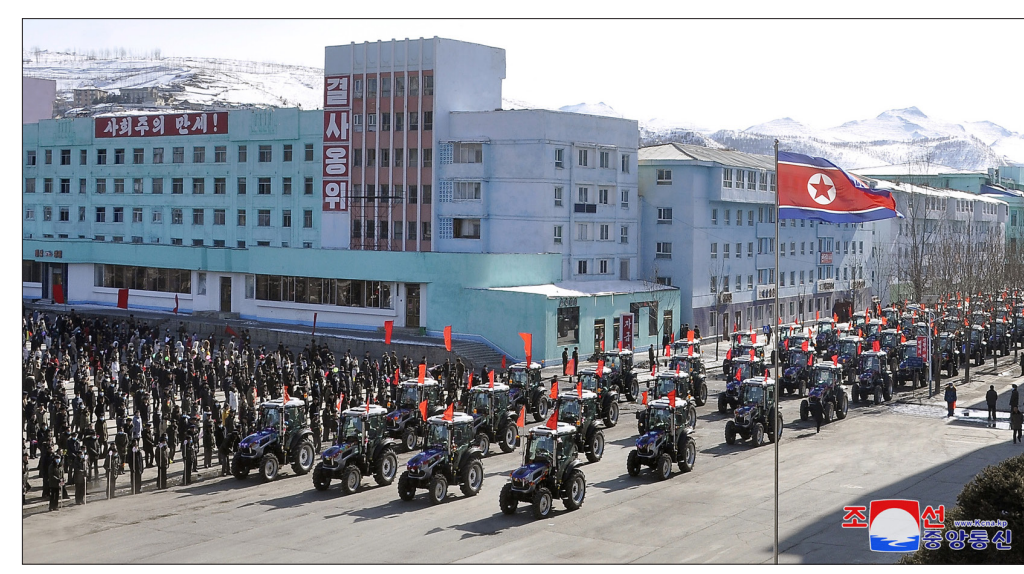
A ceremony for conveying tractors takes place in Hyesan on March 4.

Speakers expressed their determination to turn out in the drive to attain the goal of grain production this year without fail by firmly uniting on the strength of patriotism and steadily boosting the redoubled spirit of advance and thus uphold the decisions of the Ninth Plenary Meeting of the Eighth Central Committee of the Party with bold practice and proud fruition.