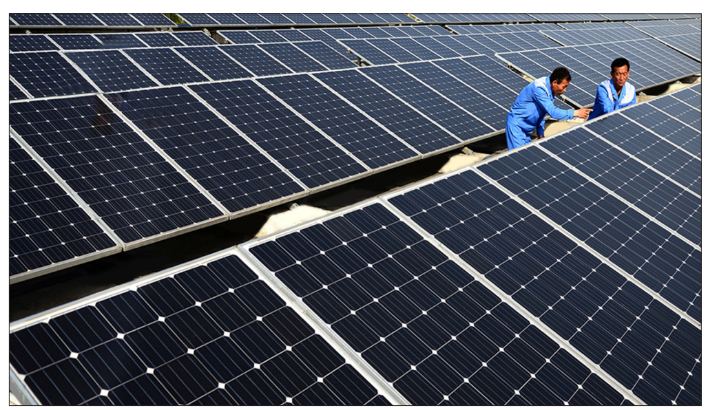
Employees inspect the solar panels installed on the rooftop at the Ryuwon Footwear Factory.

"We have keenly realized the validity of the policy of the Workers' Party of Korea positively harnessing