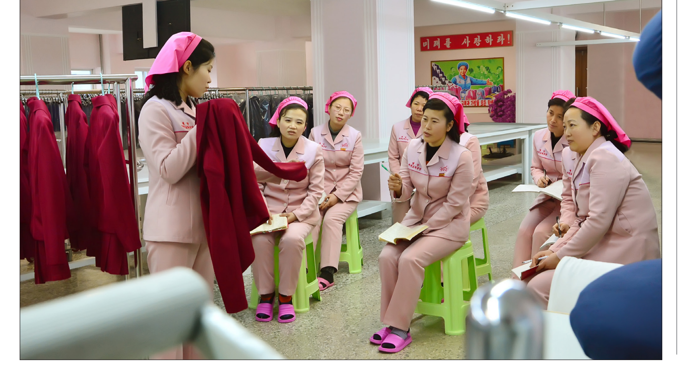
Workers hold a review on products at the Pyongyang School Uniform Factory.