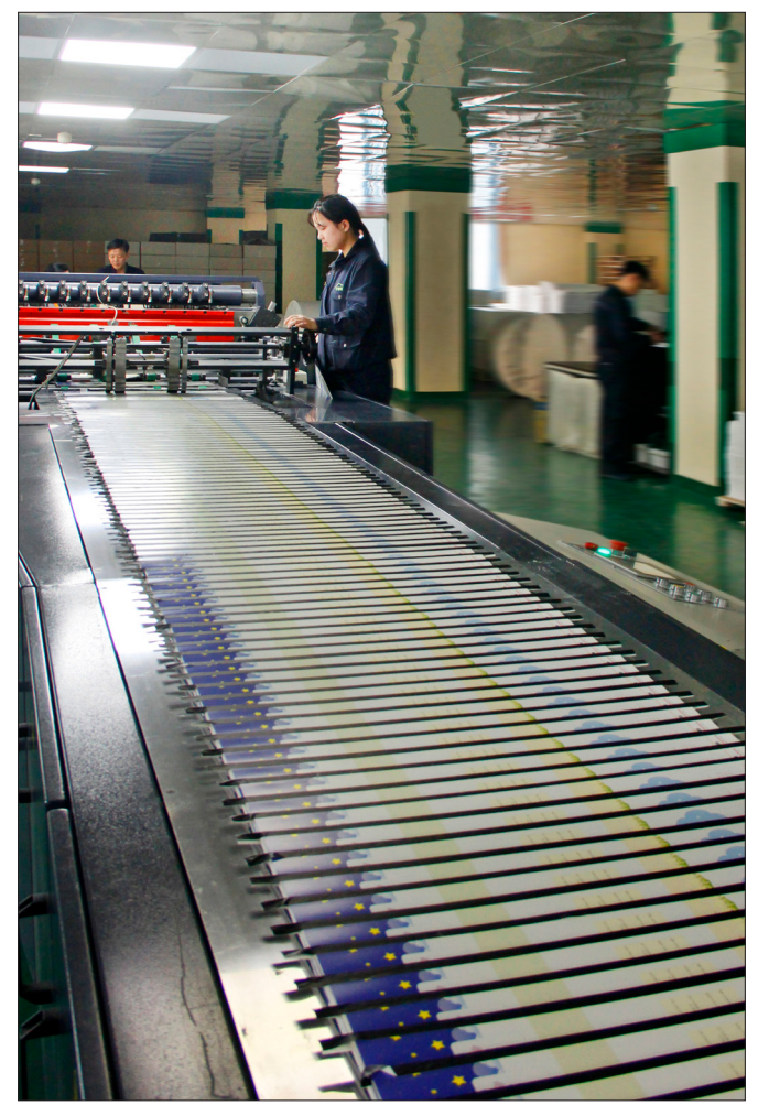
The Mindulle Notebook Factory steps up production as the new school year approaches.

At present, prior to the new school year, the of General Secretary Workers' Party of Korea and the eternal state policy of the DPRK to provide