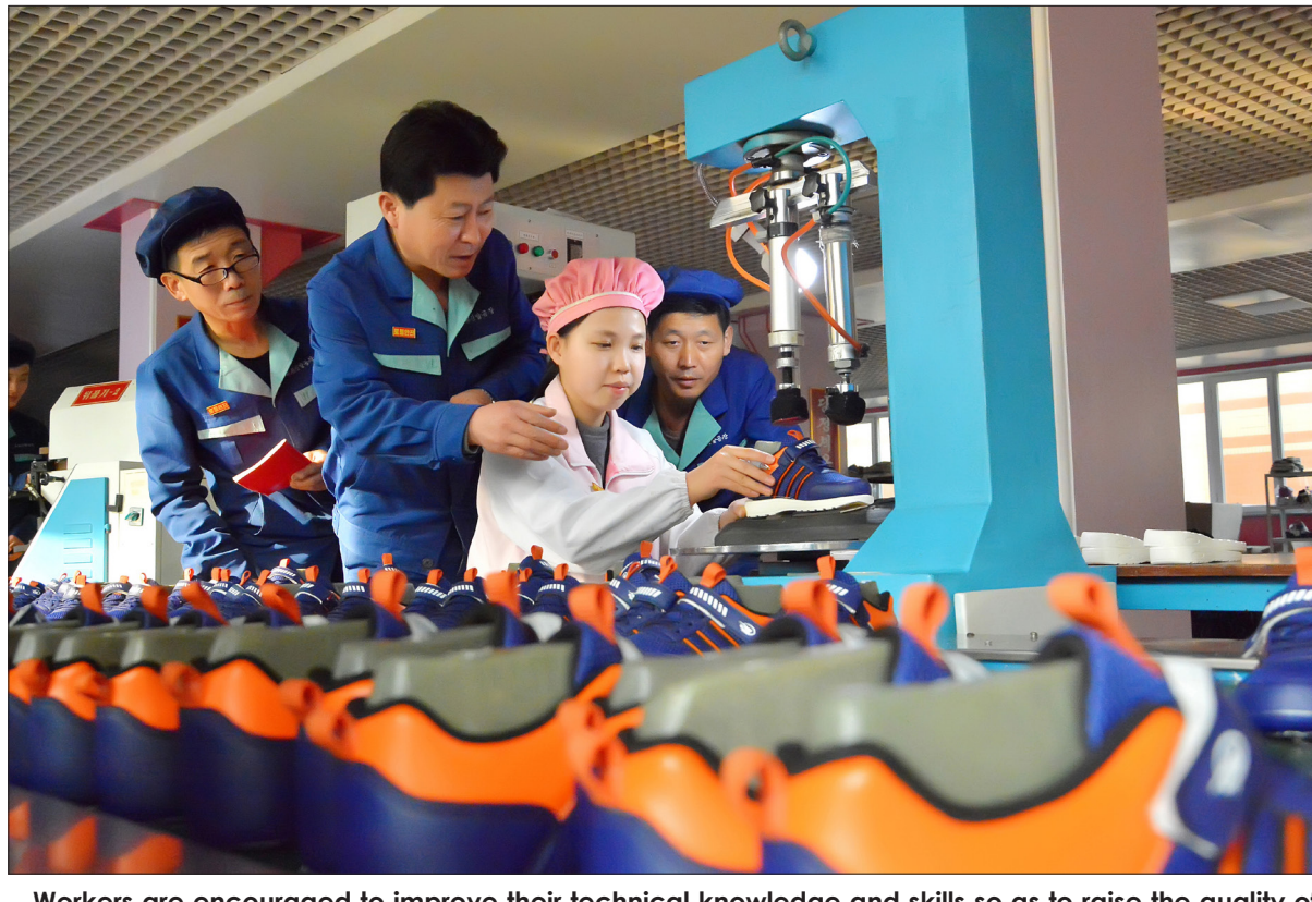
Workers are encouraged to improve their technical knowledge and skills so as to raise the quality of shoes for students at the Ryuwon Footwear Factory.

sports shoes for different This year alone, the factory sports like football, boxing,