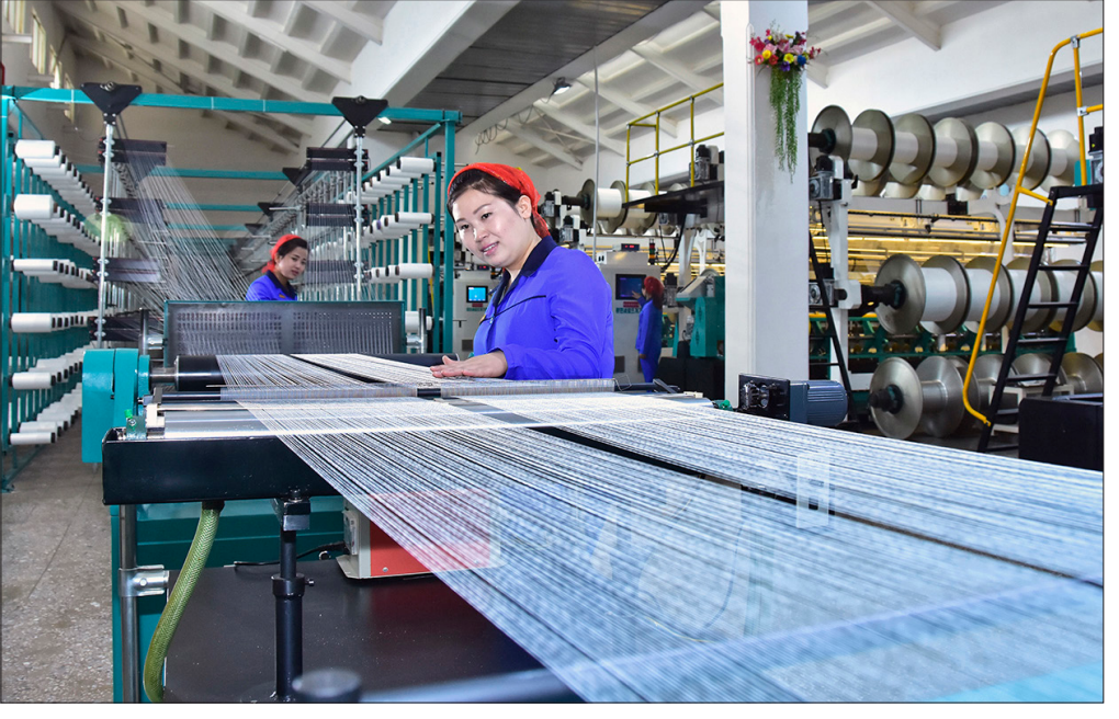
An employee observes cloth production while increasing the operational rate of loom at the Pyongyang Kim Jong Suk Textile Mill.

and willowing mixing machine, which had remained idle, and dozens of carding machines in other places and readjusted and restored them to raise the productivity of spun varn and remodelled elastic staff looms to raise the rate of their operation remarkably.