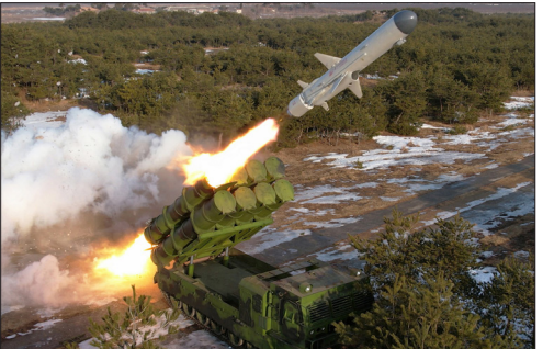
Kim Jong Un stresses need to thoroughly defend maritime sovereignty by force of