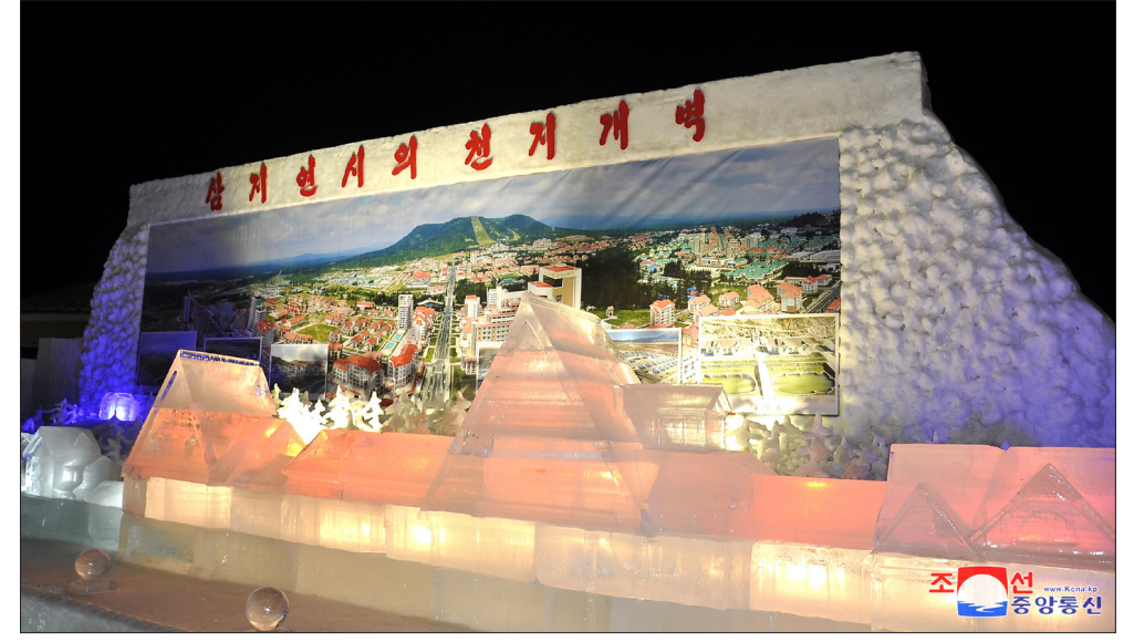
A scene of the Ice Sculpture Festival-2024 in Celebration of the Day of the Shining Star that opened on February 9.

There are also ice sculptures depicting the symbols national and reflecting the happy looks of people.