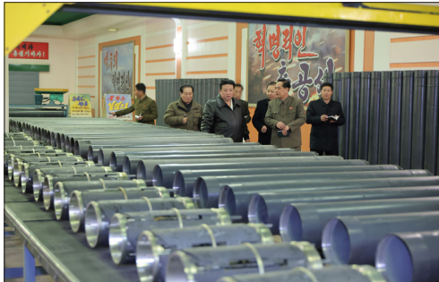
The leader sets forth important tasks for improving the quality of munitions