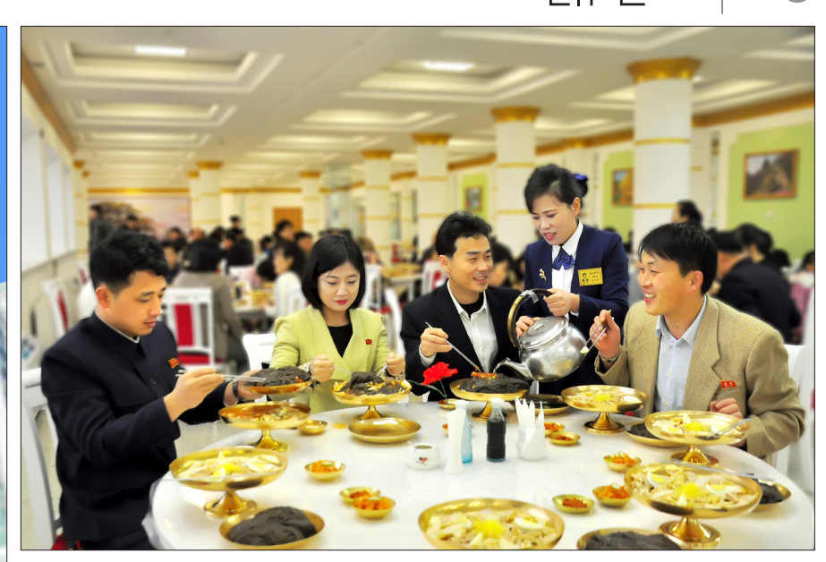
Working people are served delicious noodles at the Phyongnam Noodle House which has been given a faceliff.