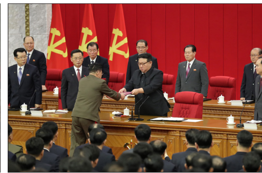
FROM PAGE 2

development 20×10 policy", which will open up an epochal turning phase in the course of struggle for the country's prosperity and people's well-being, is the most revolutionary strategic programme for developing regional industry which the General Secretary solemnly declared as a state policy on the basis of formulating its orientation with painstaking efforts for the improvement of the living standards of local people and determining even its feasibility in an all-round way by going through the stage of accumulating experience.