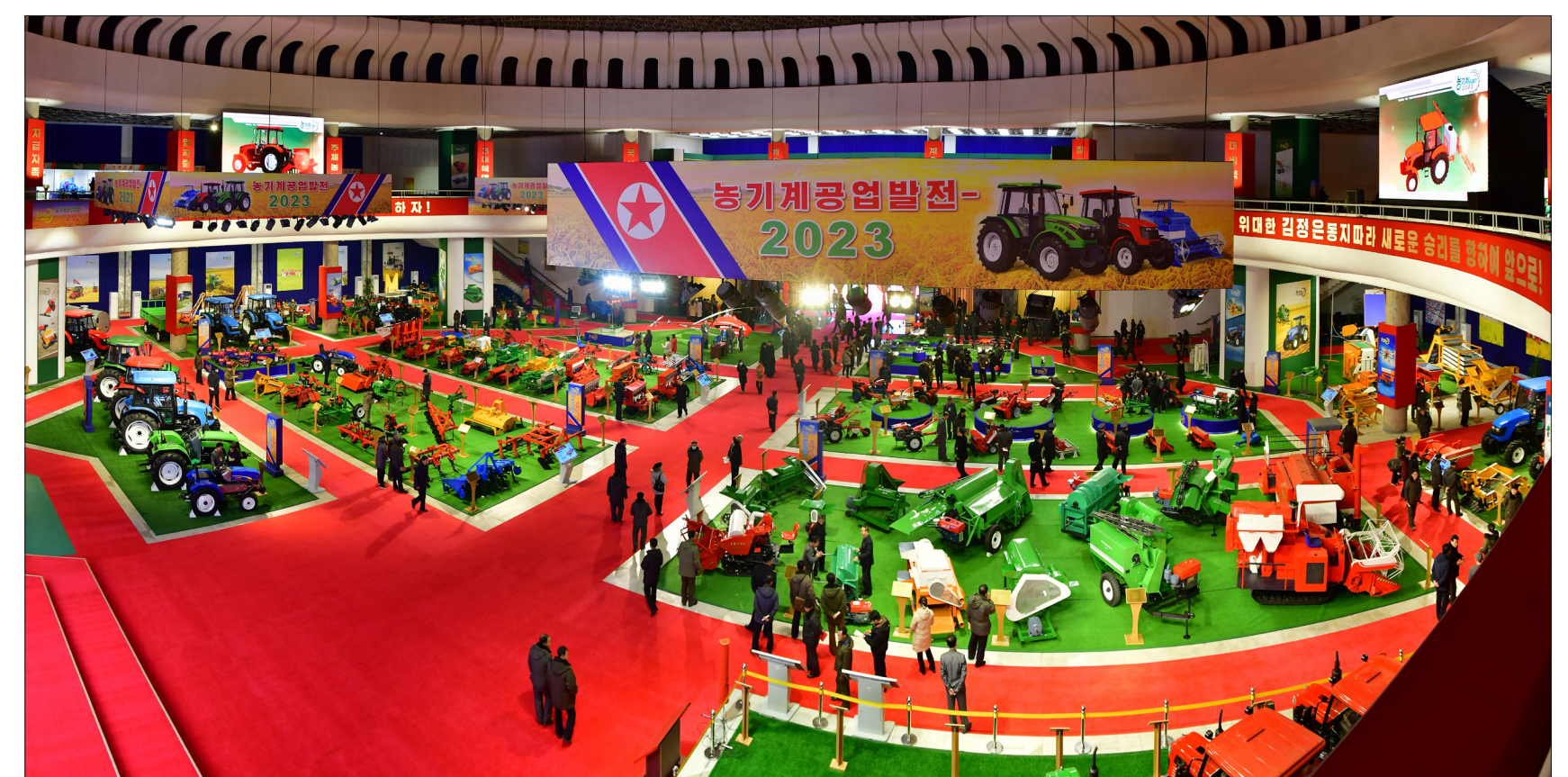
Visitors look round the farm machine exhibition "Development of farm machine industry-2023" at the Agriculture Hall of the Three-Revolution Exhibition House. PAK KWANG HUN / THE PYONGYANG TIMES

The combined thresher of dry field crops has been designed to thresh wheat, barley, maize and soybean by arranging two feeding sections and threshing ribs in a threshing drum in order to increase its utilization rate all the year round. As it has the high fine selection rate and quality, the crops can sell immediately after threshing.