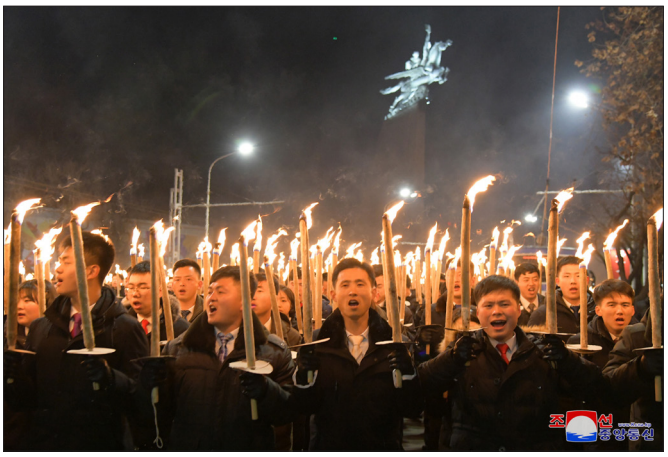
Young people hold a torchlight procession in Pyongyang on January 10.

At the end of the procession, the artistic motivational a performance at the Park Open-air Theatre.