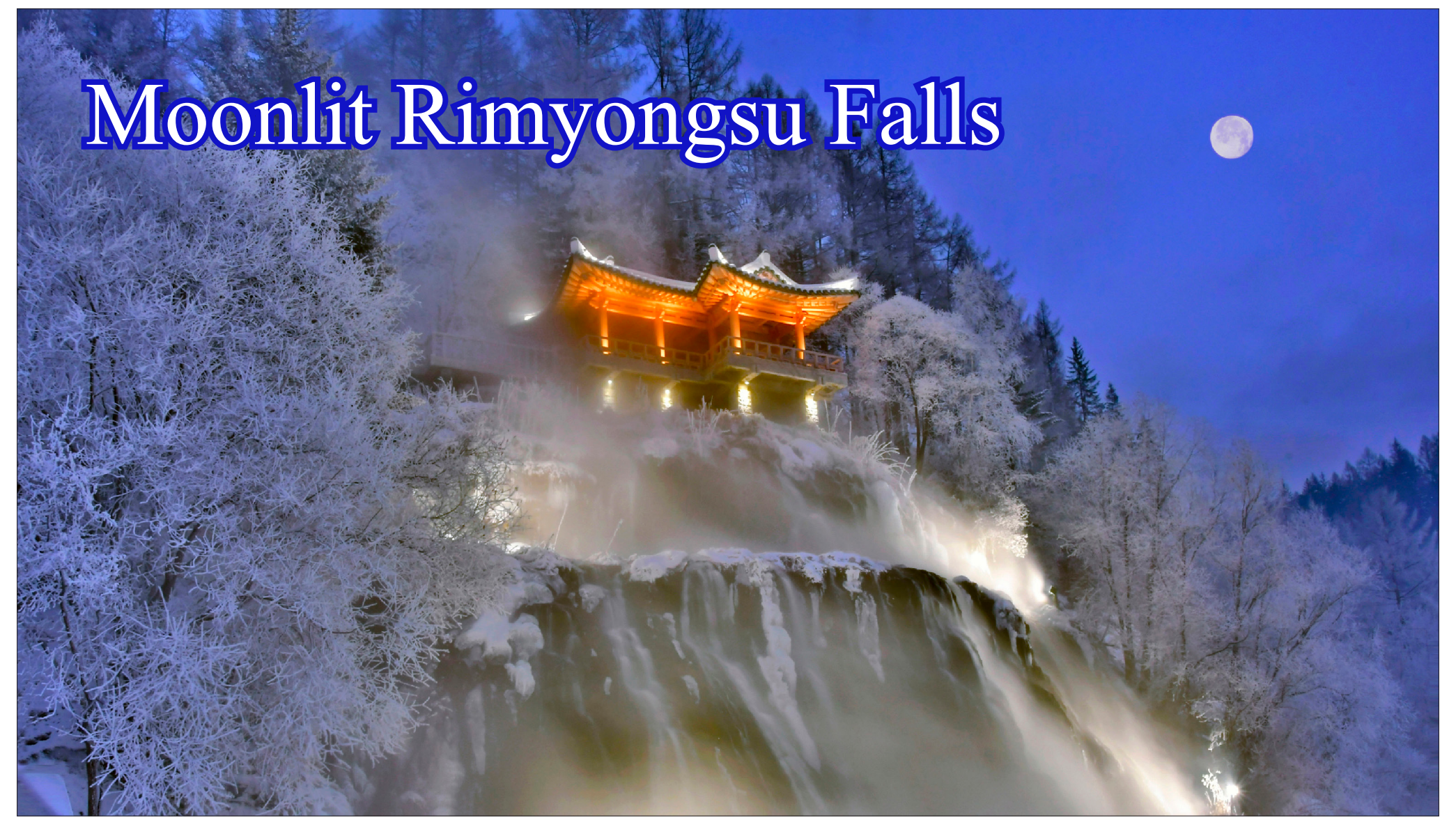
Rimyongsu Falls forms an iconic scene in the Mt Paektu area. Its real beauty is seen in winter, decorated with hoar frost. The falls against the backdrop of white frost forming on surrounding trees in the moonlight offers an enchanting view.