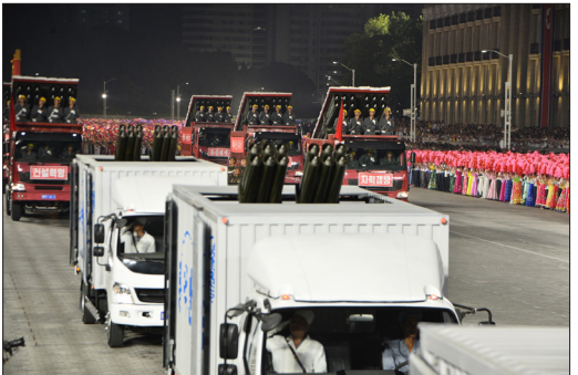
The paramilitary parade to mark the 75th birthday of the DPRK in September 2023 demonstrates to the world the development and modernity of the Worker-Peasant Red