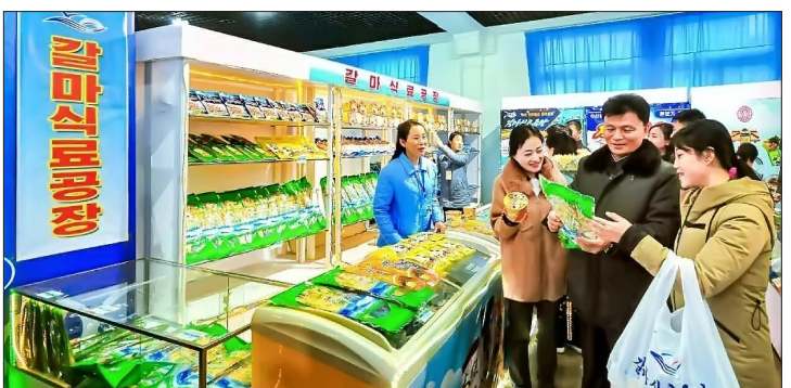
Scenes of the light industrial goods exhibition "Development of Light Industry-2023" (left), the Pyongyang Underground Store autumn commodity exhibition-2023 (top right), the national processed seafood products exhibition-2023 (below right).