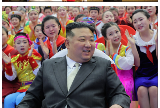
FROM PAGE 1

Mangyongdae Schoolchildren's Palace, instructors and schoolchildren of the palace burst into cheers full of great excitement.