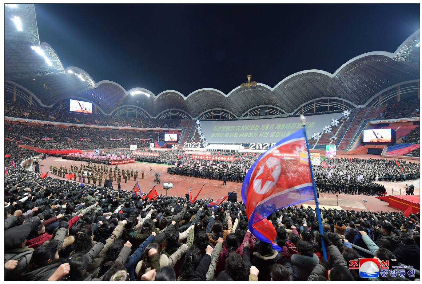
A meeting of Pyongyang citizens takes place at May Day Stadium in Pyongyang on January 5 to pledge themselves to thoroughly implement the decisions of the Ninth Plenary Meeting of the Eighth Central Committee of the Workers' Party of Korea.

Referring to the fact that the Korean people demonstrated the national strength and prestige of the powerful and dignified Juche Korea and made tangible progress and a leap forward under the leadership of the great Party Central Committee last year, he said all the successes they made provide clear evidence to the validity and vitality of the fighting programme of the Eighth Congress of the WPK which called for achieving a great new victory by remarkably strengthening