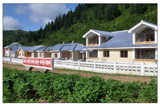
Rural communities are given a facelift.