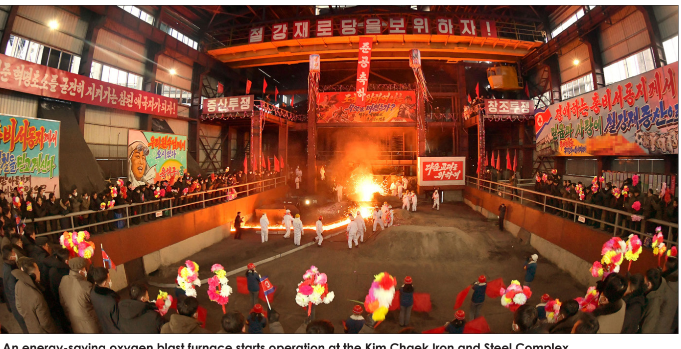
An energy-saving oxygen blast furnace starts operation at the Kim Chaek Iron and Steel Complex.