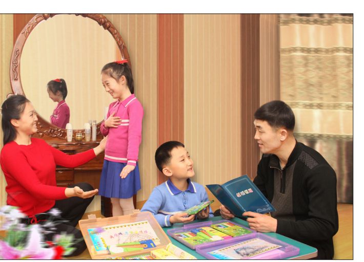
New school uniforms and school things are provided to all the students across the country.