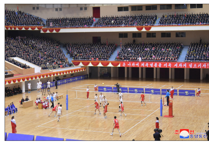
scene of the volleyball match played at Pyongyang Indoor Stadium on December 31 2023.