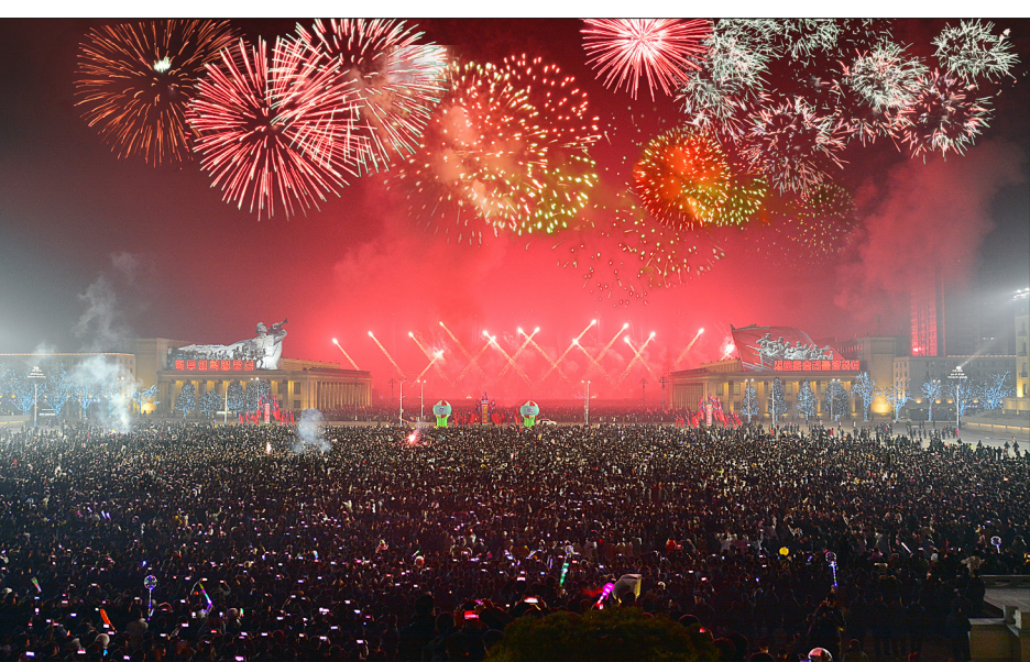
Fireworks light up nocturnal sky over the capital city of Pyongyang to rev up the festive mood on the occasion of New Year.