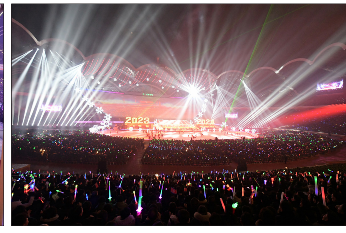
FROM PAGE 3

Presidium of the Political Bureau of the WPK Central Committee, and other leading officials of the Party and government and officials of armed forces organs.