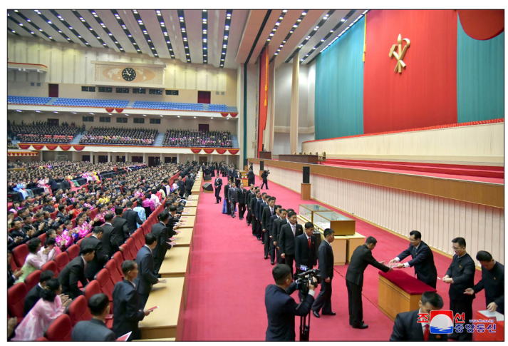
Labour innovators receive the gift list at the Pyongyang Indoor Stadium on New Year's Day.