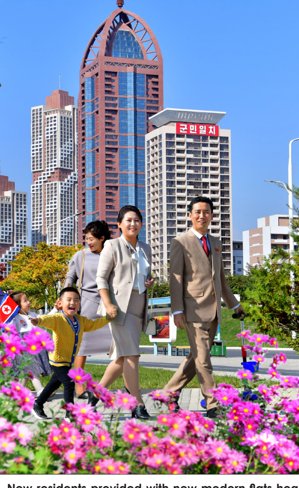
New residents provided with new modern flats head for their homes on Hwasong Street.