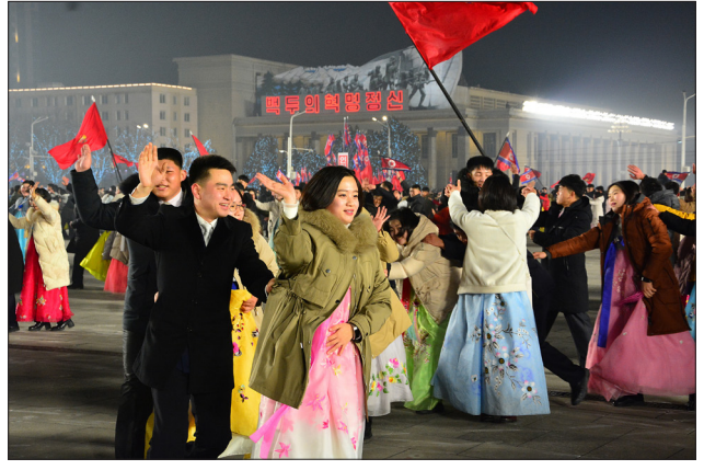
Young Koreans hold an evening gala at Kim II Sung Square in Pyongyang on December 31 2023 to celebrate the New Year 2024.

The participants were full and students took place at of honour and pride of being the youth of a powerful Pyongyang, the capital of country, who are all out the DPRK, on December 31 to bring earlier the bright future of Korean-style socialism, firmly rallied Amid the playing of the around the Party Central Committee with loyalty and patriotism.