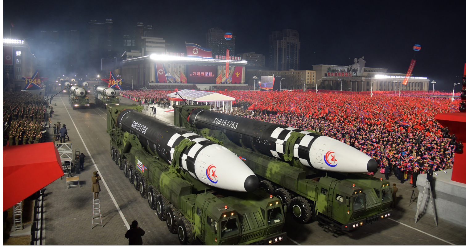
A military parade is held to mark the 75th anniversary of the founding of the Korean People's Army.