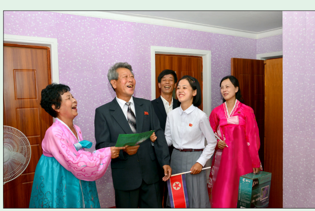
A family moves into their new house in the Taephyong area, Mangyongdae District.