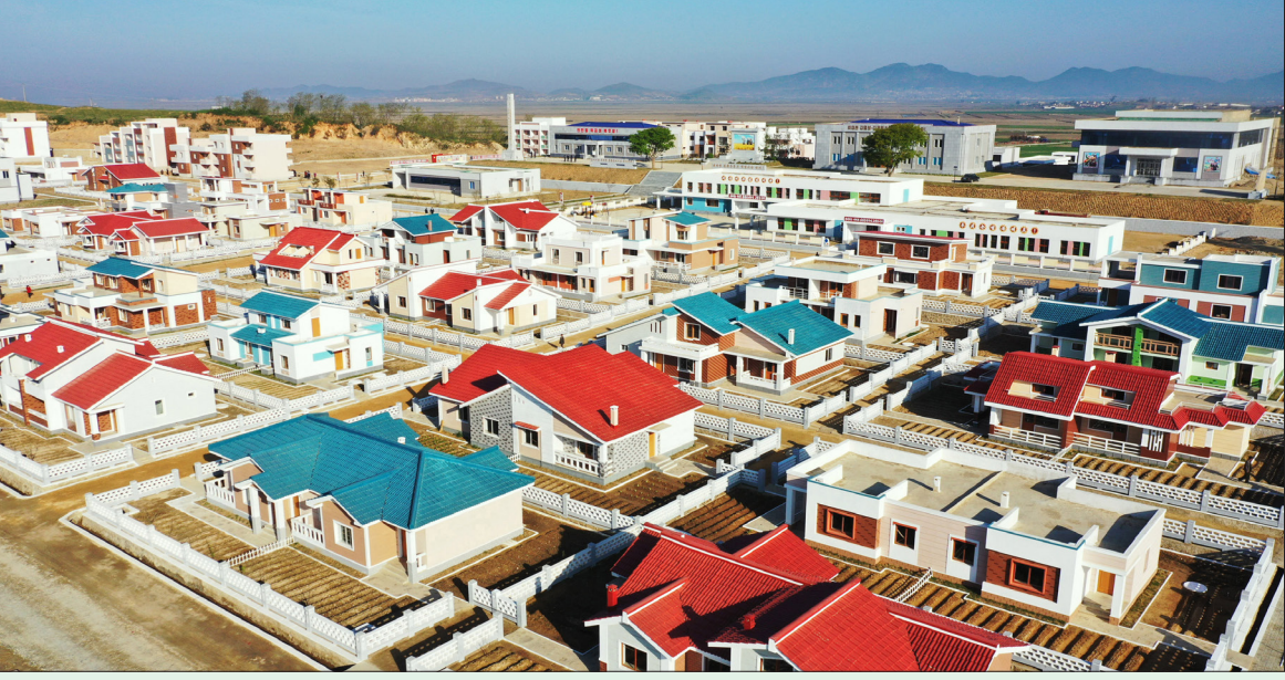
Farmhouses are built to meet the regional characteristics.