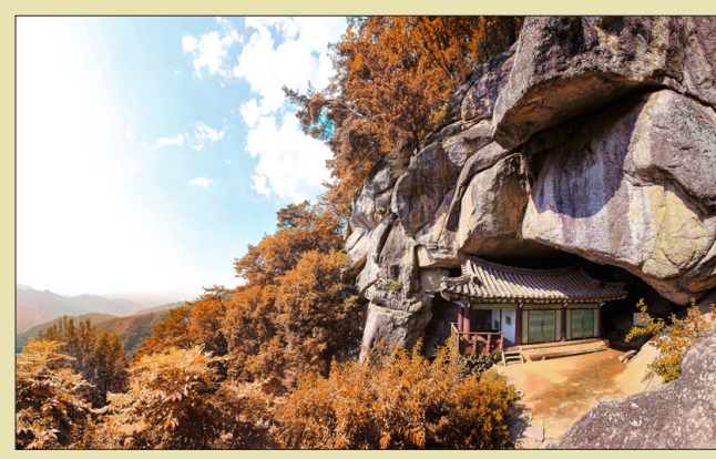
The Tangun Shrine.