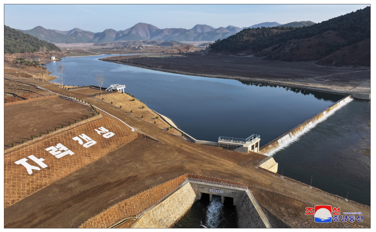
The completed Hwangju Kindung waterway, another large irrigation system in the DPRK, irrigates the vast farm fields in Hwangju and Yonthan counties of North Hwanghae Province.

After the ceremony participants went round different parts of the waterway.