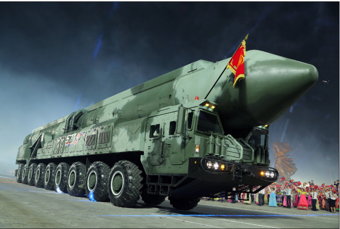
Scenes of the military parades to celebrate the 70th anniversary of the Korean people's victory in the Fatherland Liberation War and the 75th anniversary of the founding of the DPRK.