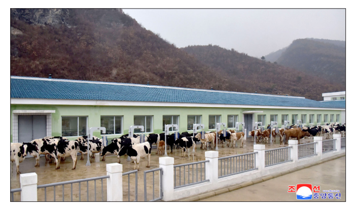
The Songgum Livestock Farm is inaugurated in Kangdong County of Pyongyang on November 27.

Amid the cheerful dancing provided to supply tasty and of agricultural workers who would enjoy a happy life in the new rural village, officials shared joy with the owners of new houses and looked round the branch milch cow farm, the assorted feed production workteam and other parts of the farm.