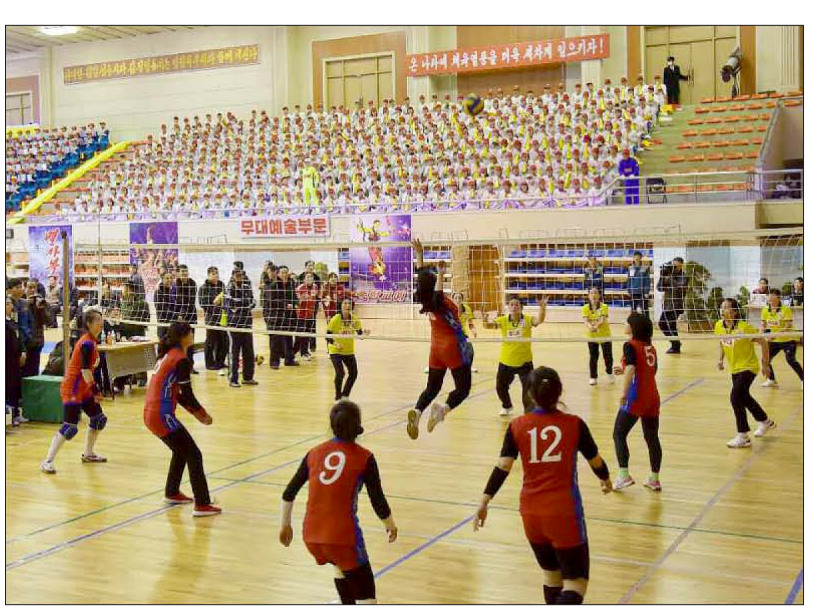
The 53rd sports contest of artistes takes place at the Basketball Gymnasium on Chongchun Street in Pyongyang on November 29-30.