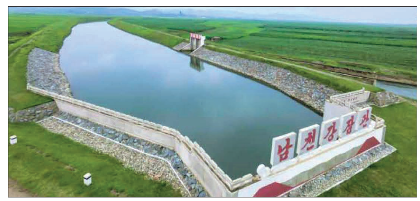
A partial view of the Chongchon River-Phyongnam irrigation waterway.

This signalled the start of the grand nature-remaking