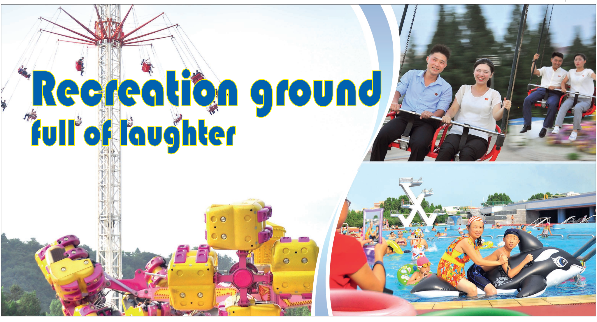
The citizens of Pyongyang have a pleasant time at the Rungna People's Recreation Ground.