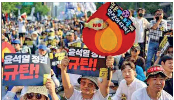
People from all walks of life stage a protest demonstration against the Yoon Suk Yeol regime.

discharge of nuclear waste water. Media said that people from all walks of life, enraged by Japan's discharge of nuclear waste water at sea, are carrying on candlelight struggle and other practical actions to check the discharge and they are getting more angry at Yoon Suk Yeol who left their lives and security to the mercy of the