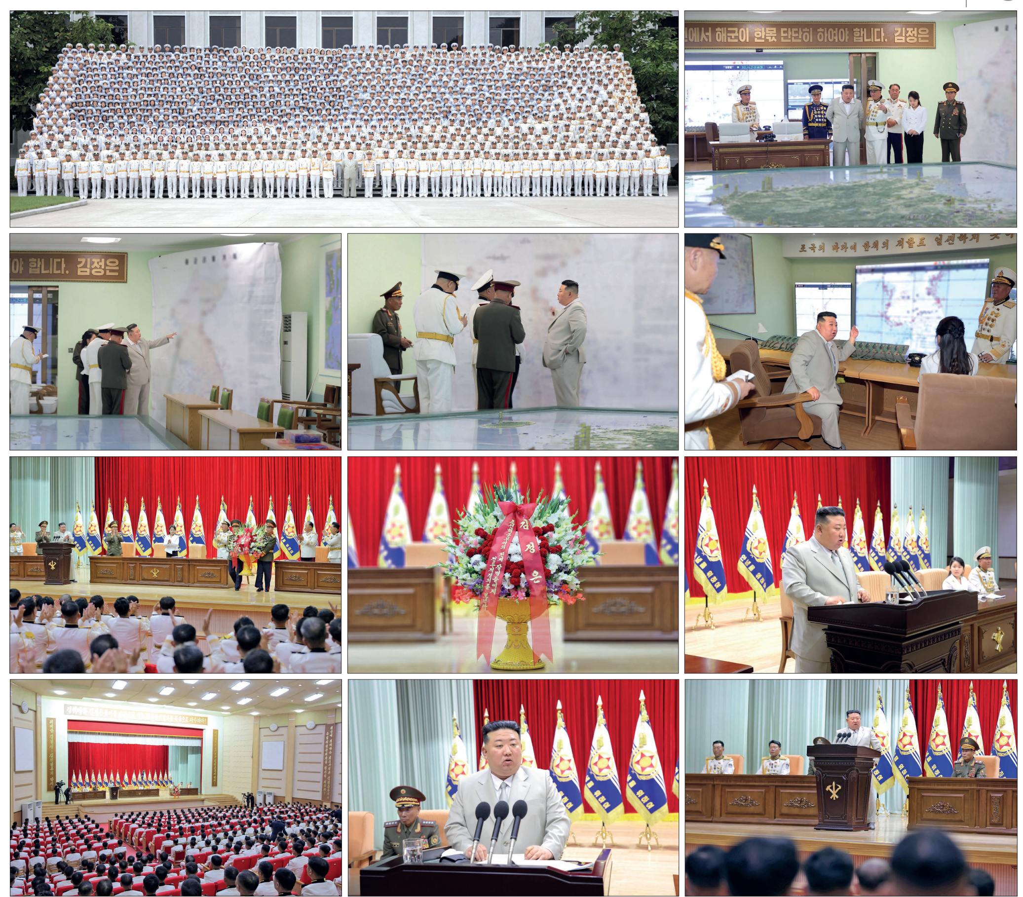
FROM PAGE 2

Guided by the commander of the Navy, he visited the operation command centre. He heard a report on the enemy movements and on the operation situation