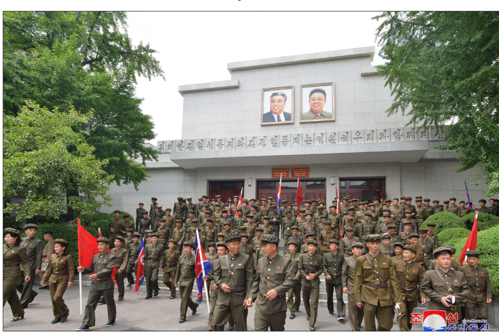
Commanding officers and members of the battalions of Party members hold oath taking meetings from July 6 to 10.

Officials, Party members up to the trust and expectation to fulfil the oath they and other working people in of the respected Comrade made before the Party the relevant areas saw off flag through strenuous along streets the battalions Oath-taking meetings of practice, not by words, leaving for the rural commanding officers and become the inexhaustible construction sites at the foot