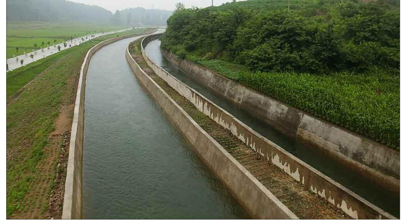
A part of the River Chongchon-Phyongnam irrigation waterway.

The completion of the River of Chongchon-Phyongnam Chongchon- irrigation waterway makes irrigation it possible for farmers nature-harnessing project to unaffected by any drought into Lake Yonphung by seething with enthusiasm for implementing the programme lake, thus making it possible new era and help develop the beautifying the river as a river improve the local people's