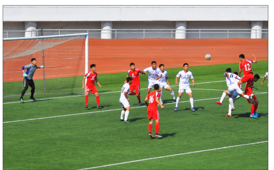
A scene from the second-round match in the men's premier league between the Pyongyang and Amnokgang teams.

They include the Sonbong, Pyongyang and Hwaeppul teams in the men's contest and the