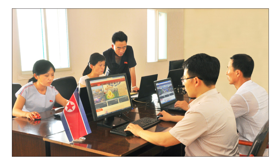
Officials of the Intellectual Property Office hold a discussion on the operation of the exhibition.

The "heat-bonded nonsaves oil, reduces work in woven fabric production the process to lessen soil method using fibre remnants compaction and provides from weaving" and "lags favourable conditions for the made by using fibre remnants" are applicable to The "horizontal axis clothes-making and textile and lagging materials from In the generator the setting fibre remnants, waste from