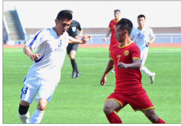
A scene from the match between the Ministry of Light Industry and Sonbong teams in the men's premier league.

The Rimyongsu, the lowest in the first-round rankings, jumped up to the fourth place