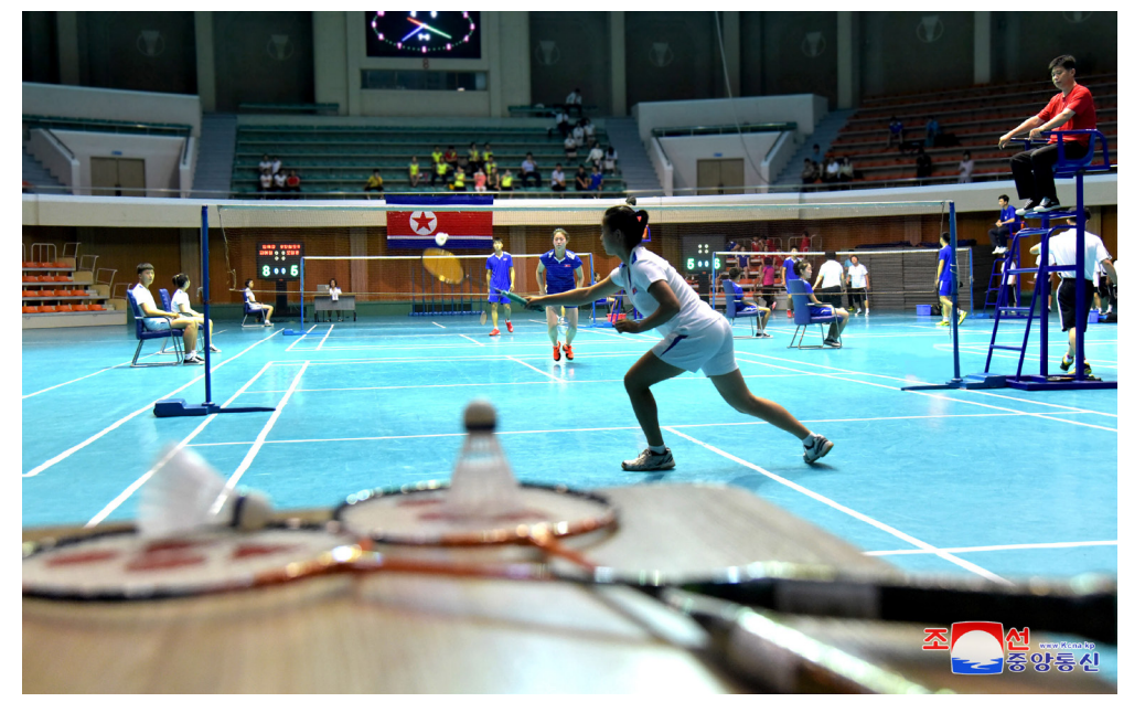
Matches are held on July 5 to mark World Day of Badminton at the Badminton Gymnasium on Chongchun Street in Pyongyang.

There were demonstration matches of badminton players and amateurs and a technical course.