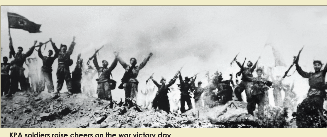
KPA soldiers raise cheers on the war victory day.

DPRK, created an immortal strength produced world- blood and life unsparingly Thanks to the honourable perform with credit the great mission of the descendants of