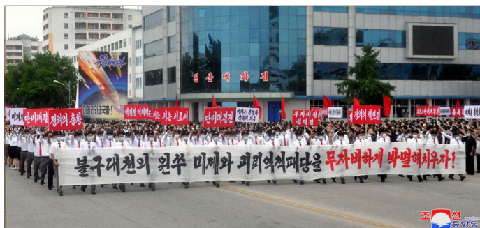
Mass rallies take place in all provinces of the DPRK on June 25, the day of struggle against US imperialism

another reckless war, they will to give them their quietus turn out in a sacred war against and accomplish the cause the US and the puppet clique of national reunification.