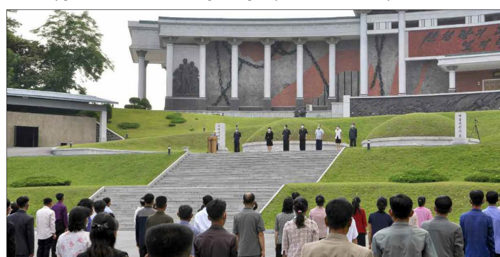
Agricultural workers and members of the Union of Agricultural Workers of Korea get together in front of the Sinchon Museum to vow vengeance on enemies.