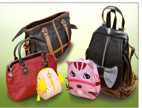
Various kinds of bags produced by the housewives' workshop of the Phyongsong City Commercial Agency.