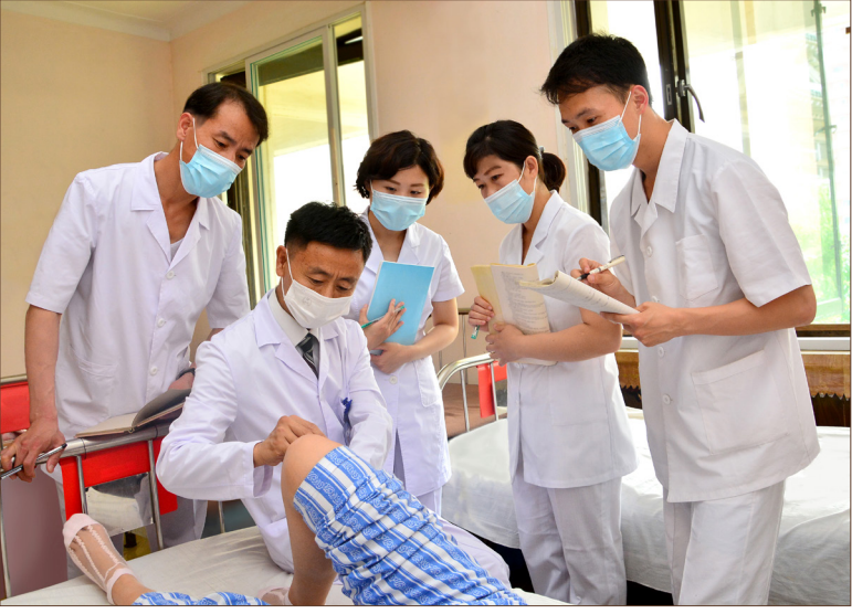
Doctors learn about Koryo therapies and their efficacy during inservice training.

in-service training schools It ensured lecturers attached methodological guidance over the students who are in-service health workers and frequently arranged It also circulated the teaching practical training at and tours of