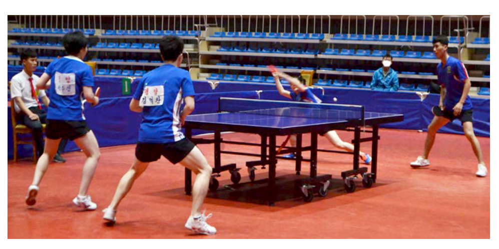
A scene of a mixed doubles between the Kigwancha and Pyongyang teams.

"I played the final match very composedly with