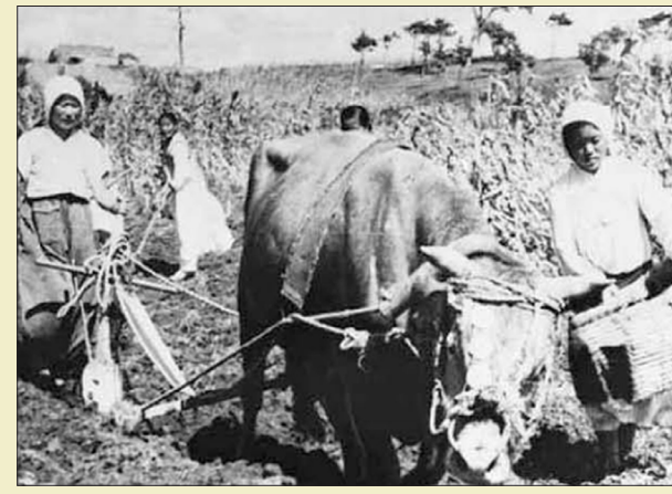
Photos show people carrying ammunition with KPA soldiers and rural women ploughing land to increase food 000-strong enemy force for increasing food production production in the wartime years.