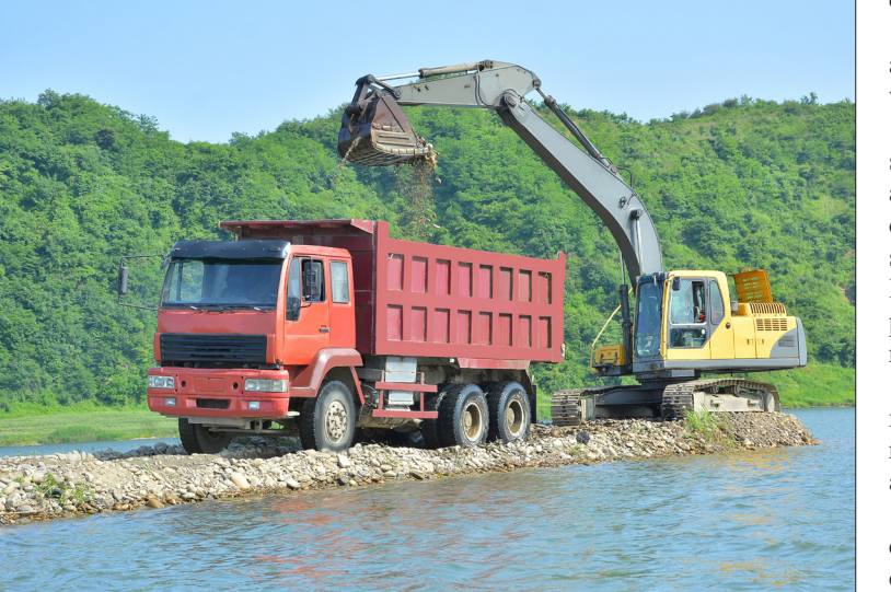
An excavator loads a truck with aggregate at the Phyongsong Aggregate Production Company.

By joining efforts with his employees, he repaired machines Its working site adjoins the kept idle in other units and connected shoals with each other to build a road There was an islet made up of in the middle of the river so as to gravel and sand washed away along dredge the river with an excavator, the Taedong River several years instead of a dredging vessel. While ago. It used to cause flood in the training them to be technicians and rainy season, inflicting damage on skilled workers, he consolidated has removed hundreds of thousands the production foundations of the of cubic metres of gravels and