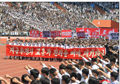
Mass rallies take place in different parts of Pyongyang, including May Day Stadium, on June 25, the day of struggle against US imperialism.