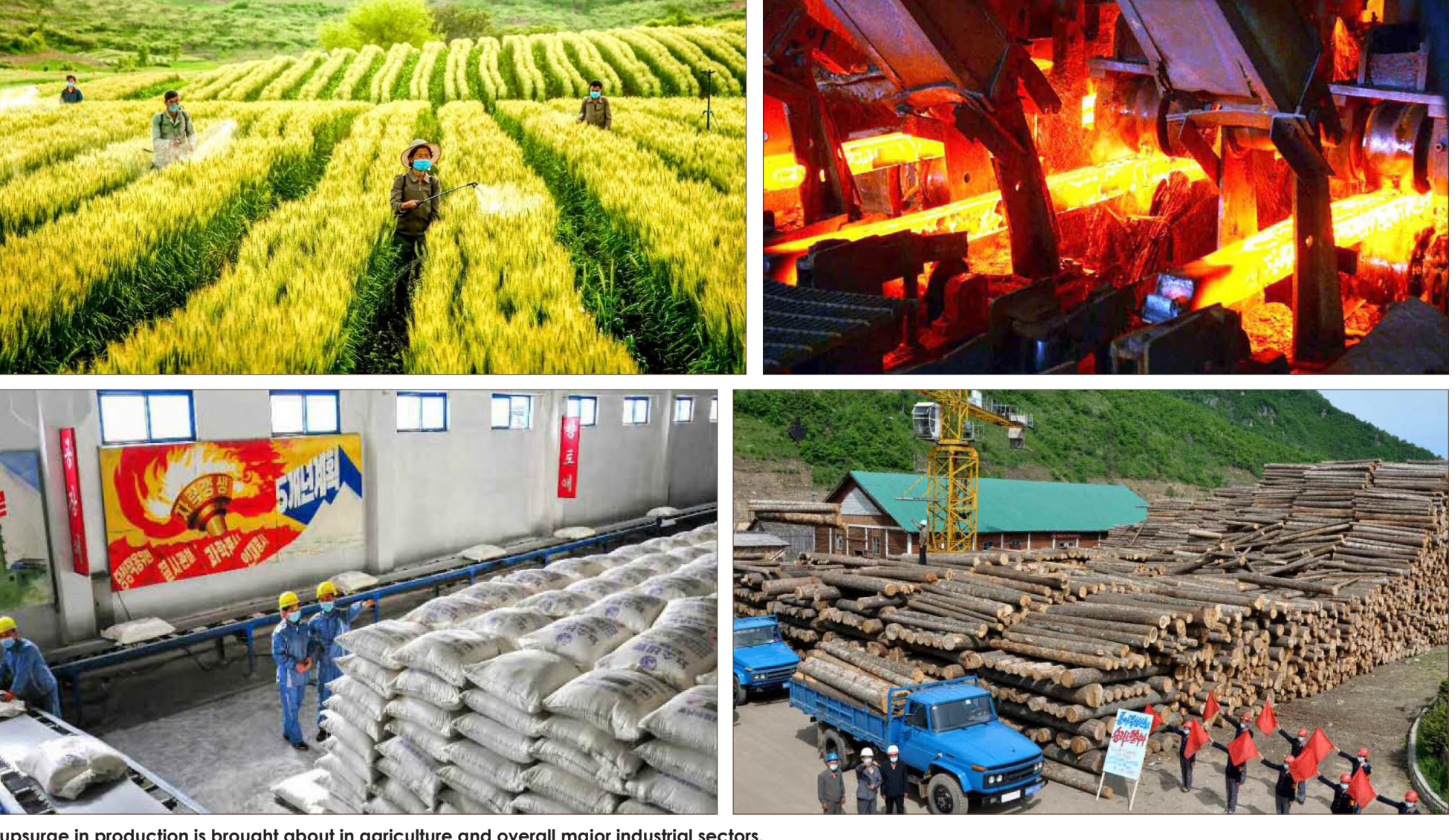
An upsurge in production is brought about in agriculture and overall major industrial sectors.

Officials and workers in the fisheries sector are