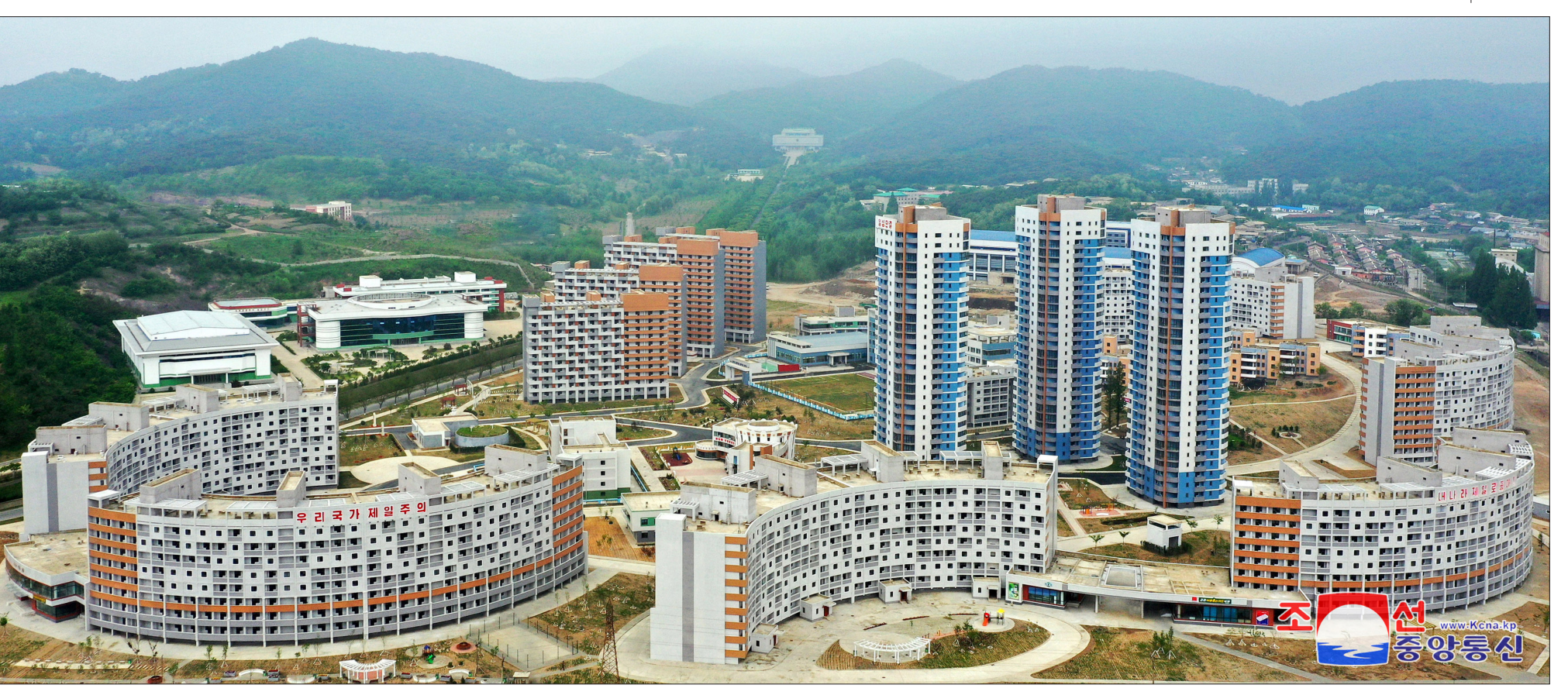
A bird's eye view of new apartment houses in the Taephyong area in suburban Pyongyang.

makes consistent efforts with The district pushed the a sense of mission that they work to strengthen teaching are masters of education, can forces and enhance their they produce due results in the qualifications consistently educational development of