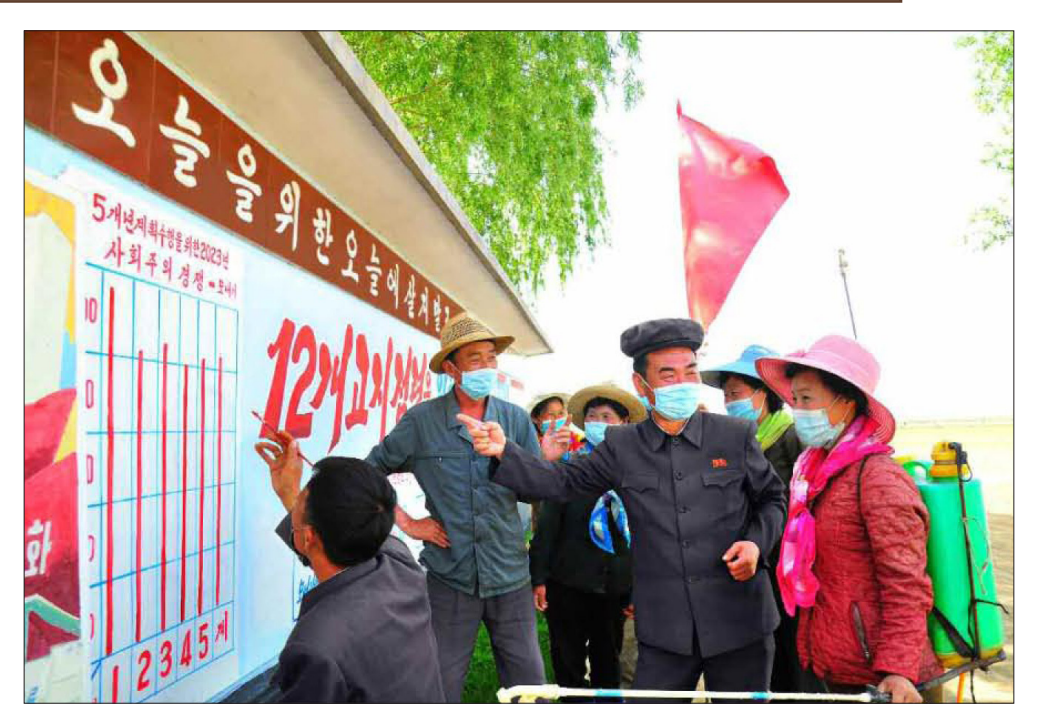
Agricultural workers are competitive at the Honam Farm in Jongphyong County

With competitions being term socialist emulation drive arranged an emulation drive counties and farms in the Province conducted vigorous Now, the UAWK cereal production goal.