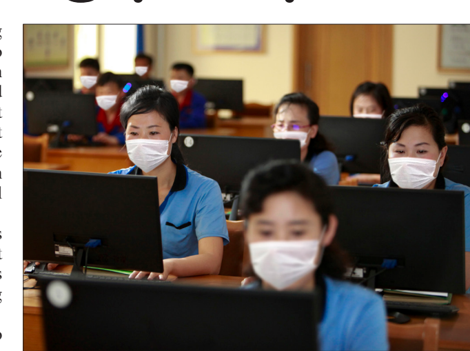
An increasing number of workers attend online lectures at universities.

Factory and many other conditions for study In particular, the online units set themselves the