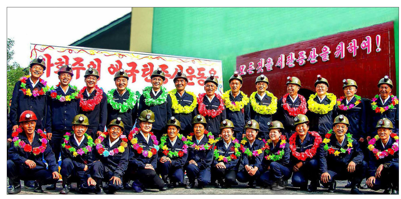
A coal miners' workteam has a group photo session after fulfilling their daily plan at the coal mine for supplying coal to Jagang Province under the Kaechon Area Coal-mining Complex.

mines of the Kaechon Area Coal-mining turned out in the increased coal production campaign all at once and innovations This motivated them to their tunnelling plan for miners received more than have been made in all working places across the