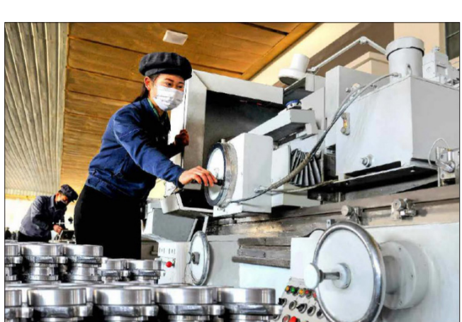
A girl operator processes hydraulic rock-drills in the newly-built production line.

Rock-drill Factory drill. serial way. has established a It was praised in The factory is now production line of new-type exhibitions held on a producing