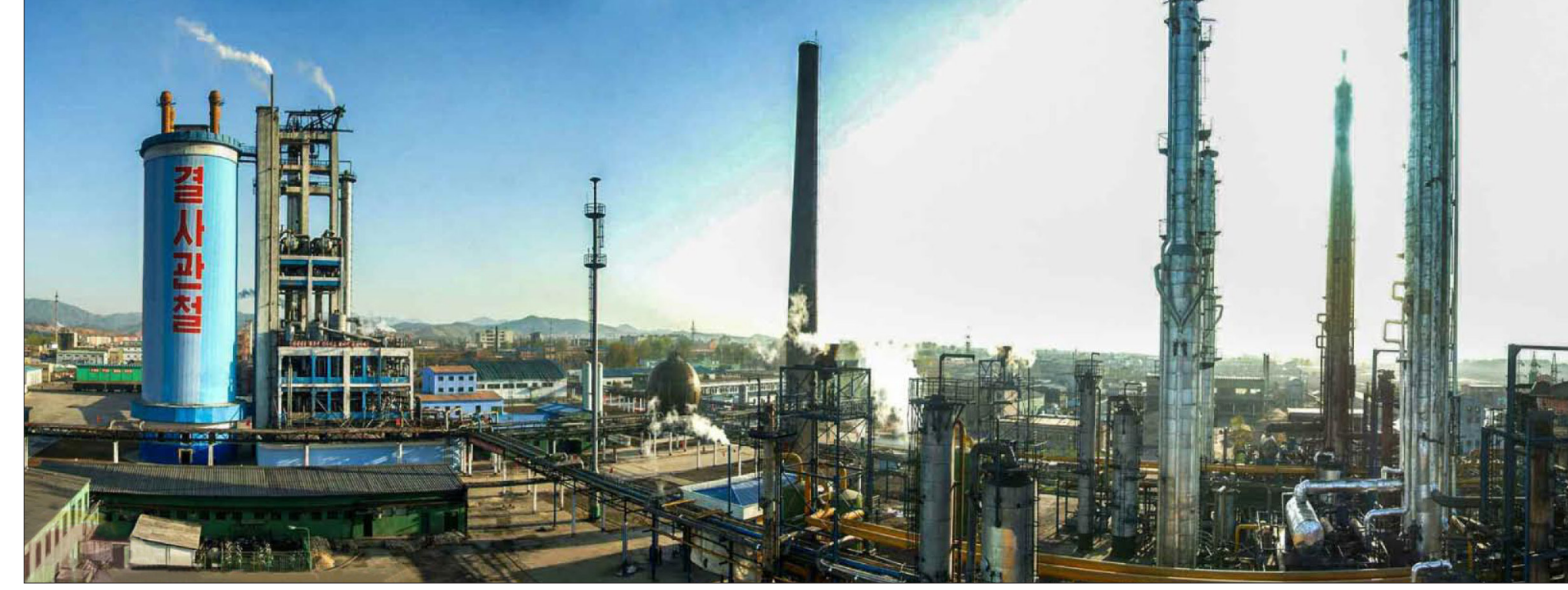
The Namhung Youth Chemical Complex makes a big step forward in current production and readjustment and reinforcement. RODONG SINMUN

scheduled through a mass has taken prompt measures to machines ensure a greater in putting its operation on a marshalling yard passenger of the country with each