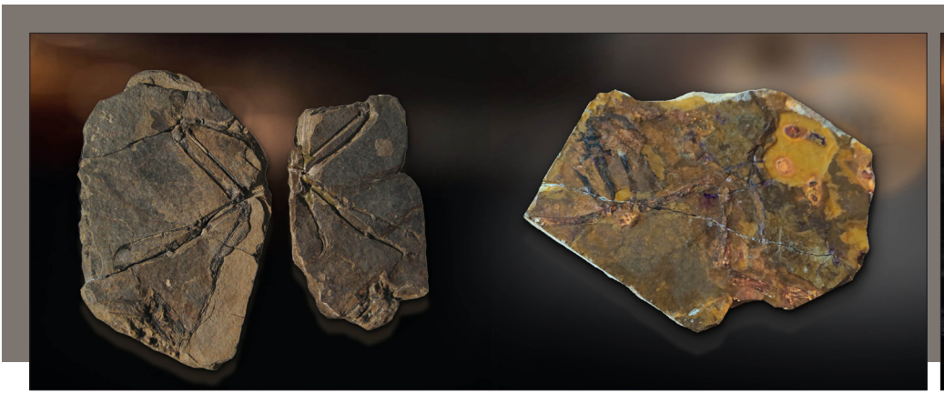
Fossil of Korean archaeopteryx (left) and fossil of progenitor of frog (right).

Experts are of the opinion that when more extensive research on the Sinuiju biocoenosis is conducted, more significant progress will be made in the study of not only the biota in the Lower Cretaceous of the Mesozoic era in Korea but also that of the Mesozoic era in Northeast Asia.