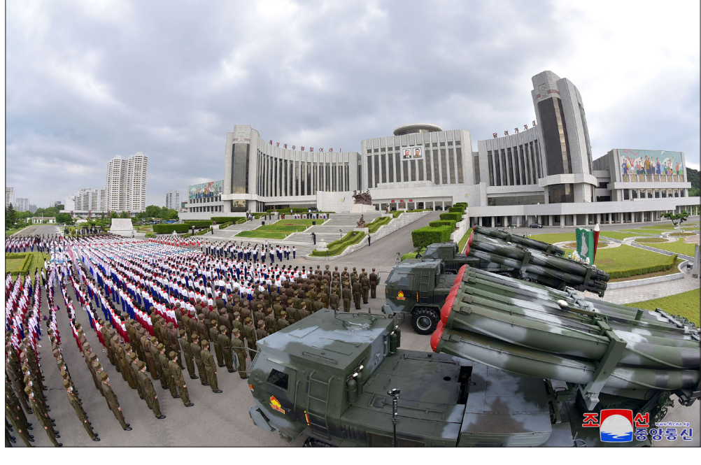
Schoolchildren meet with KPA soldiers in front of the Mangyongdae Schoolchildren's Palace on June 6 to convey Sonyon multiple rocket launchers.