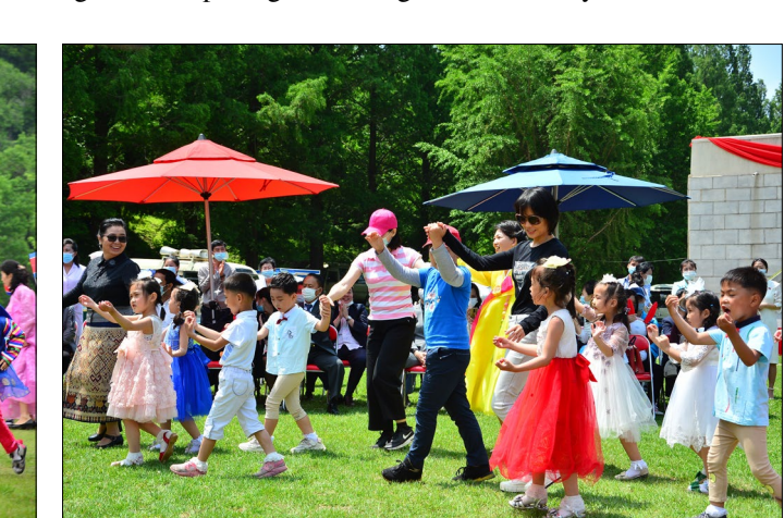
Children's sports and amusement games take place at the Taesongsan Pleasure Ground on June 1.

envy by studying well (hourglass drum) stunts and and women also attended the were held in provinces to Sun, from childhood, respecting doll dance staged by talented games, deepening the feeling mark the day.