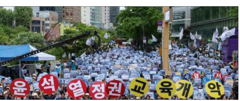
A rally of the National Teachers Union is held to criticize the educational policy of the Yoon-led group of traitors in south Korea.

demands for "enactment of a of educational conditions large-scale demonstration in an after-storm is expected.