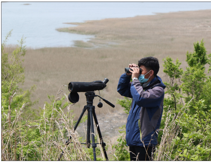
Researchers from the biodiversity institute of the State Academy of Sciences conduct a field survey of focal points