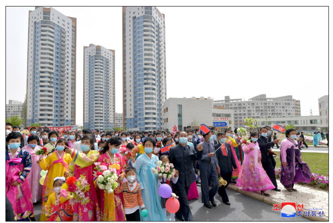
An inauguration ceremony of dwelling houses is held in the Taephyong area on May 21.