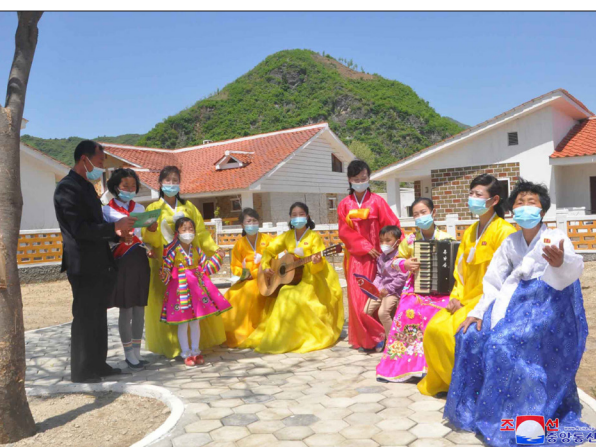
Modern farmhouses are built in many rural villages across the country.