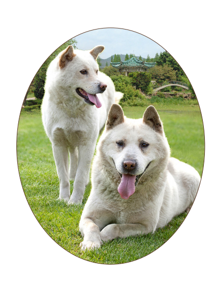
By Choe Yong Nam PT

ach country has symbolic animals reflecting its time-honoured national history and excellent disposition and ability. The dog is one of them.