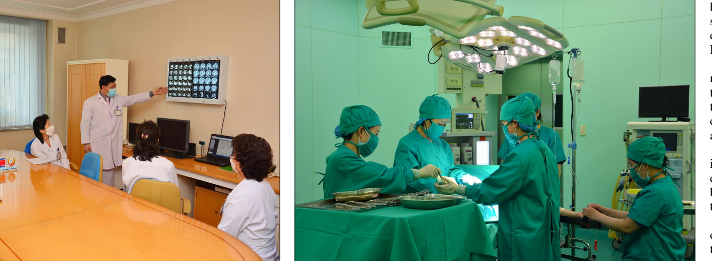
Medical workers have an online diagnosis consultative meeting and perform an operation at the Breast Tumour Institute.

high reputation among the pregnant in five months after