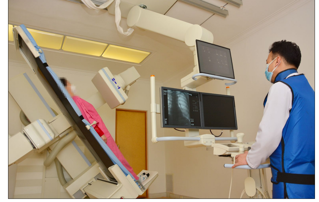
A doctor x-rays the breast of a woman at the Breast Tumour Institute of the Pyongyang aternity Hospital.