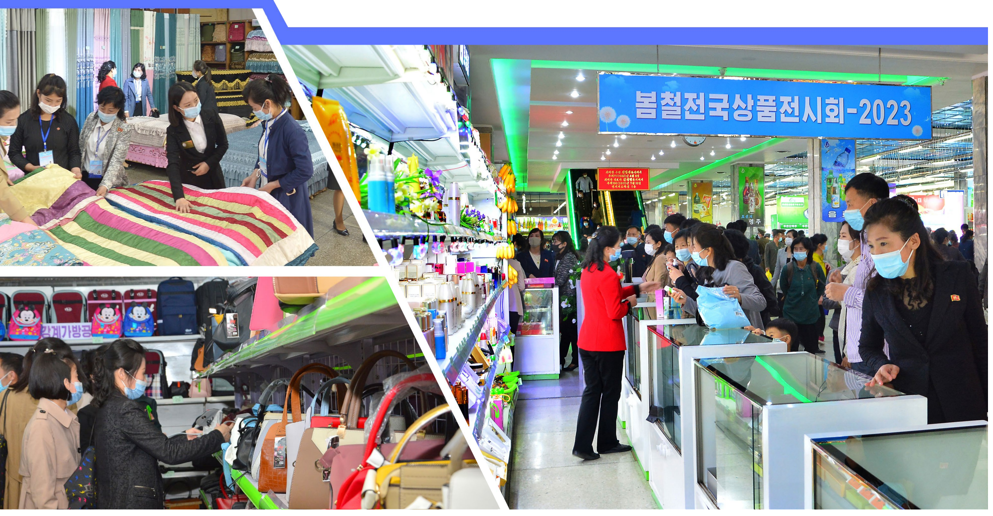
Many people visit the spring national commodity show-2023 held from April 28 to May 9.