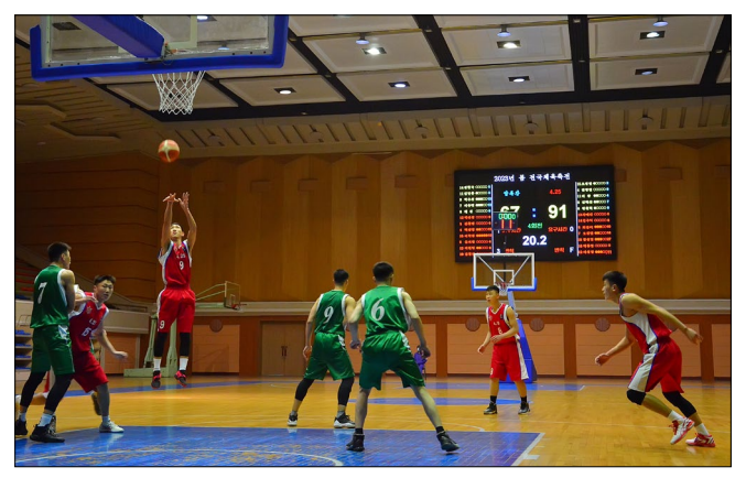
A glimpse of the basketball match between April 25 and Amnokgang teams.

The festival consisting of more than 540 events of 31 sports drew the attention of many from the beginning.