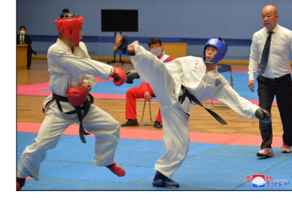
A Taekwon-Do player of the Pyongyang municipal team makes a kicking attack in the sparring event.

Each team consisted of ten kickers, but only one or no player could score in a match, which showed that penalty kick is not that easy. Those who rendered distinguished services in the event were goalkeepers. The spectators burst into enthusiastic applause when they blocked shots or narrowly saved them.