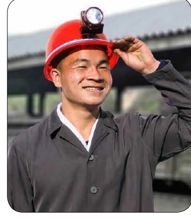
youth shock brigade of the Chonsong Youth Coal Mine

was showing deep concern work hard instead of him.