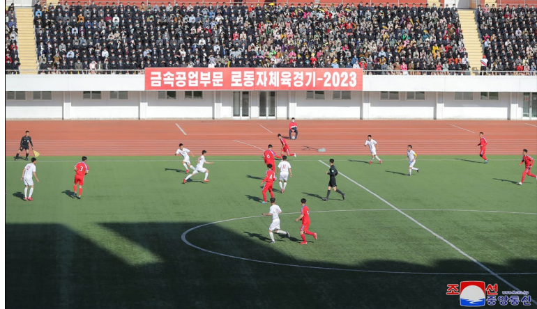
A football final match of the sports competition of workers in the metallurgical industry sector-2023 is played at Kim II Sung Stadium in Pyongyang.

latter 2-0. It was followed by the people in the country on the