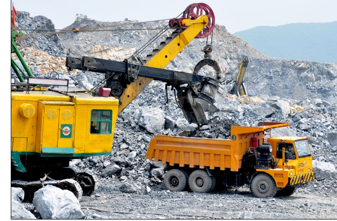
The Sangwon Cement Complex continues to increase the production of cement.