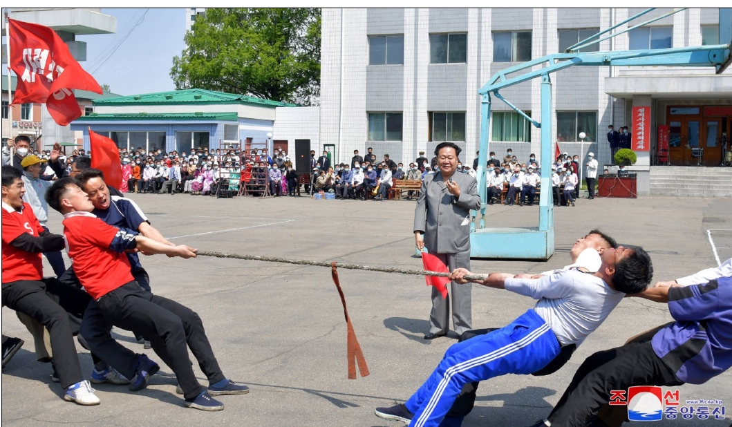
Senior officials of the Party and government commemorate May Day together with working people at industrial establishments