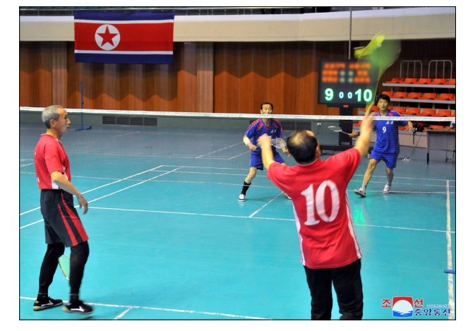
Old players compete in the spring sports competition of the aged at the Badminton Gymnasium on Chongchun Street in Pyongyang.

The elderly players scored points in succession with actions as prompt as those of young people and refined skills including push in the forward line and light strike, eliciting the admiration of spectators.