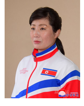
By Kim Hak Chol PT

Finally, the Pyongyang beat Naegohyang 2-1 to lift the trophy and the Naegohyang and the Rimyongsu came second and third respectively in the female soccer tournament of the 2023 spring national sports festival.