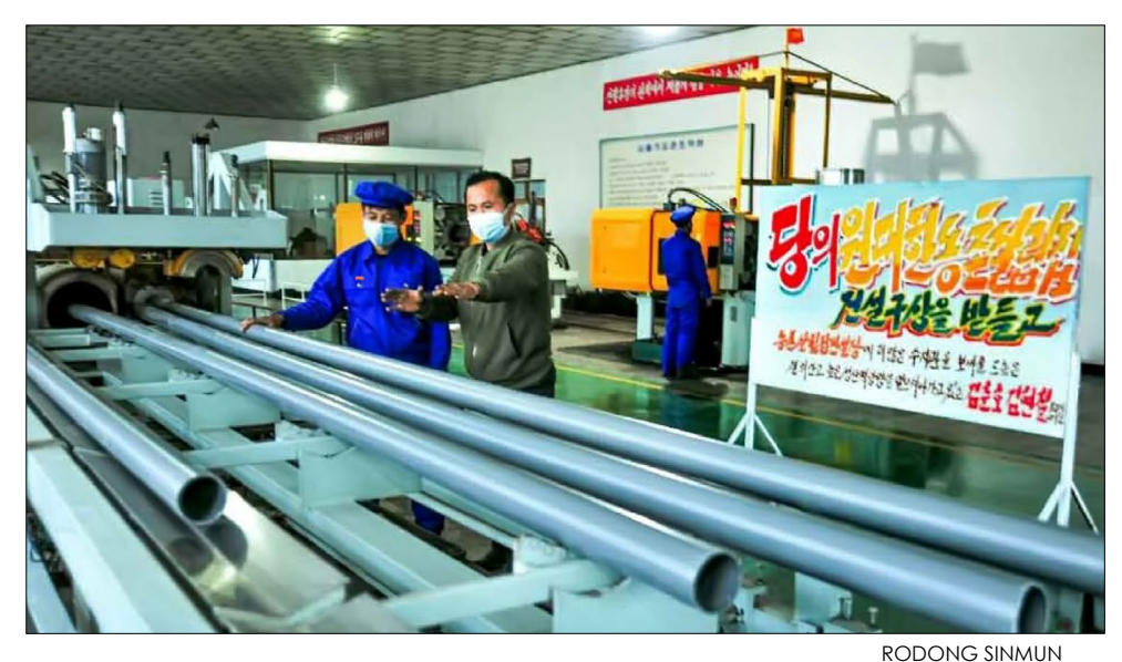
The production of plastic pipes keeps going on a regular basis with local materials at the Chongjin Plastic Pipe Factory.