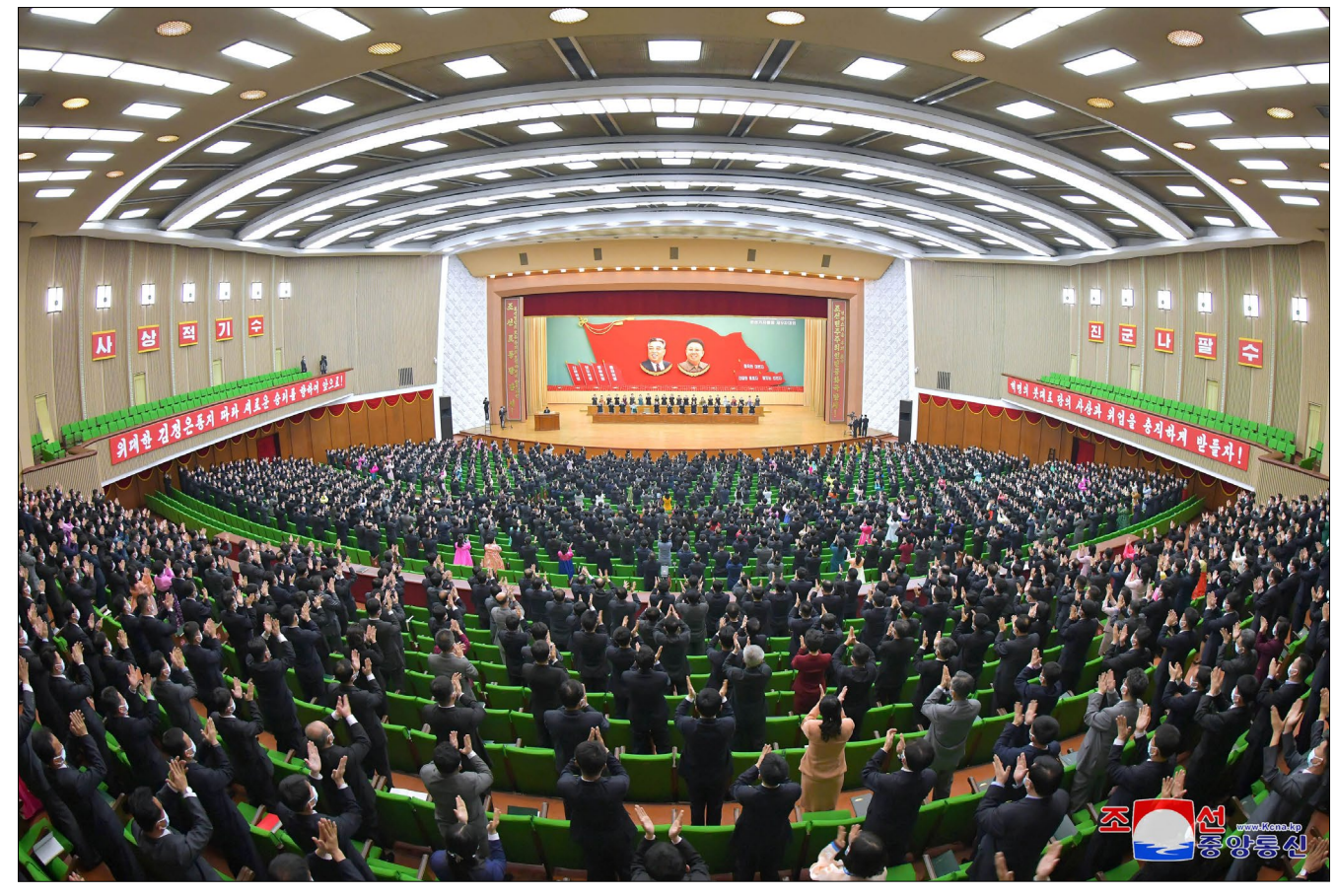
The Ninth Congress of the Journalists Union of Korea is held in Pyongyang on April 3-4.