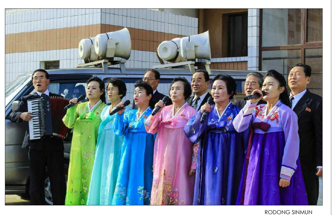
The artistic motivational team of meritorious stars stages a chorus at the construction site for 10 000 flats in the Hwasong area in Pyongyang.