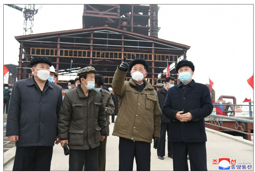
Premier Kim Tok Hun (second from right) acquaints himself with the actual conditions

quality of products as the top priority task in all sectors Looking round the farms and at all units, the issue in several cities and counties, of putting the immediate including Hamhung City farming operations and work on a scientific and meticulously organize the South Hamgyong Province technological basis and the