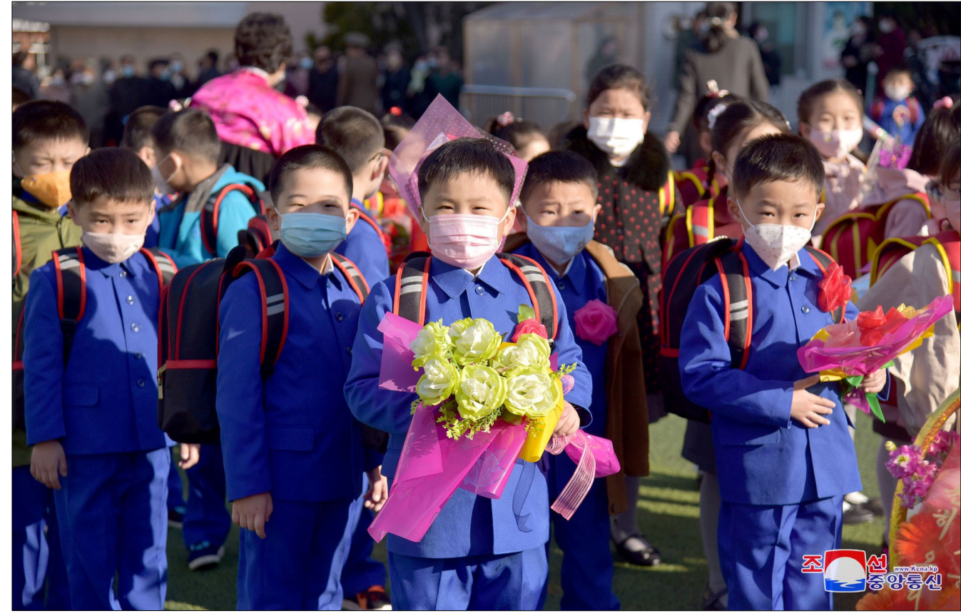
Newcomers enter the campus of Pyongyang Primary School No. 4 on the day when the new school year begins (Photographed in 2022).

across the country on the day when the new school year