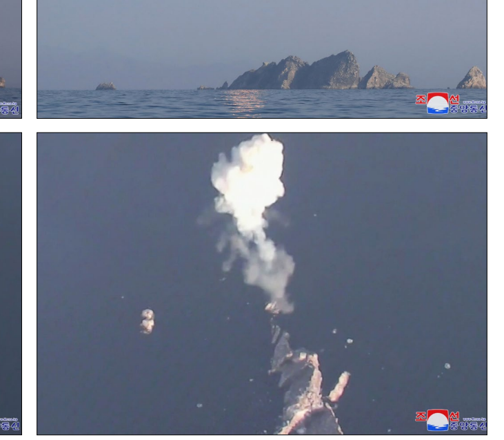
Scenes of a demonstration education firing drill of ground-to-ground tactical ballistic missiles conducted on March 27.