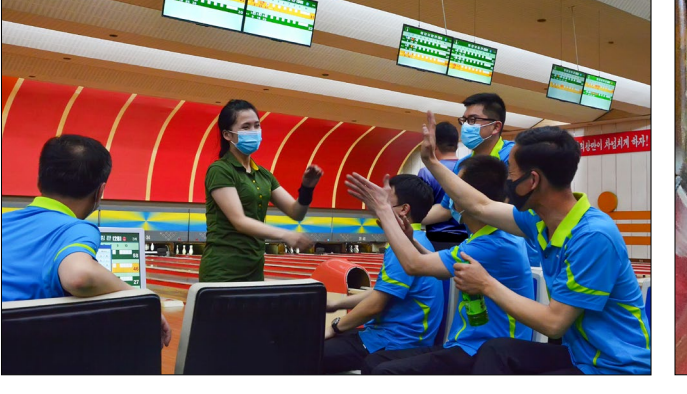
Pyongyang citizens have a pleasant time at the Pyongyang Gold Lane.