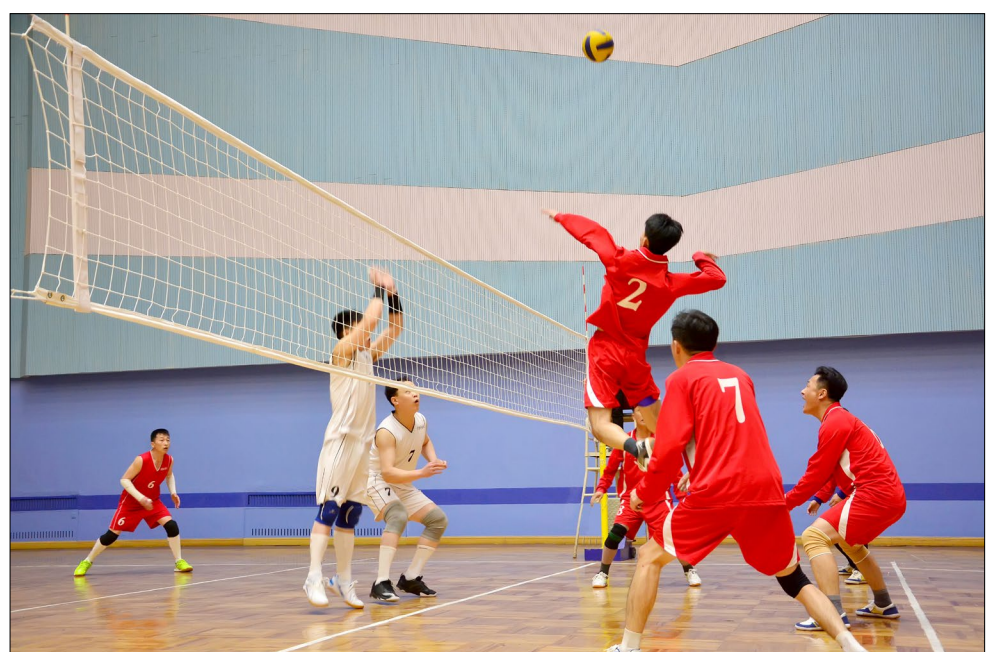
A scene of the tug-of-war final (left) and that of a men's volleyball match (right) at the civil servants' games 2023.