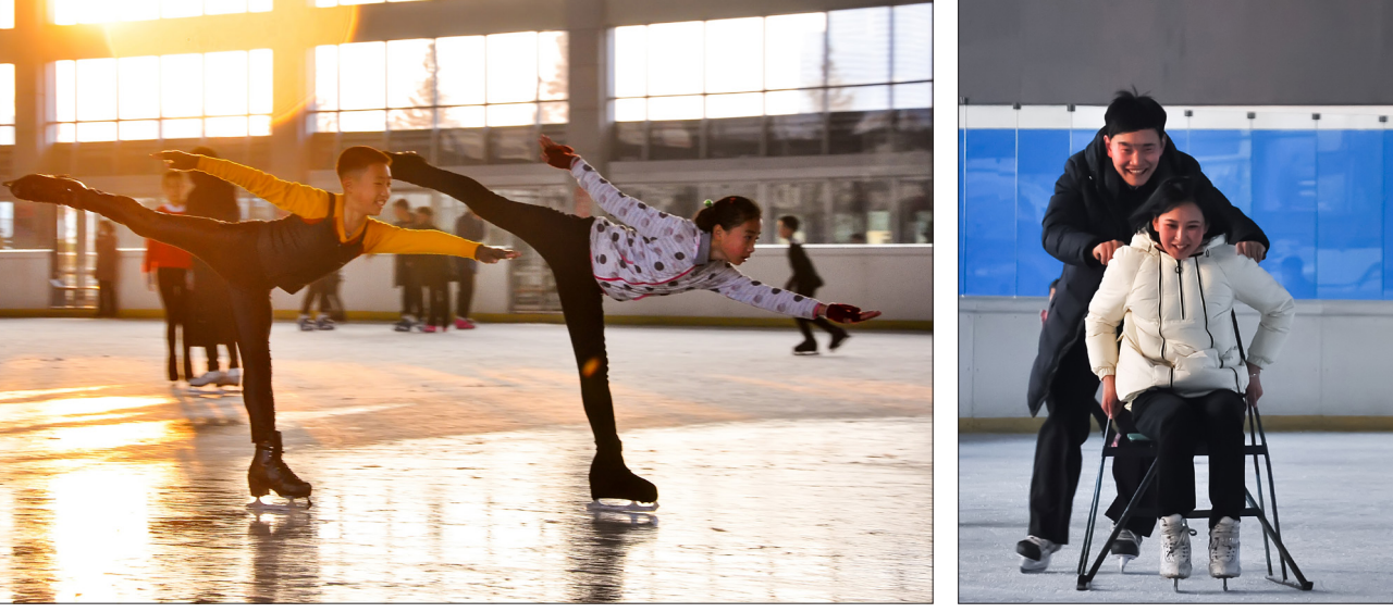
Visitors spend a good time skating at the People's Open-Air Ice Rink.