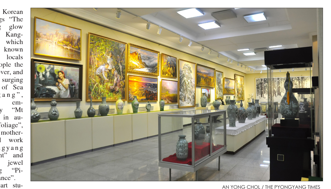
An inside view of the exhibition hall of artworks at the Mansudae Art Studio.

content and perfect in the ous masterpieces includ- Metro depicting the happy studio.