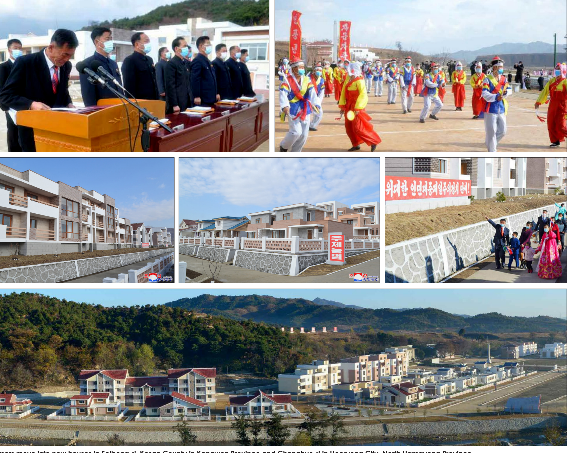
Farmers move into new houses in Solbong-ri, Kosan County in Kangwon Province and Changhyo-ri in Hoeryong City, North Hamgyong Province.

They moved into new houses amid the playing of cheerful dancing.