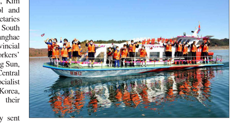
"Mother" commuter boats start operation for students in remote mountain villages.

The residents warmly sent off the boats with students