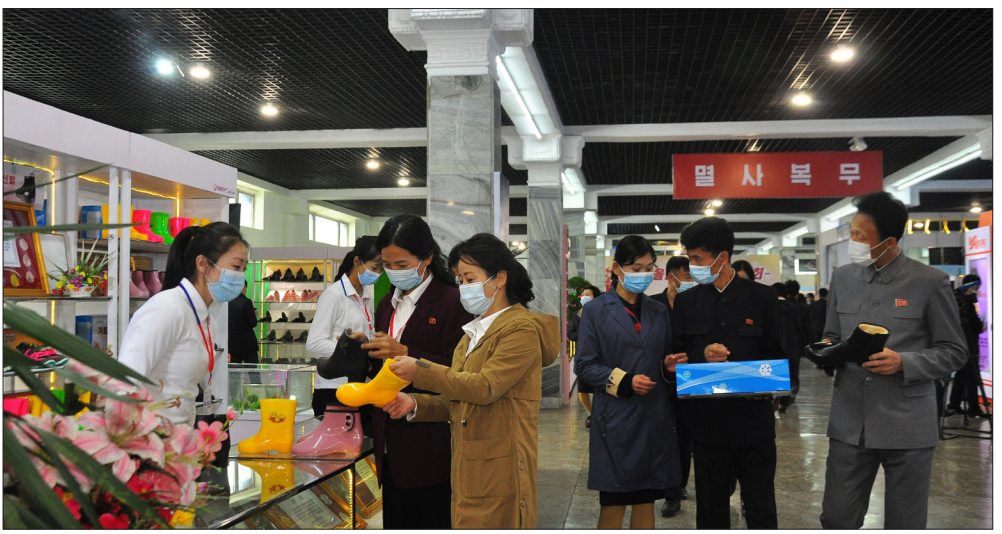
The autumn national footwear exhibition-2022 is held at the Pyongyang Yokjon