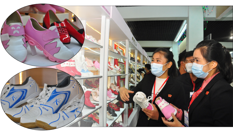
Visitors choose shoes at the autumn national footwear exhibition-2022.