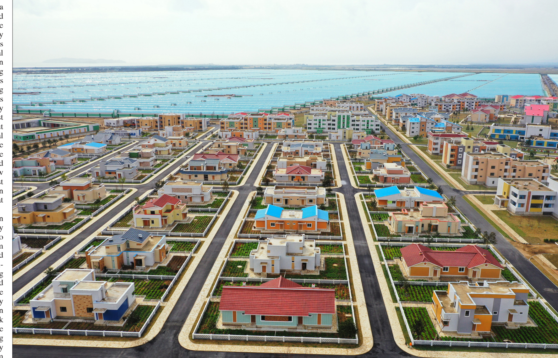
The village of the Ryonpho Greenhouse Farm has 113 blocks of single- and low-storey houses for over 1 000 families built in 99 different styles.

houses for its employees creates a styles, the village gives visitors the expressing her resolve to put down Kim Song Sim, who is to become it made him feel again the validity the great favour it bestowed on impression that they have come to their roots at the farm generation the owner of a luxurious house. and vitality of the policy on the the farmers to enjoy socialist