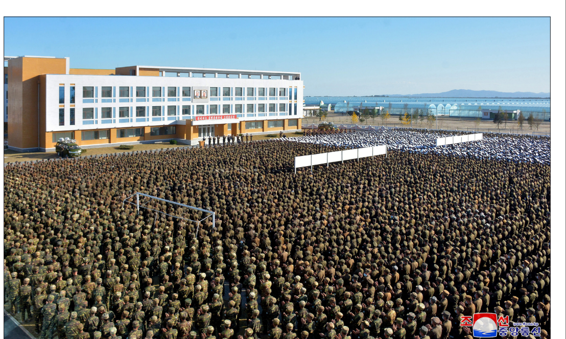
A meeting is held on October 17 to convey the message of thanks of the WPK Central Committee to soldier builders of the Ryonpho Greenhouse Farm