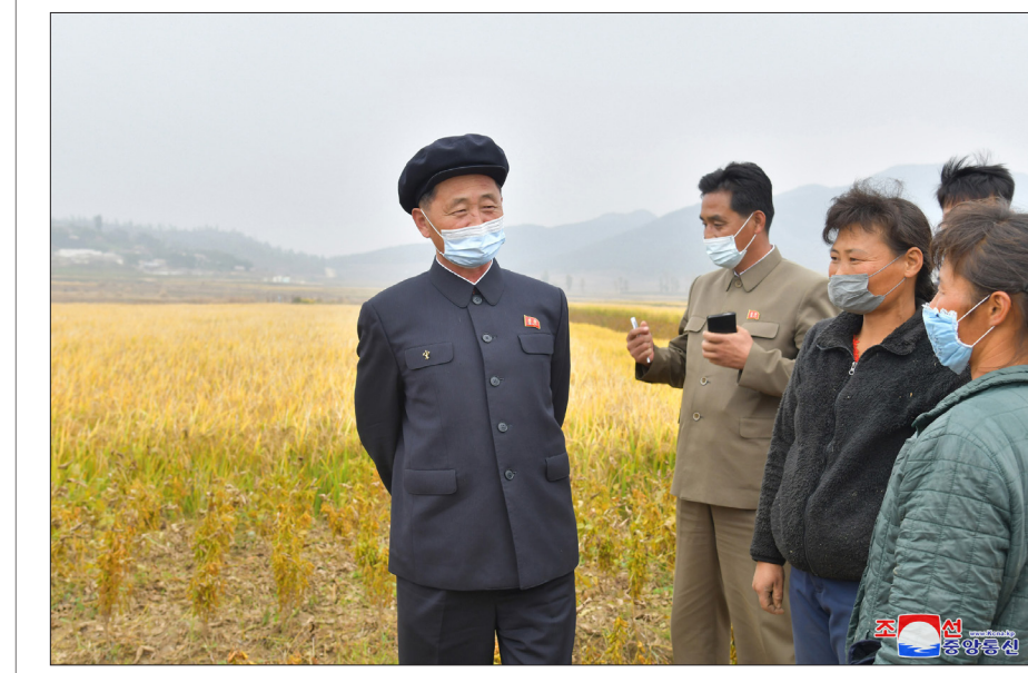
Premier Kim Tok Hun (left) inspects Sinchang Farm of Unchon County in South Hwanghae Province.

Premier Kim Tok Hun, of the Workers' Party the province. of Korea and vicehimself with agricultural on harvesting crops and food administration cultivated with much