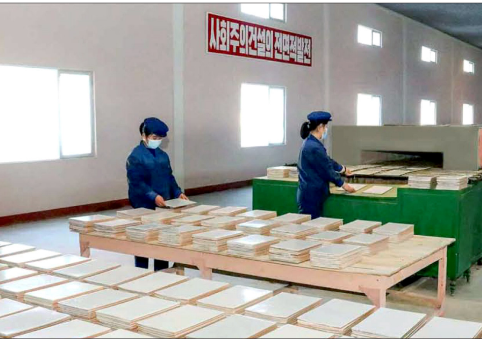
Tiles are produced with local materials at the Huichon Tile Factory.