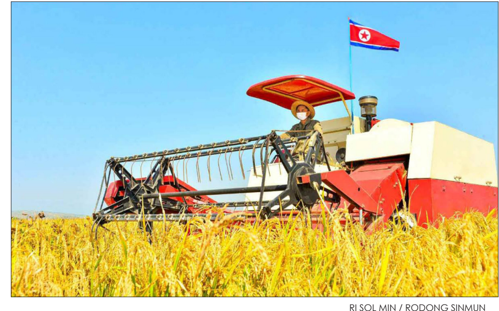
Harvesting is in full swing in South Hwanghae Province.