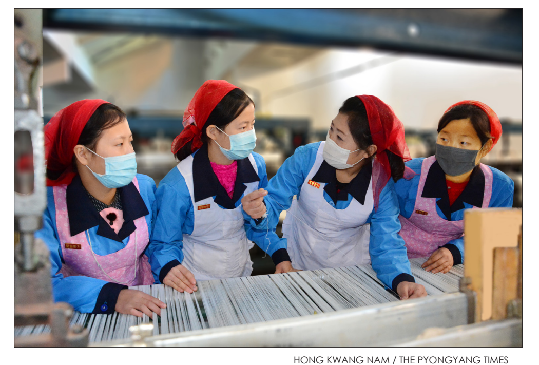
Weavers discuss the way for producing much cloth.

Products of the mill are now favoured among utilization units and consumers and won high appreciation at different workers of the mill newly raise production capacity consumer goods exhibitions. Among them, there is cloth for shirts which was newly