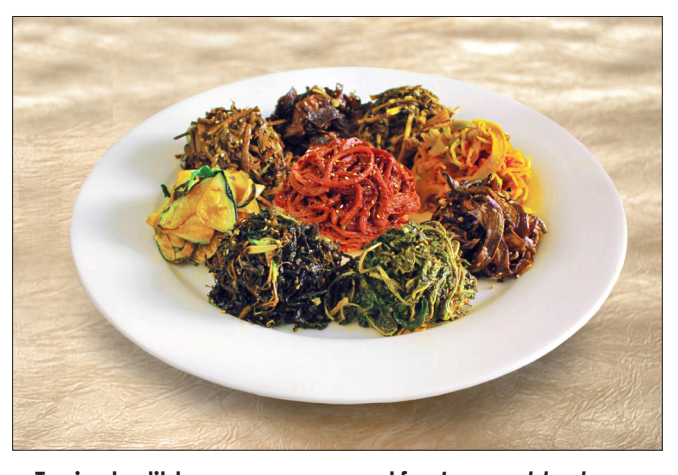
Typical edible greens prepared for Jongwoldaeborum, the 15th day of the first month by the lunar calendar.

The instrument plays an important role not only as a solo instrument but also in national instrumental ensembles and performs an important function in ensuring the national colouring and lyricism of orchestral music in Juche-oriented mixed orchestrations.