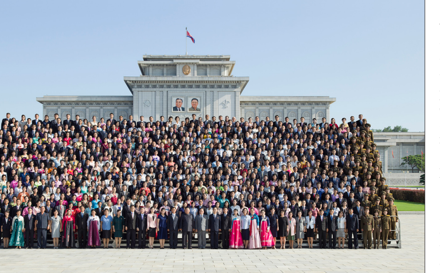
FROM PAGE 8

warm militant greetings to the participants who have put the idea and determination of the Party Central Committee into thorough practice in the van of the all-people antiepidemic front, upholding the Party line the priceless victory in the top emergency and policies as absolute truth and heartily anti-epidemic campaign into new source of responding to them.