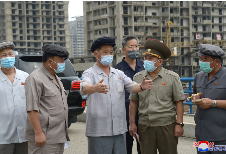
Premier Kim Tok Hun (third from left) inspects the construction site

Premier Kim Tok Hun, who is State Affairs Commission of the DPRK, inspected the construction site of 10 000 flats in the Hwasong discussed such issues as of steadily area of Pyongyang.