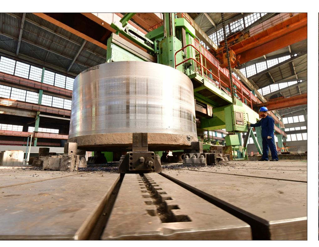
A custom-built machine is processed at the Taean Heavy Machine Complex.