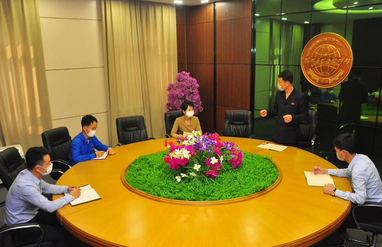
Employees are immersed in research projects at the Mirae science and technology centre. (top) A round-table discussion of researchers takes place at the centre

In keeping with the global trend of educational development, it set up the as a base for this purpose and has Such integration is also essential stepped up the efforts for this.