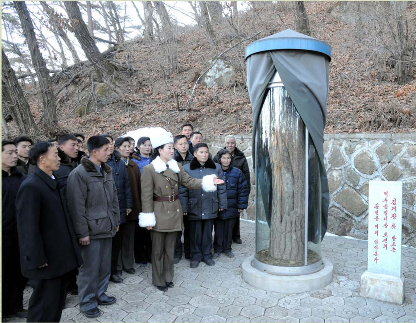
Intensifying education in revolutionary traditions through slogan-bearing trees