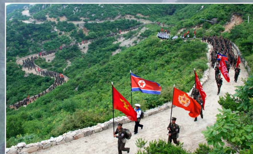
Service personnel march along the road to the front traversed by Kim Jong Il