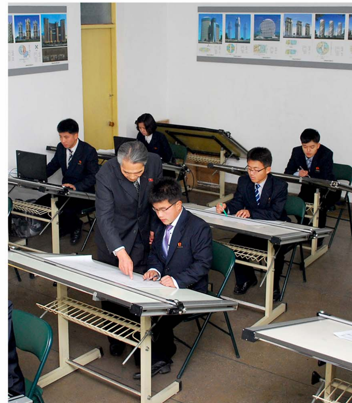
To bring up students as competent architectural designers