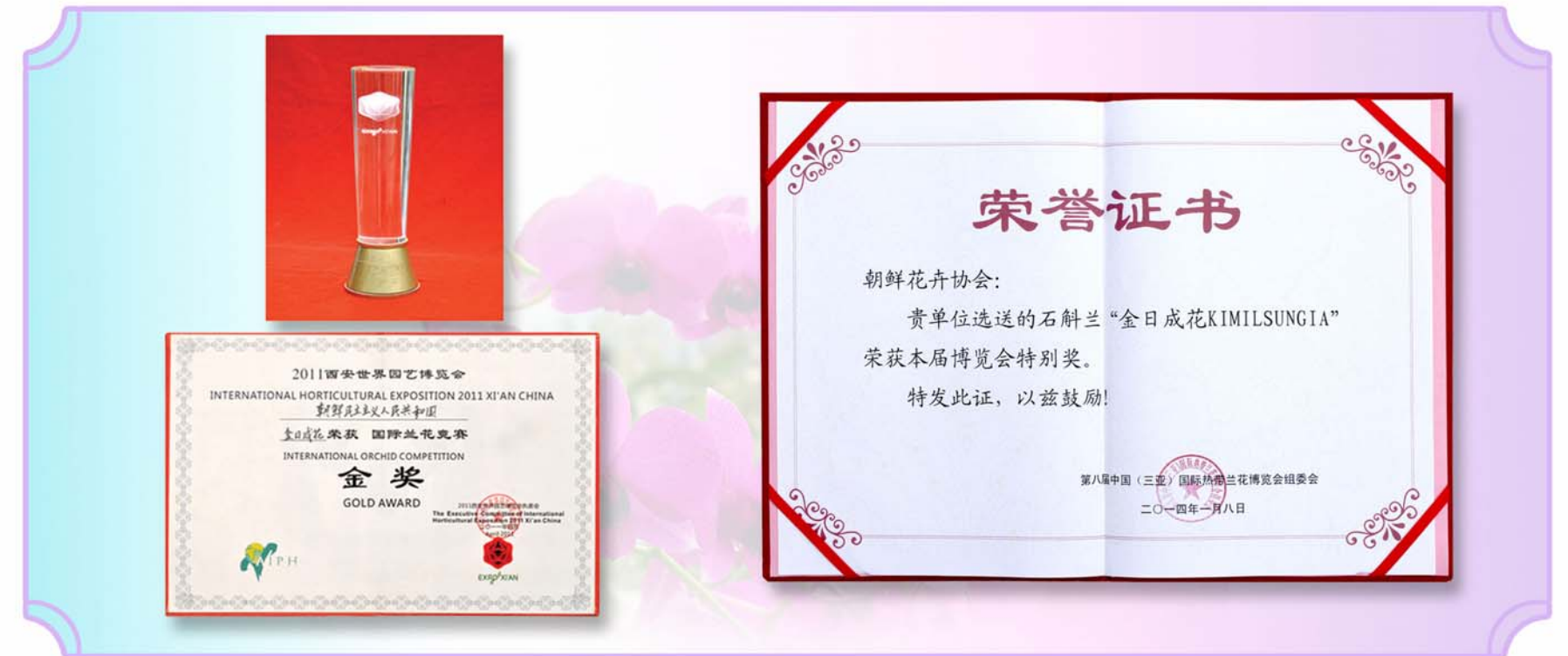
Kimilsungia has won gold and special prizes in international horticultural expos and exhibitions