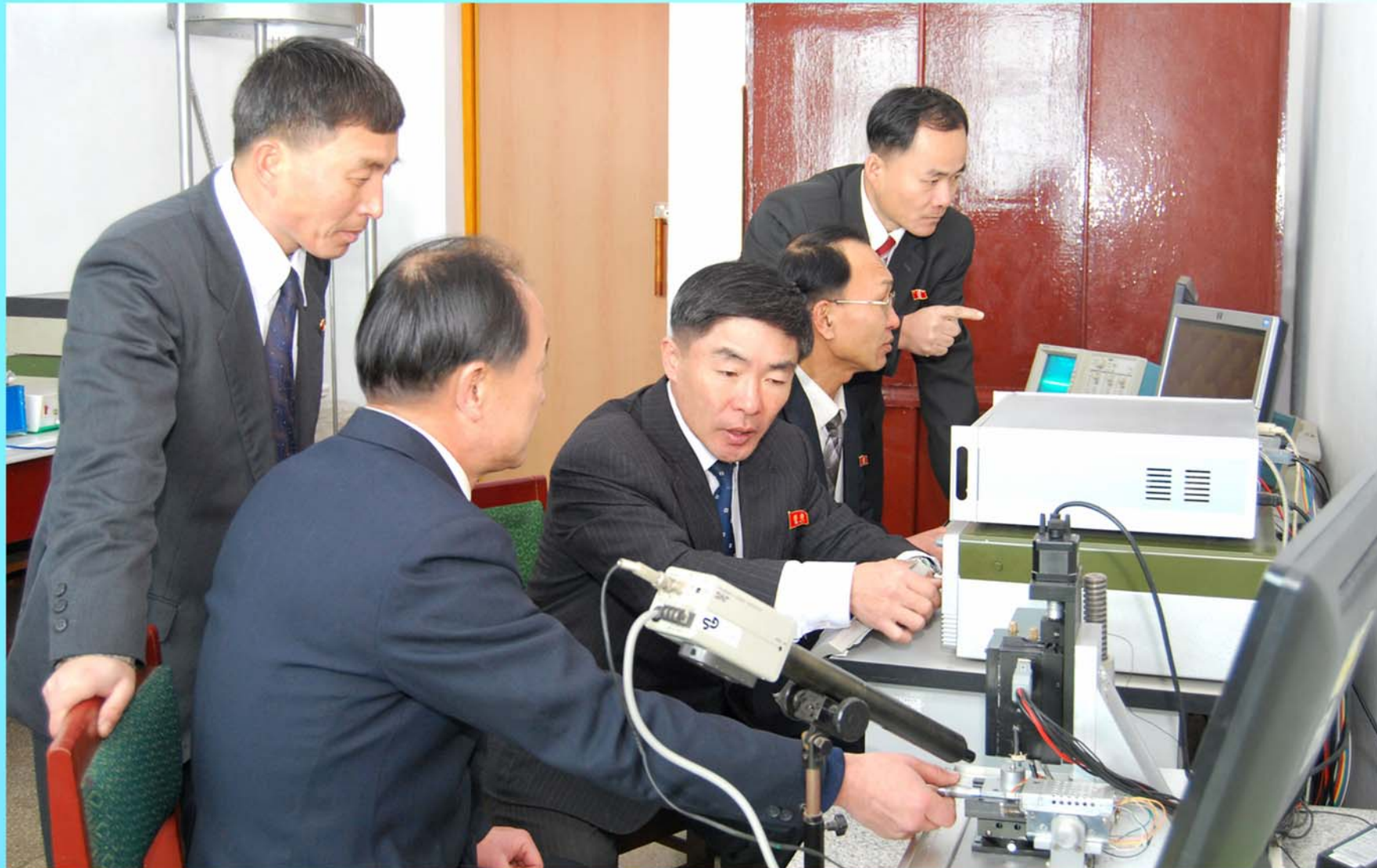
Lecturers and researchers of Kim Il Sung University who have developed an atomic force microscope