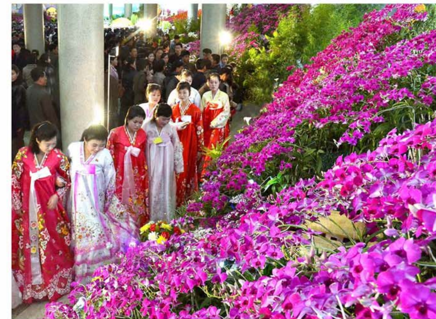
Kimilsungia strikes visitors with admiration