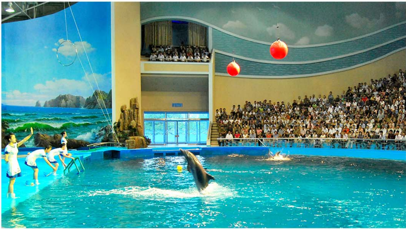
Rungna Dolphinarium where people enjoy themselves