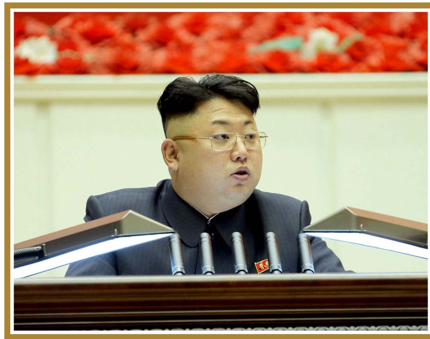
Kim Jong Un delivers a speech at the conference in February Juche 103 (2014)