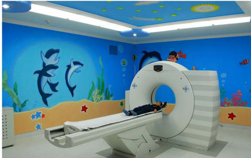
Ryugyong Dental Hospital (left) and Okryu Children's Hospital (right)