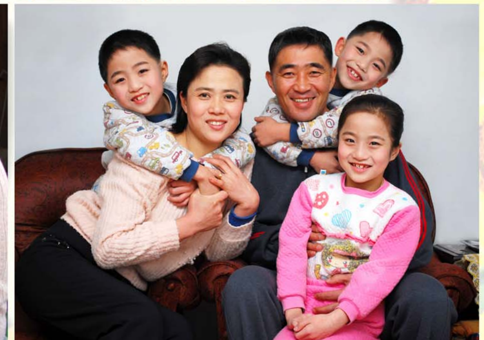
Triplets grow happily under the care of the state