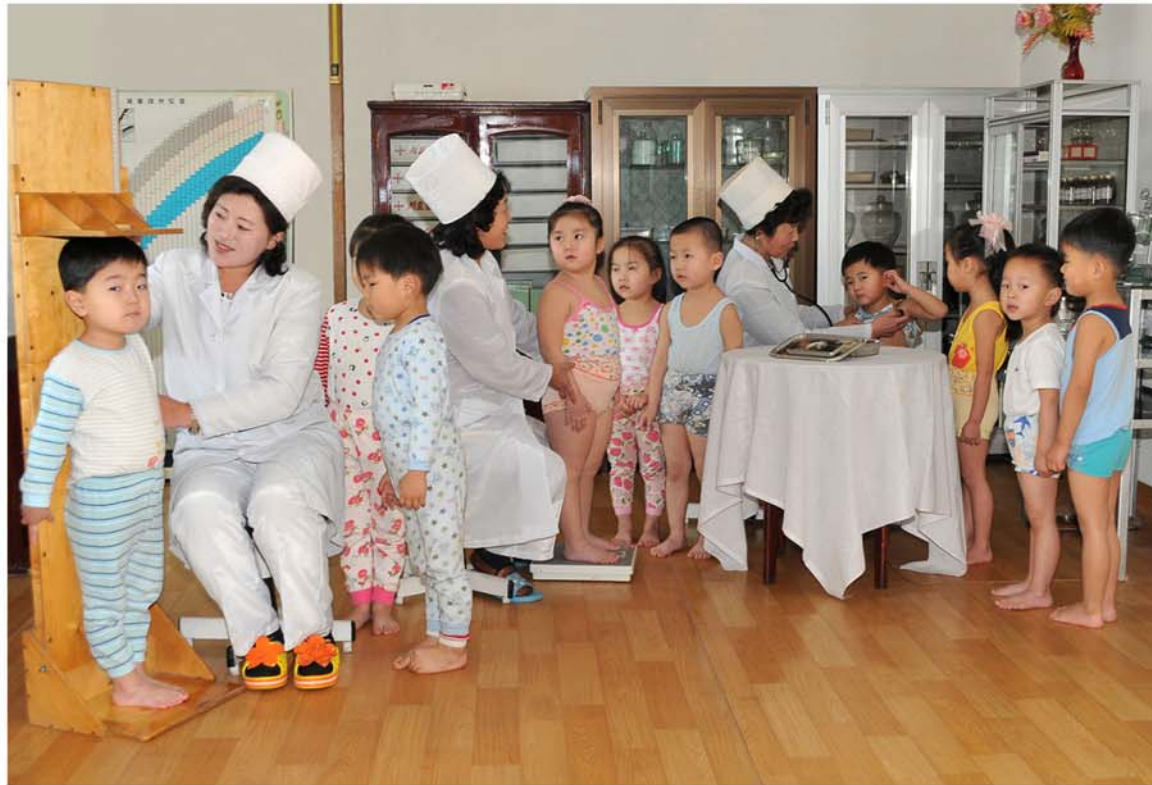
A regular health checkup for children