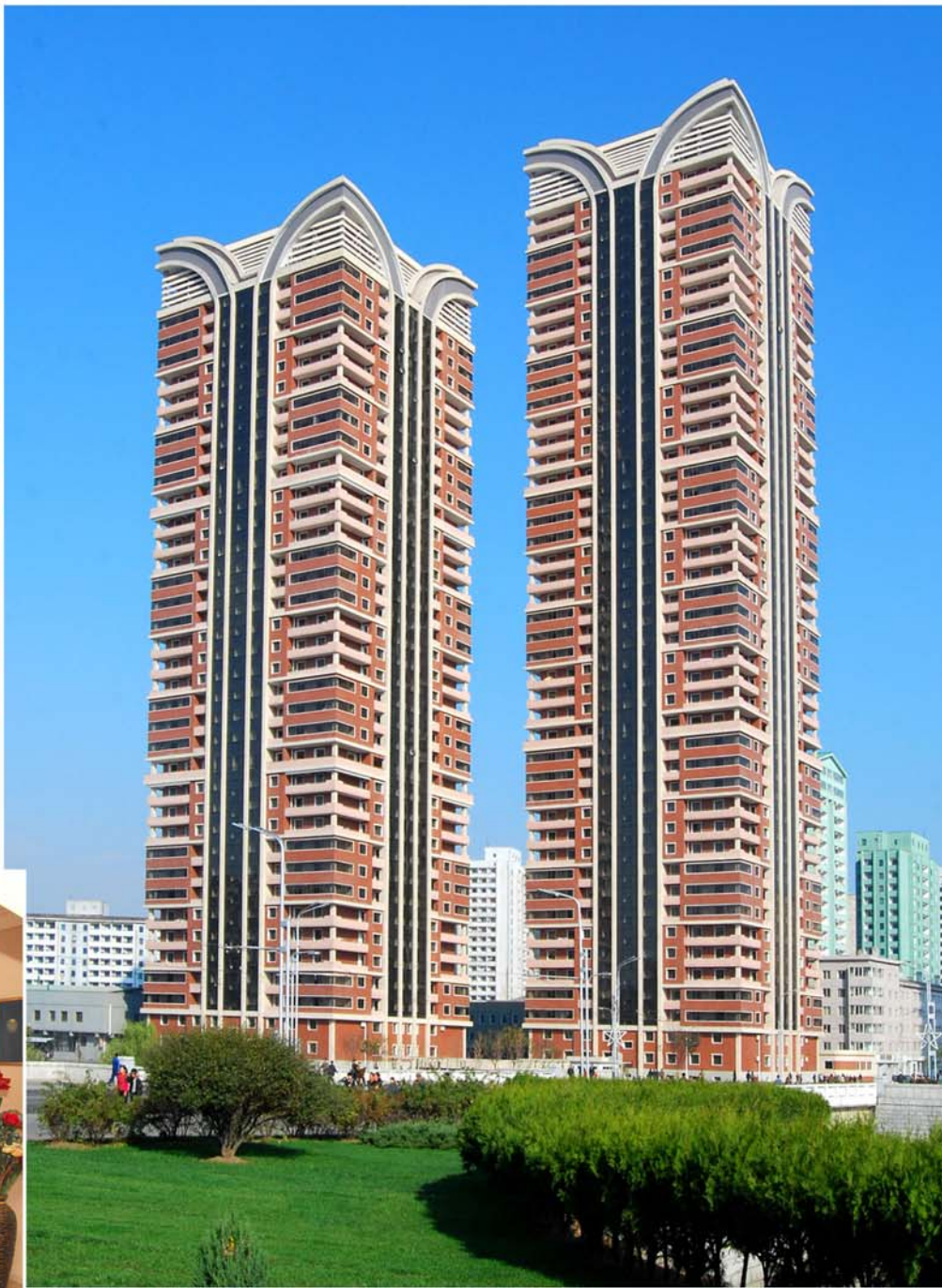
Apartment houses for educationists at Kim Il Sung University