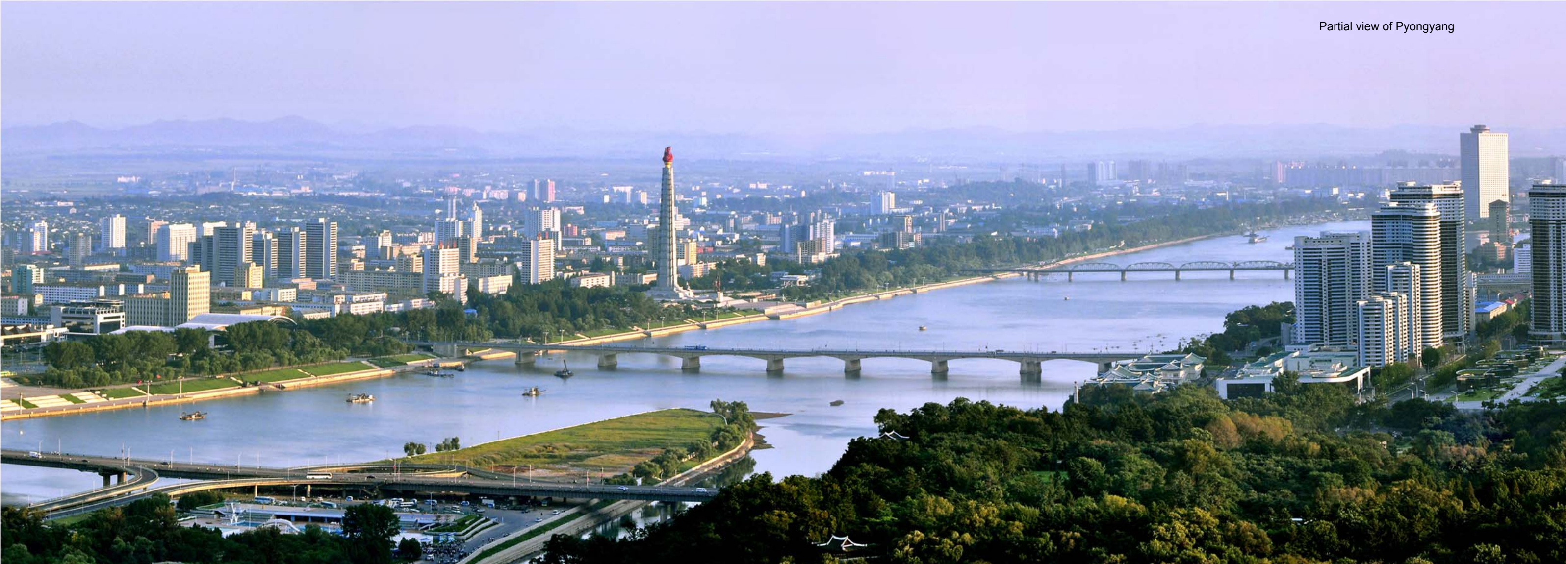
Partial view of Pyongyang