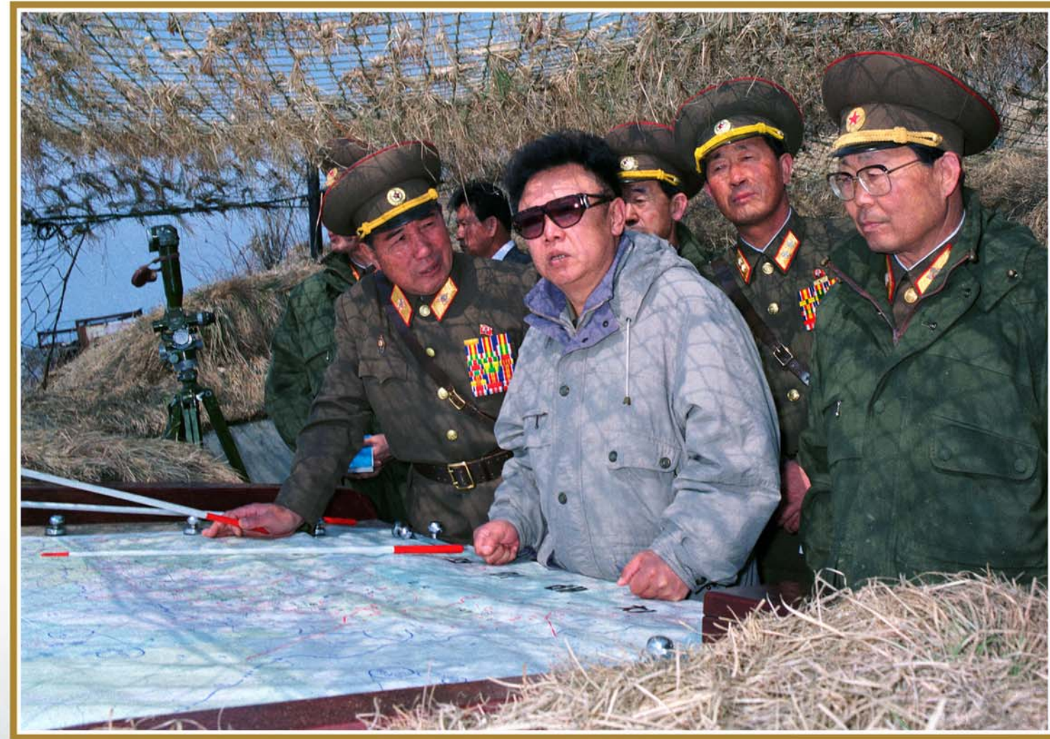
Kim Jong Il at a forefront observation post on Height 1211 in April Juche 86 (1997)