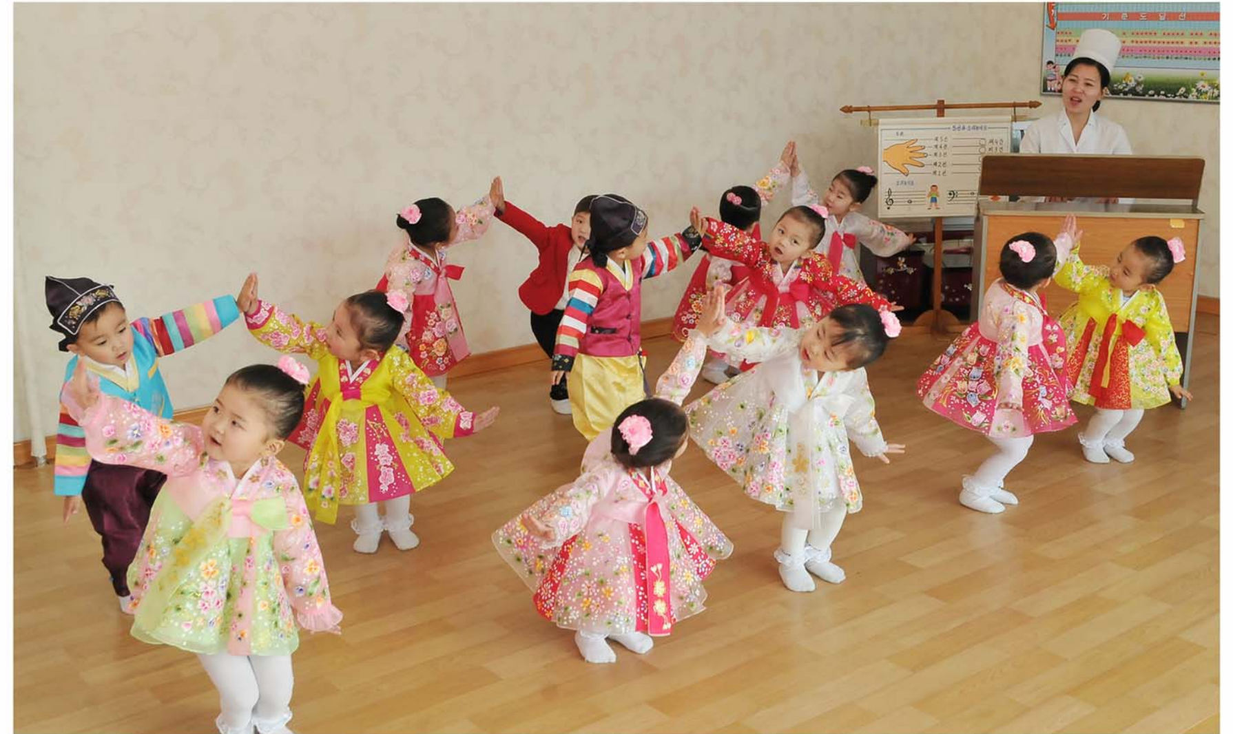
Developing children's talents