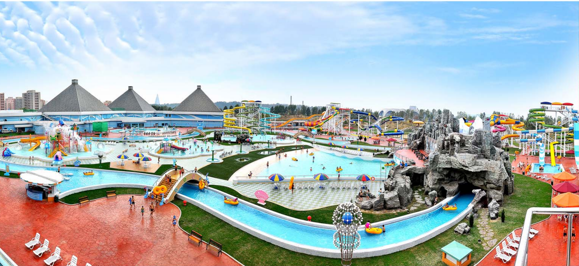
Magnificent Munsu Water Park