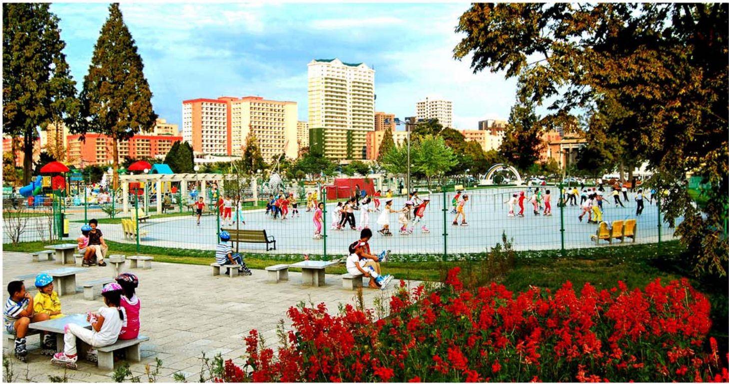
Children's and sports parks built across Pyongyang