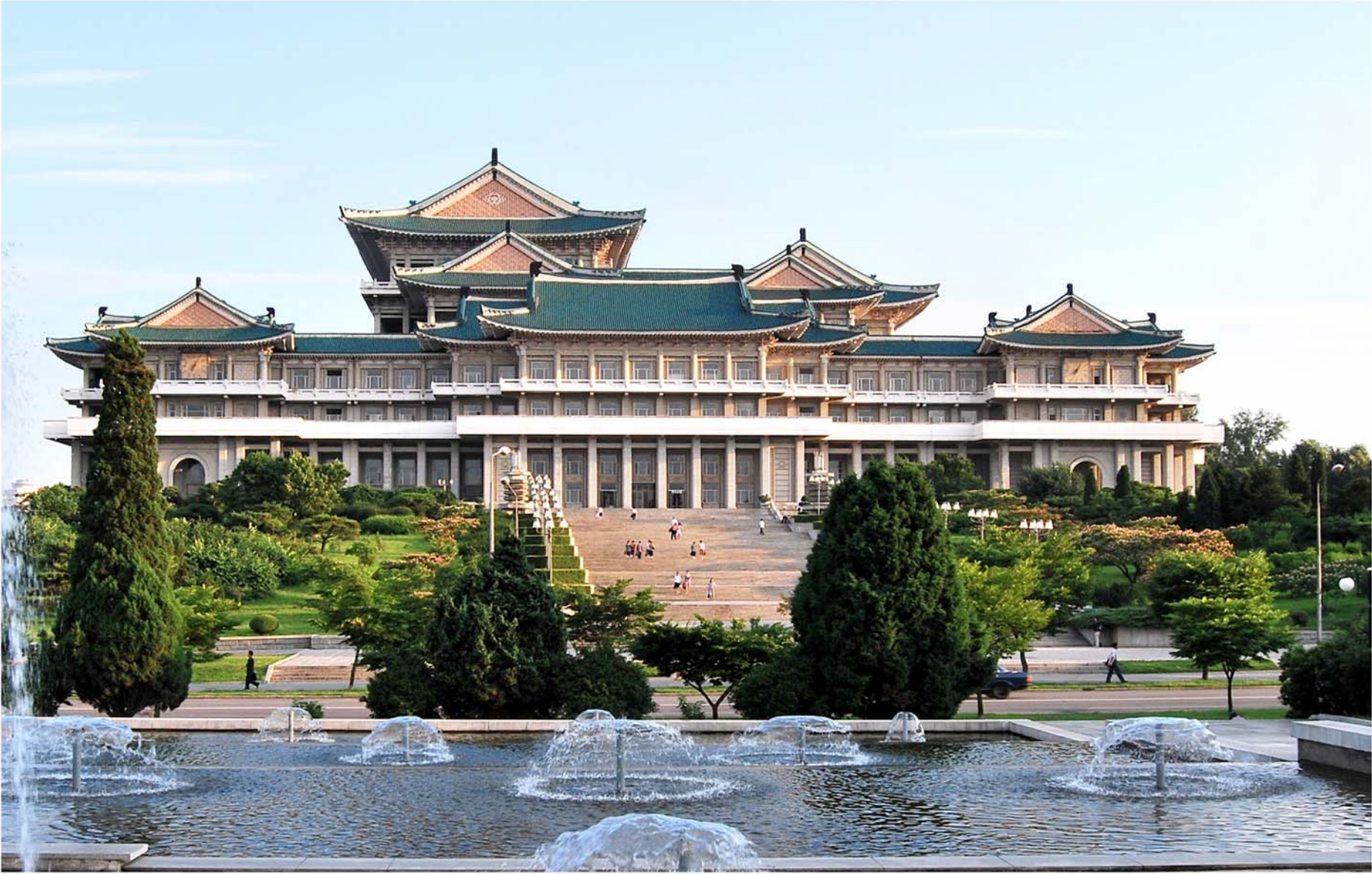
Grand People's Study House, a grand palace of people's learning