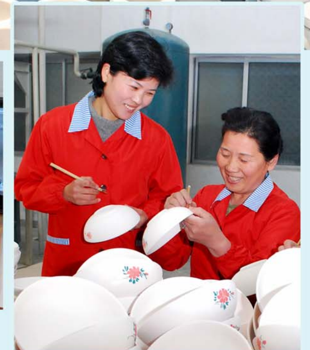
Striving to improve the workers' technical skills and upgrade the quality of products