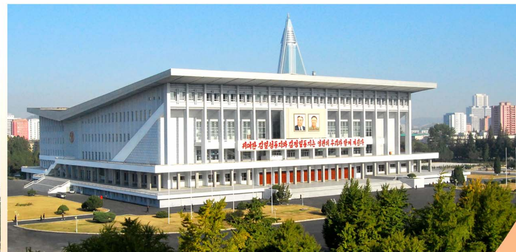
Pyongyang Department Store No. 1 and Pyongyang Indoor Stadium: Yun drew up their designs