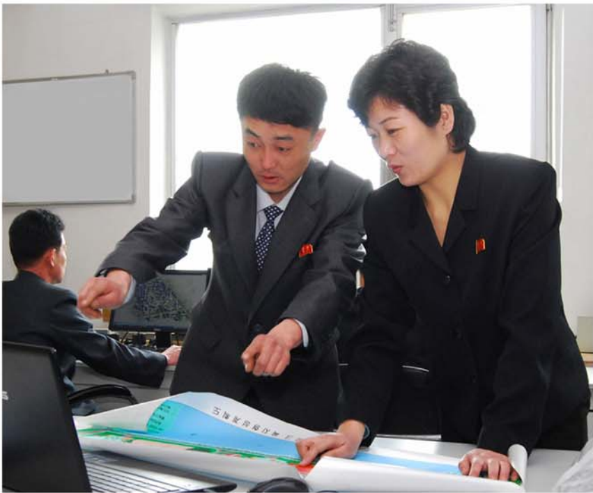
To present characteristic designs by enlisting their ingenuity

— Pyongyang Urban Planning and Designing Institute —