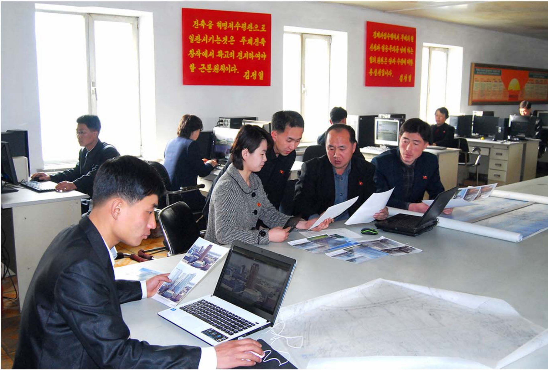
In Hearty Response to New Year Address