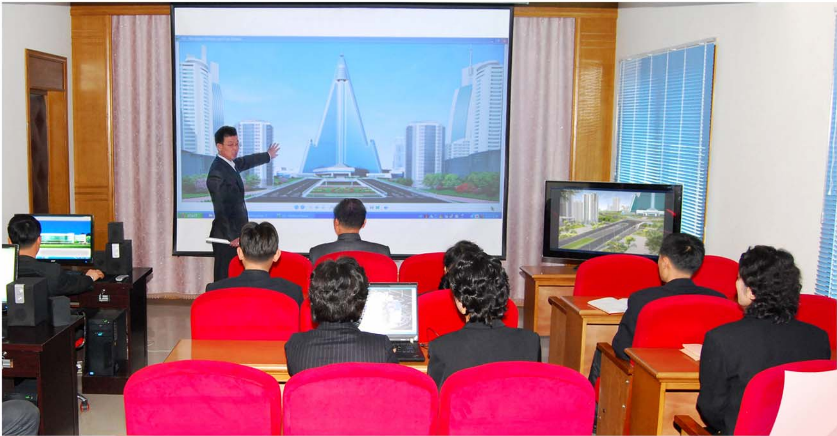
Panel discussion is often held