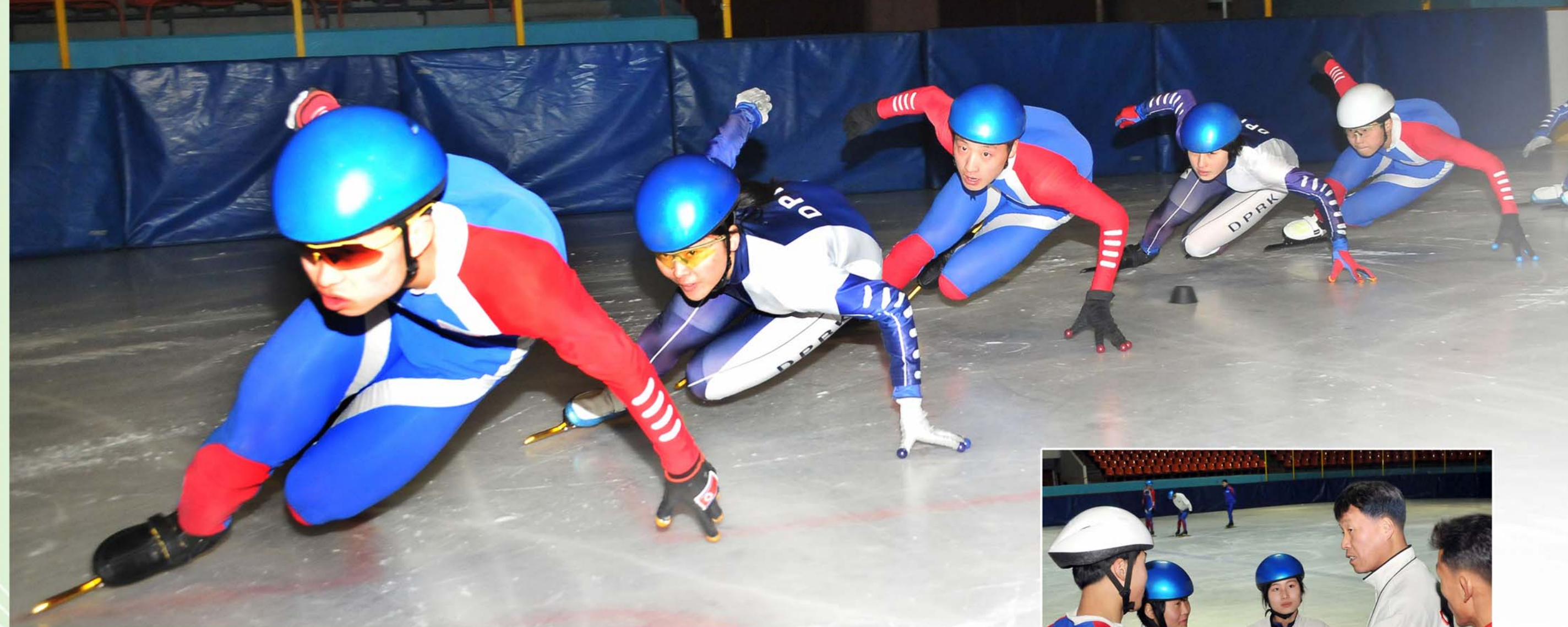
With an ambition to glorify their country with gold medals