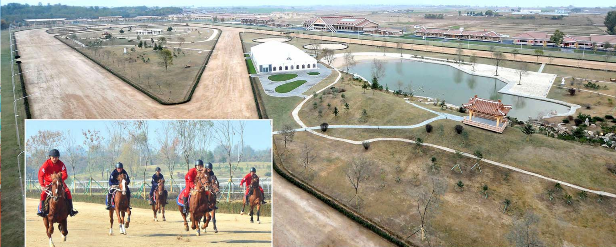
Mirim Riding Club gives people youthful vigour and joy