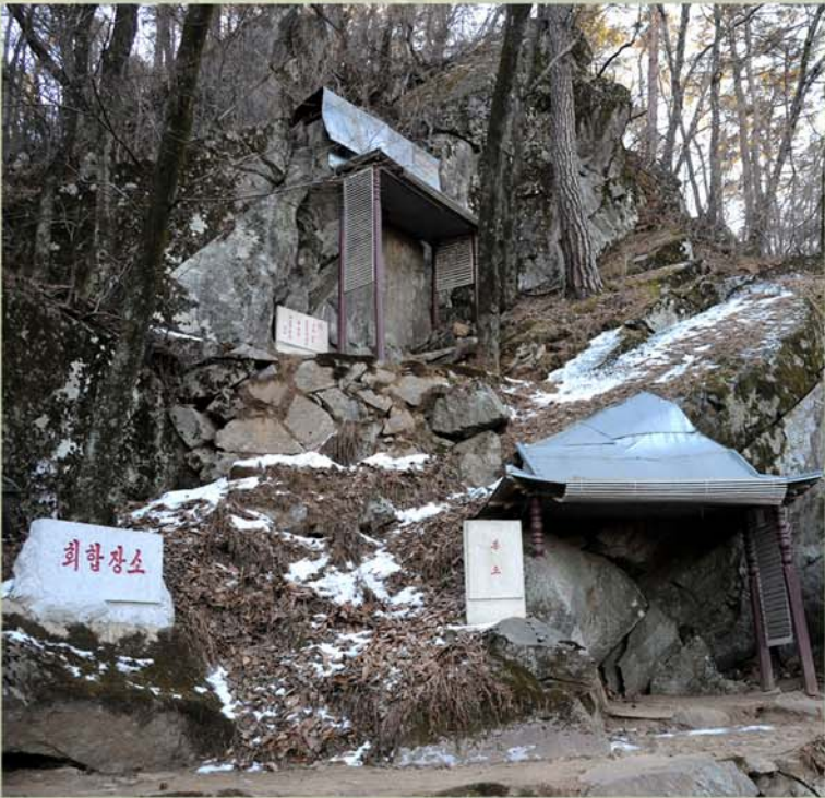
Place where a meeting was held