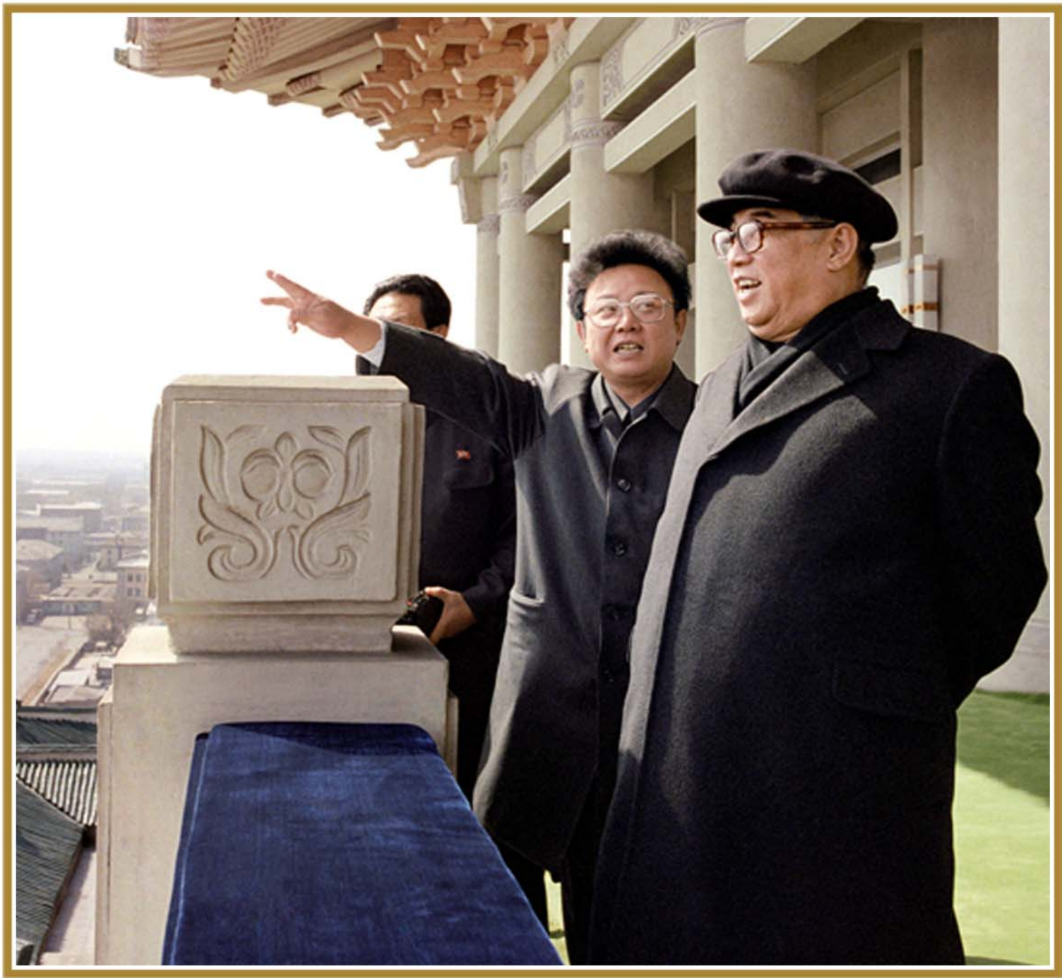
Kim Il Sung and Kim Jong Il on the balcony of the Grand People's Study House in April Juche 71 (1982)