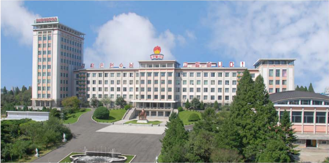
Pyongyang Students and Children's Palace