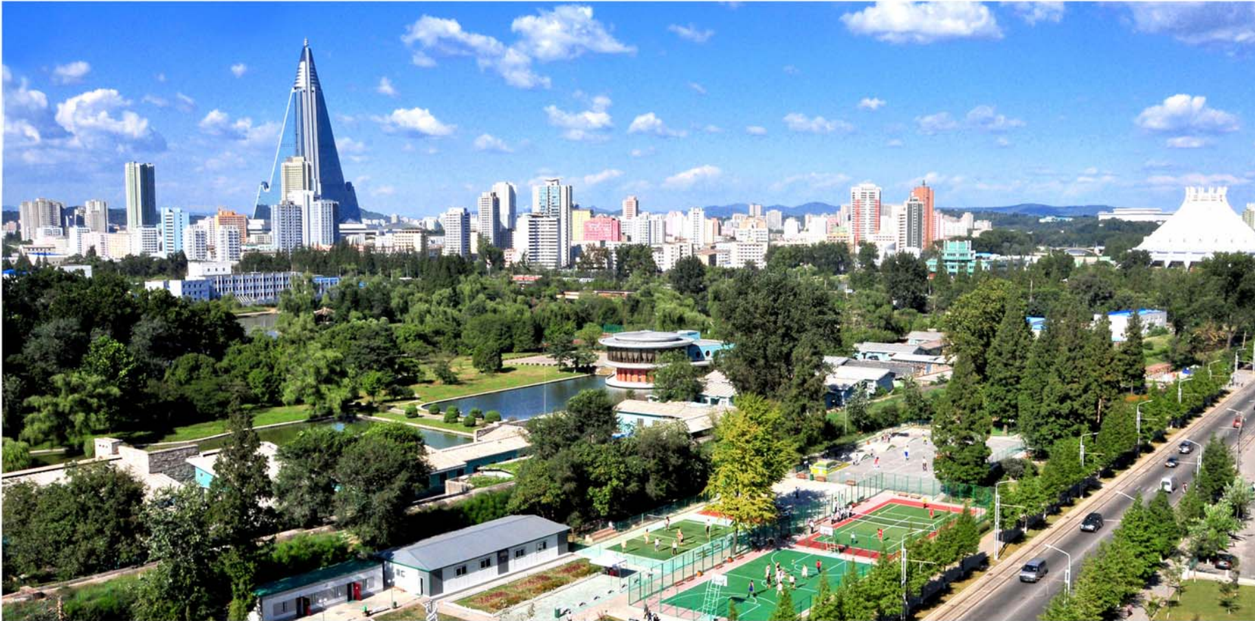
Pyongyang, city in parks