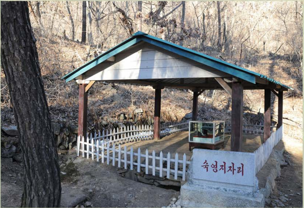
A camping site