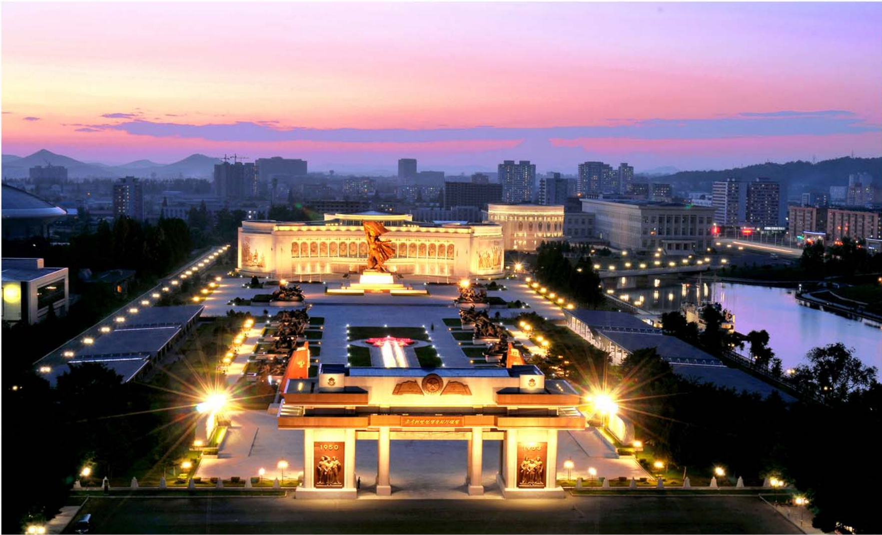
Victorious Fatherland Liberation War Museum, a base of education in the history and tradition of the great war victory

and benefits of socialism they will enjoy are. Therefore, with boundless respect for Kim Jong Un, who is continuing his road of Songun-based revolutionary leadership for greater happiness and pleasure of the people, they are making great strides towards