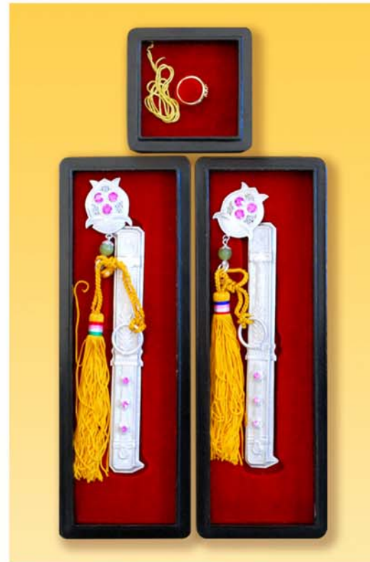
Gold ring and silver daggers presented to the triplets

Greeting the New Year 2014 schoolchildren staged their artistic performance at the Mangyongdae Schoolchildren's Palace in Pyongyang. Among them were triplets from the Chilgol Primary School in Mangyongdae District. They sang "The Happiest Day," portraying the pleasure of the children greeting the New Year's Day with their correct and rich vocal sounds and cute performance.