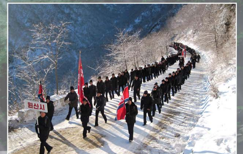
Youth and students on a tour of Chol Pass