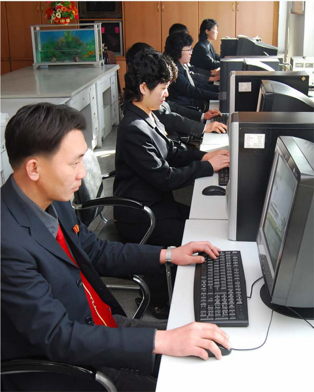
To put designing on the basis of informatics and science