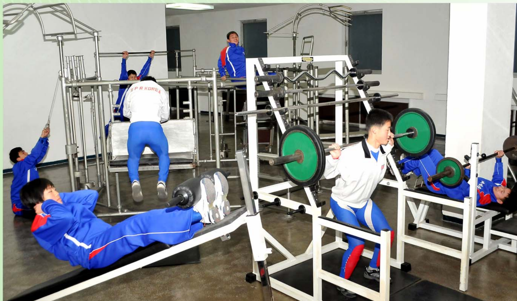
In a general gym