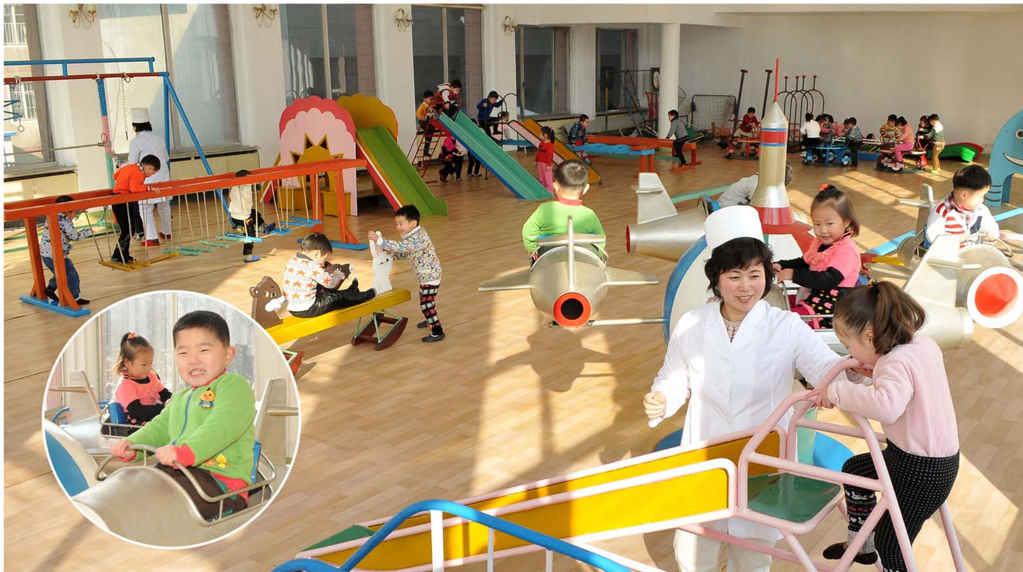
Indoor play area