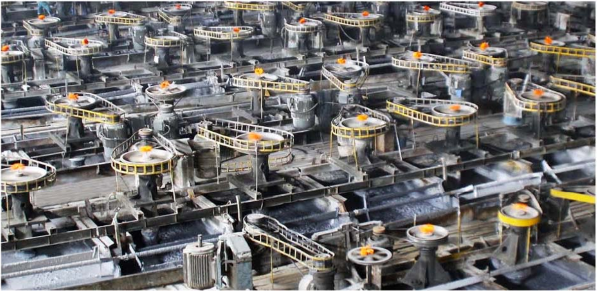
The inside of a floatation plant.

found that they would be able to carry out their yearly plan by around April 20 if they continued to work at the same speed. If we further strive we would be able to finish the yearly plan on the occasion of the Day of the Sun , he thought. Later that day there took place a consultation of the workteam in the working. The workteam leader proposed to introduce a three-dimensional digging method. It was really a bold idea that could ensure sequence drilling by applying shrinkage stoping at the bottom of a face and a drill rig on the top so as to cut a large