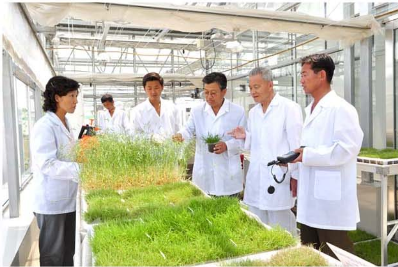
Researchers are engrossed in breeding a new species of grass.

To make up the defects, the researchers decided to breed a new species of turf suitable for the local climate and soil conditions by using hereditary resources of the country. The most difficult task was to find out turf resources that are well adapted to the local conditions. The researchers combed northern parts of Korea including Ryanggang, North and South Hamgyong provinces for turf resources. They were so exhausted that they sometimes tumbled down cliffs while climb- ▶