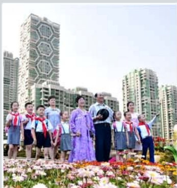
Front Cover: Masters of Ryomyong Street