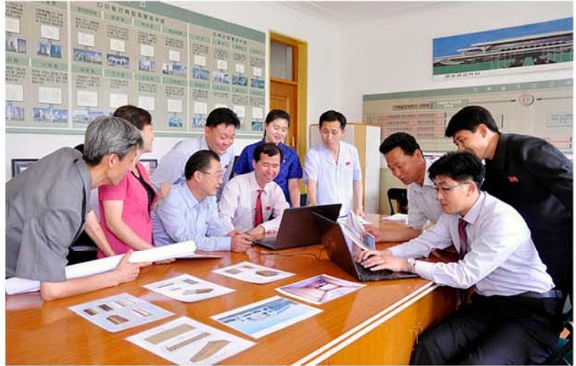
Teachers discuss methods of instruction to stimulate students' creative thinking.

They designed over a thousand and scores of major projects found across the country, including the fountain park in the April 25 House of Culture, the Fatherland Liberation War Martyrs Cemetery, the Jangchon Vegetable Cooperative Farm in Sadong District, Pyongyang. In particular, they rendered service to the construction of Ryomyong Street featuring an energy-saving and green street. As the street pioneered a new phase in view of practical use, formation and artistic sense of architecture, it is called a model and standard of