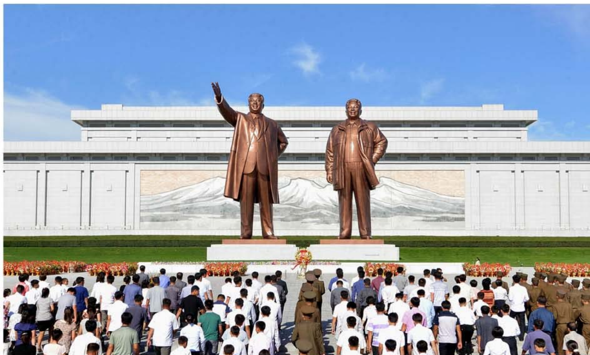
Service personnel, working people of all strata, young people and schoolchildren visit the statues of President Kim Il Sung and Chairman Kim Jong Il.

T HE KOREAN NATION HAS A HISTORY OF more than 5 000 years. The long national history, however, had never had a chapter dedicated to the working people until the national hero Kim Il Sung founded the Democratic People's Republic of Korea (DPRK).