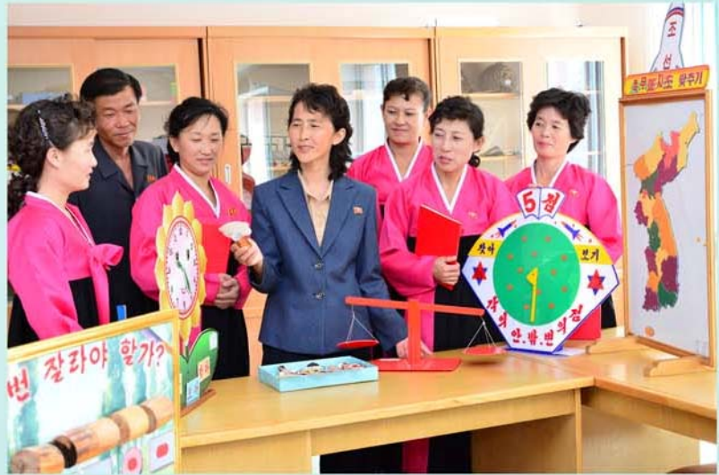
Teachers work hard to improve the quality of visual education.