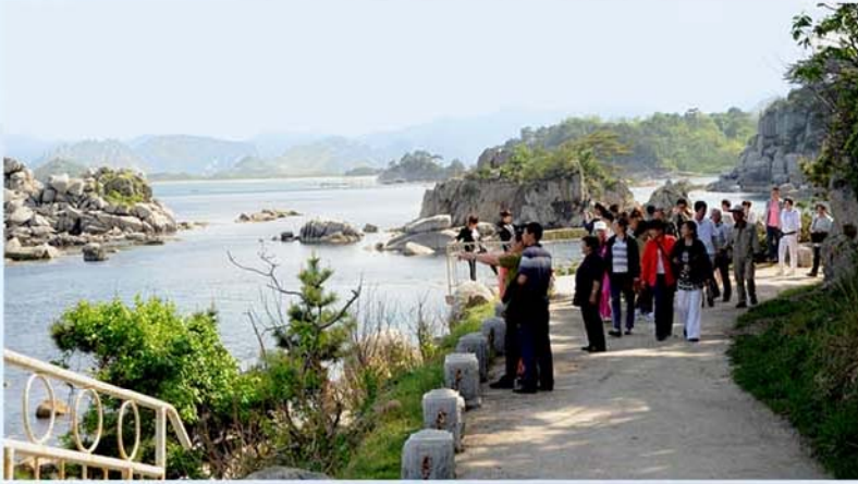
Tourists spend an enjoyable time.

► try takes positive measures to establish modern tourist facilities. In summer last year Pyongyang Taedonggang Beer Festival 2016 was held in Pyongyang and in September there took place a lot of functions including Wonsan International Friendship Air Festival 2016 in Wonsan, deeply impressing tourists.