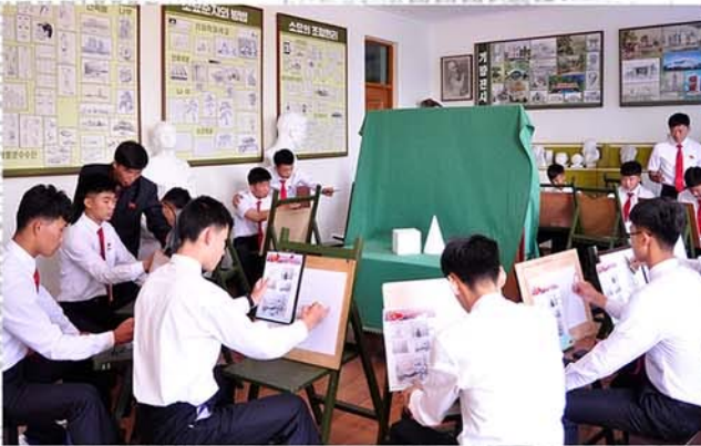
Students endeavour to assimilate creative senses and knowledge of designing.

The Supreme Leader's inspection became a historic event that awakened the teachers and students of the university to their mission again. The teachers applied the 5-D designing program to all designing subjects and opened several new subjects while setting up some new courses. Their primary effort went to the work of combining theory and practice and developing a sus-