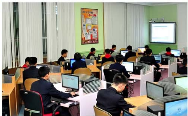
Mangyongdae Schoolchildren's Palace, an extracurricular education centre.