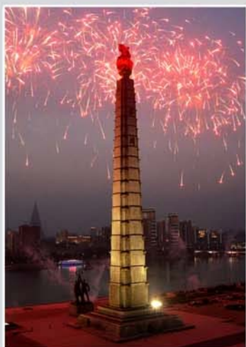
Back Cover: Firework display on July 6, 2017