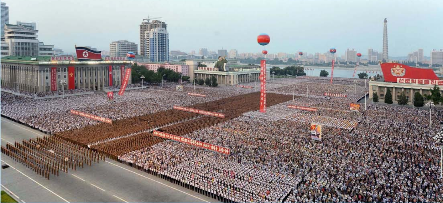
Service personnel and citizens of Pyongyang hold a joint rally in celebration of the successful test-fire of an intercontinental ballistic rocket in July 2017.