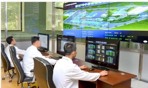
The integrated control room.

T HE SPRING OF KANGSO MINERAL WATER, the best of its kind in Korea, is located about 30 kilometres west of Pyongyang.