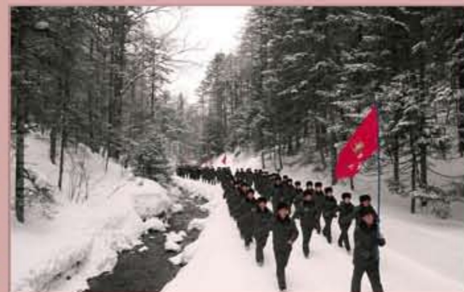
Endless Stream of Visitors.