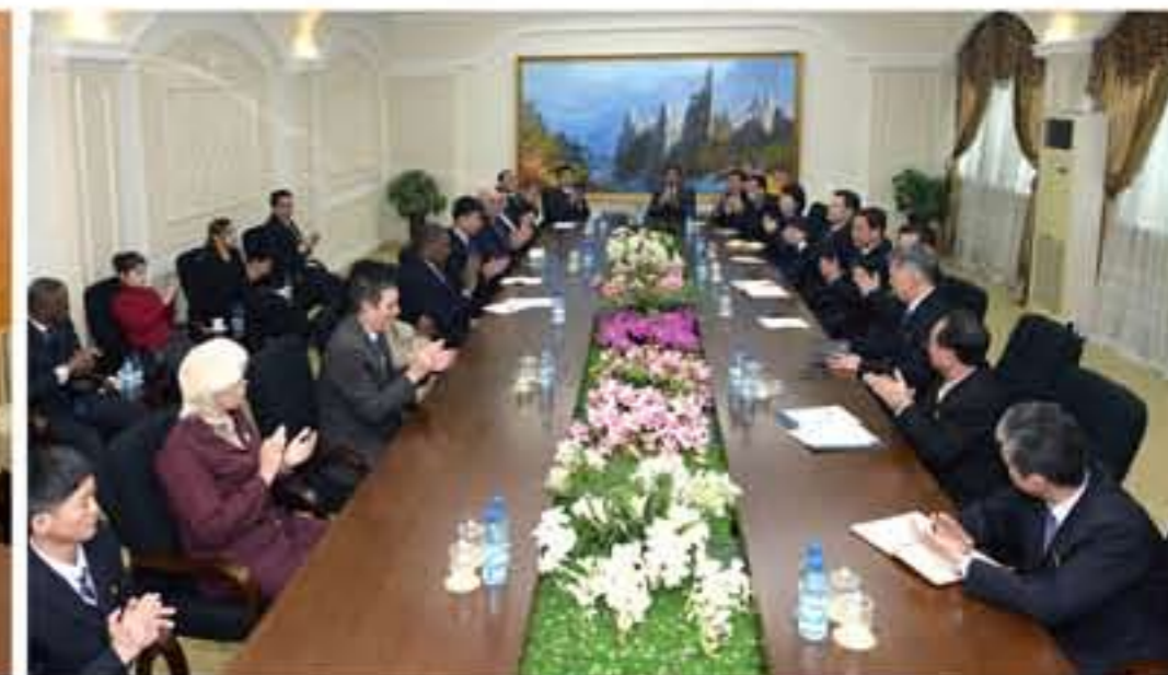
Korean Committee for Solidarity with Cuba held its annual meeting.