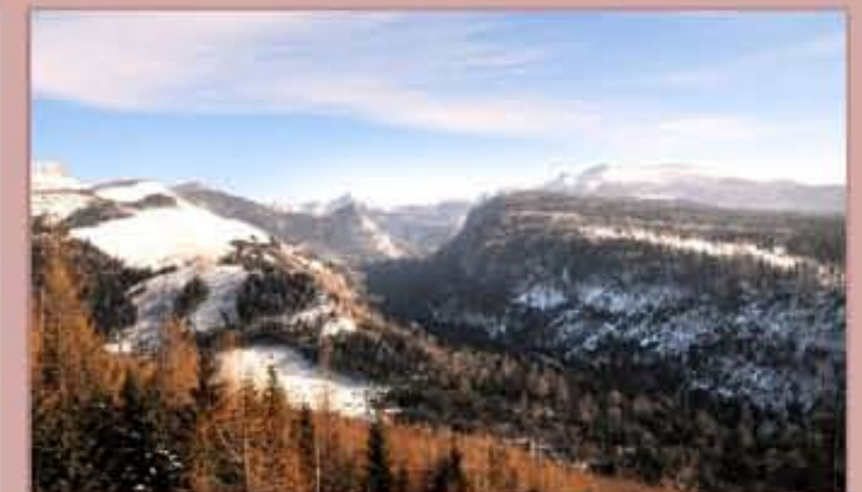
Terrain Features Appropriate to a Natural Fortress.

Article: Kim Son Gyong