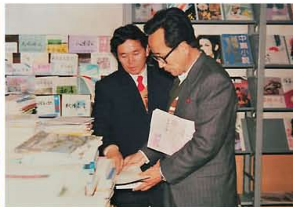
Exchanging his experience in compilation with an official from Chinese Yanbian Publishing House.