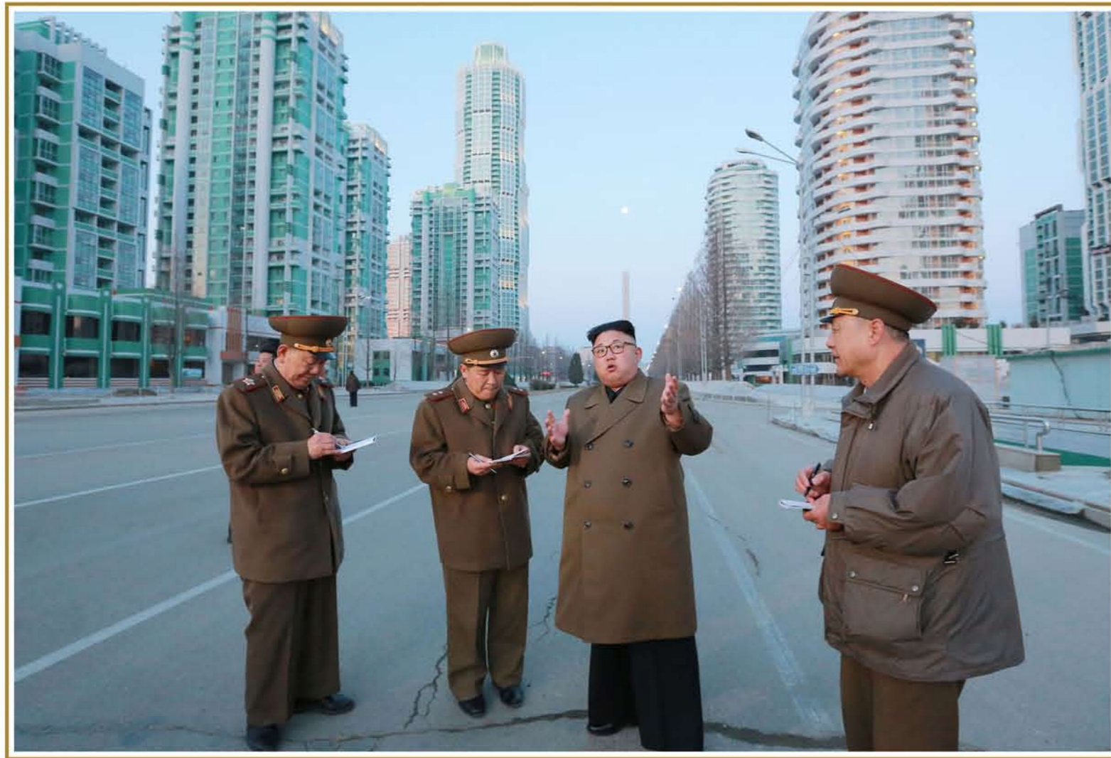
The respected Supreme Leader Kim Jong Un inspects the construction site of the Ryomyong Street [March Juche 106 (2017)].