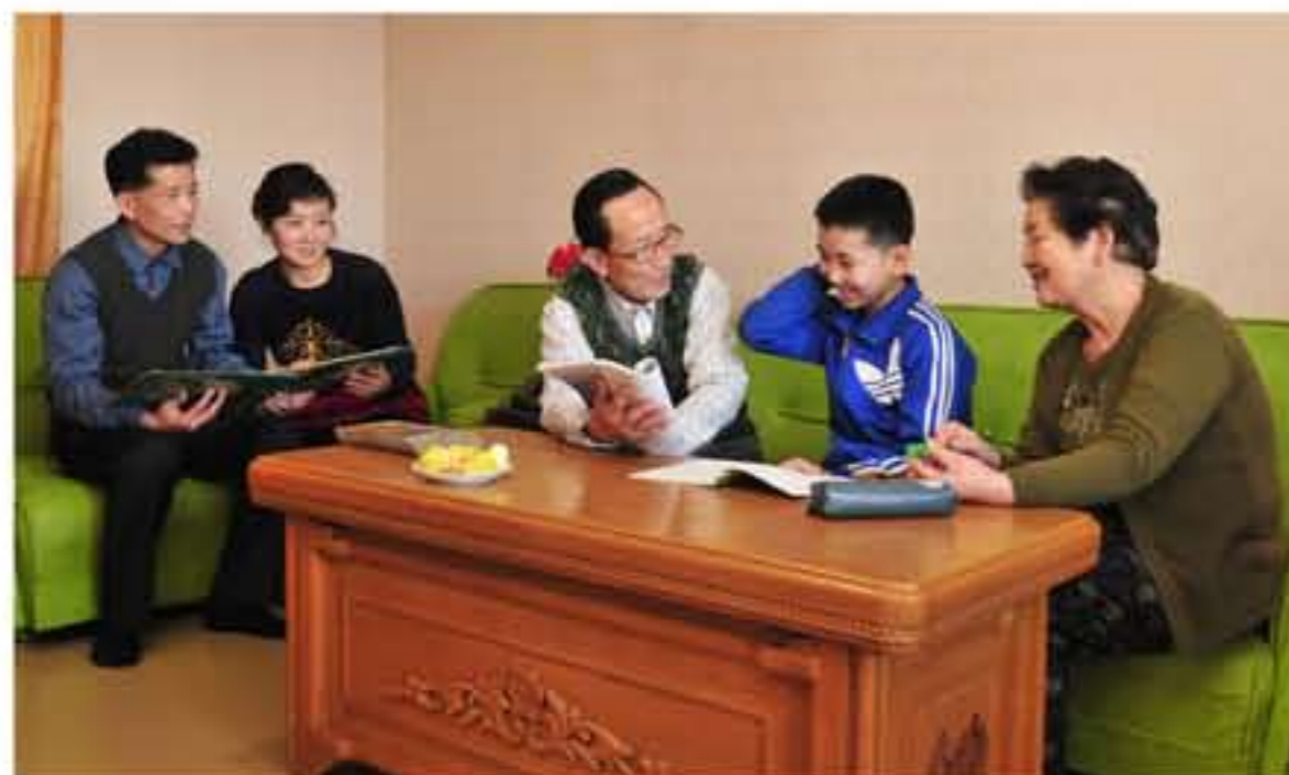
At home he is a careful teacher to his grandson.