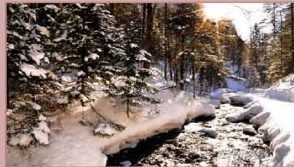
Sobaek Stream Flowing All the Year Round.