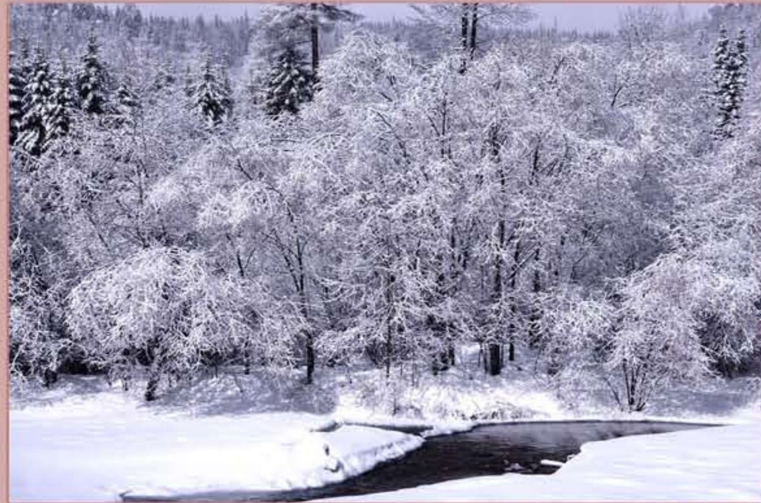
Hoar Frost in the Sobaeksu Valley.