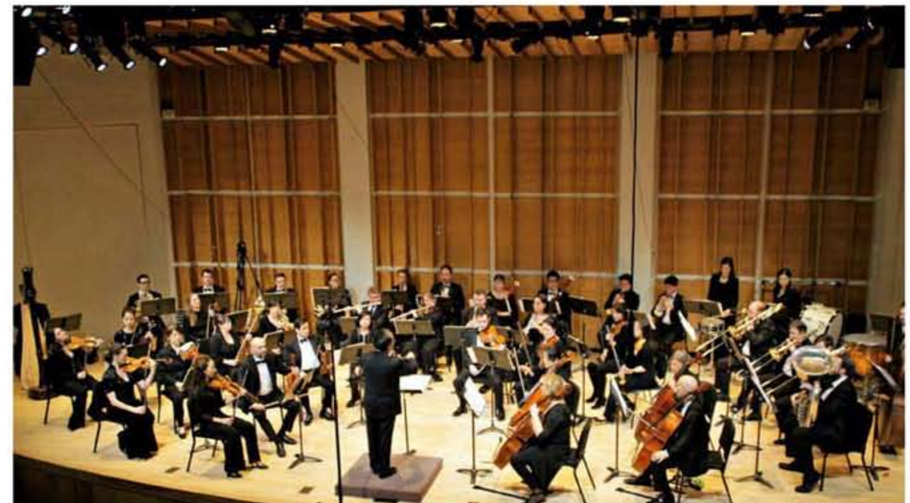
Koreans in the US and local artistes performed a concert "Spring in February" at a concert hall in New York to celebrate the 75th birth anniversary of the great leader General Kim Jong Il.