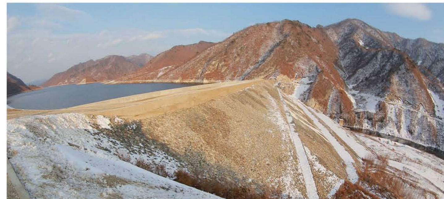
The Wonsan Army-People Power Station showing great vitality of self-development-first spirit.