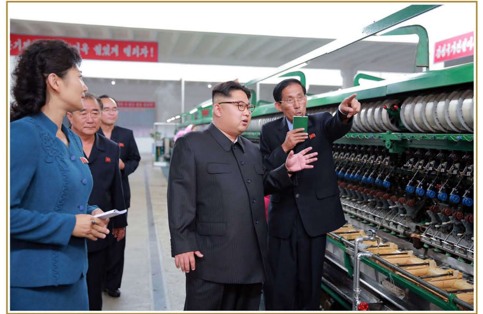
The respected Supreme Leader Kim Jong Un visits the Pyongyang Kim Jong Suk Silk Mill [June Juche 105 (2016)].