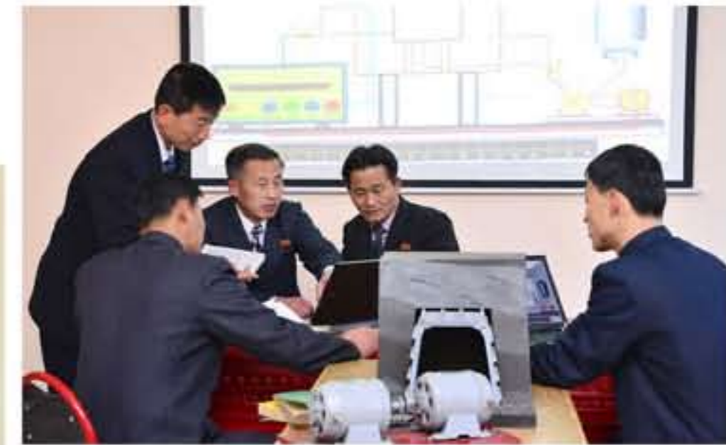
Lecturers discuss scientific teaching methods.

Inaugurated in October Juche 57 (1968), the Phyongsong University of Coal-Mining Industry is a base for training technicians and specialists in the sector of coal-mining industry.