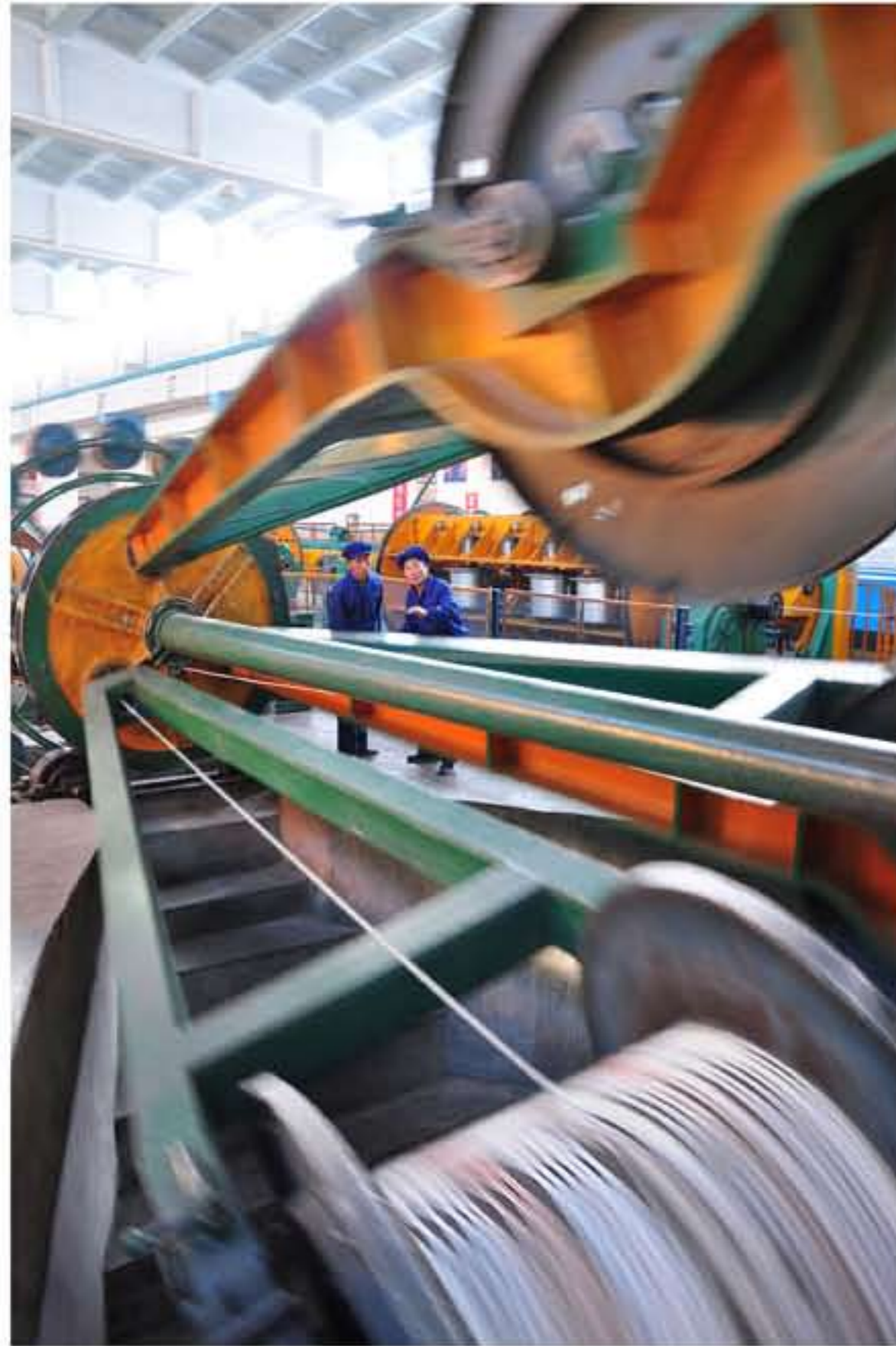
The factory turns out a variety of electric cables to meet the urgent demands of the several sectors of the national economy.

Article: Kim Thae Hyon