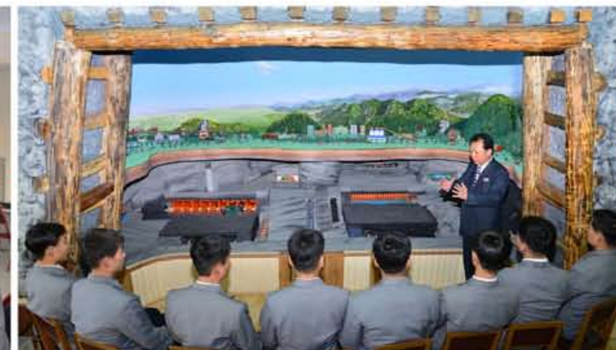
Students prepare their practical abilities to solve all the problems arising in reality.