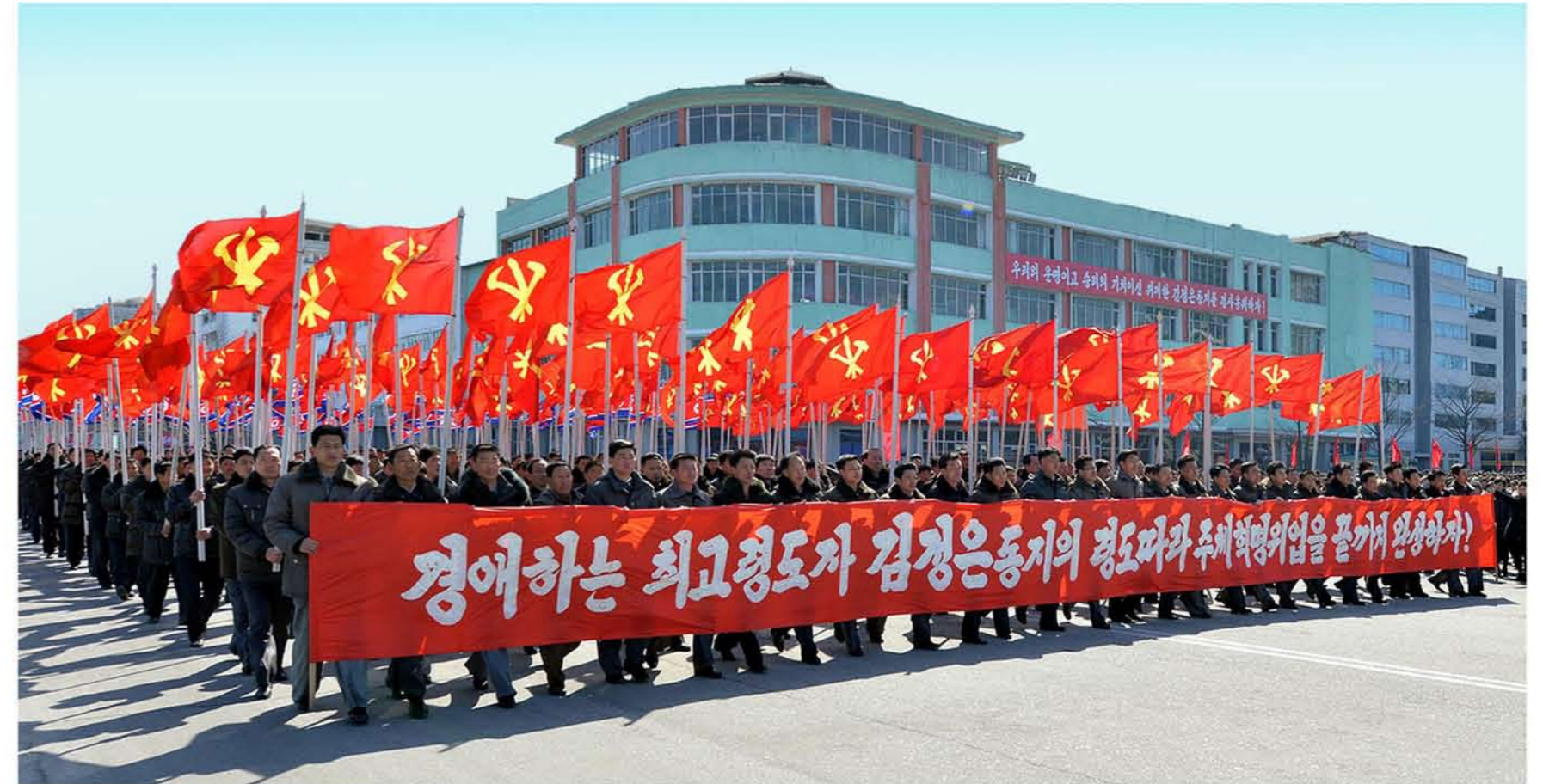
The people in Kangwon Province, who have created the spirit of Kangwon Province, exemplary spirit of the Mallima era, by staging a daring campaign to carry through the leaders' lifetime instructions and defend Party policy, appeal to the working people throughout the country to celebrate the conference of pacesetters in the Mallima era to be held at the end of the year as the meeting of victors by waging a vigorous all-people, general offensive under the unfurled banner of self-reliance and self-development.