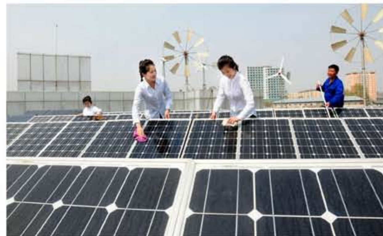
Efforts for raising efficiency of wind and solar energy resources are made.

Numerous factories, enterprises and institutions in the DPRK generate electricity by solar and wind power, in an effort to implement the WPK's policy to ease the strain on electric supply by making proactive use of natural energy.