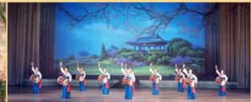
A scene from the folk dance suite The People in the Walled City of Pyongyang [Juche 86 (1997)].