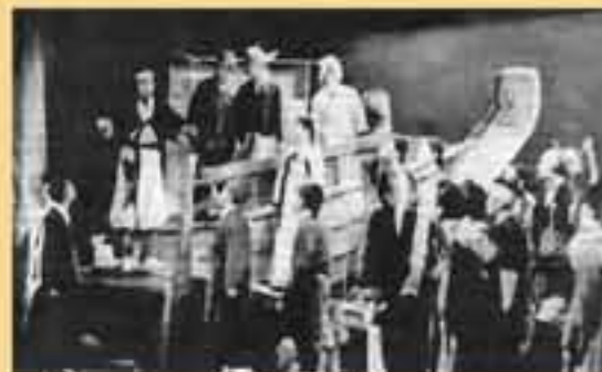
A scene from the opera The Tale of Sim Chong [Juche 36 (1947)].