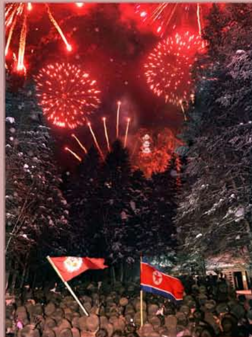
Nocturnal View of Fireworks Display in February.