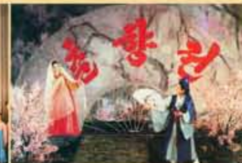
A scene from the folk opera The Tale of Chun Hyang [Juche 77 (1988)].