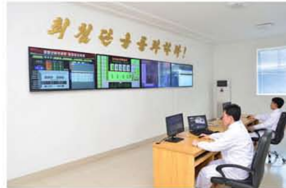
Main business strategy of the farm is the scientification of mushroom cultivation.