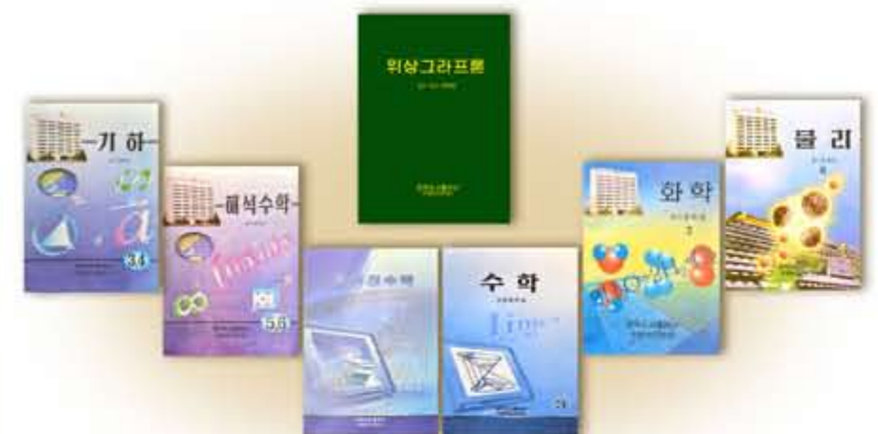
Some of textbooks and reference books written by Ryu.