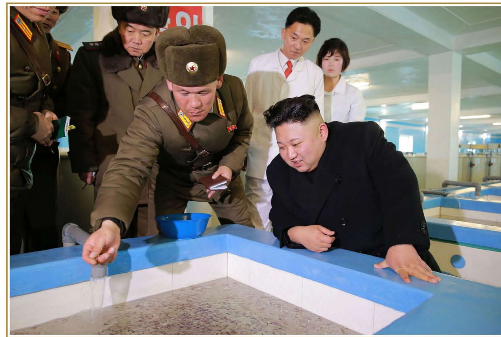
The respected Supreme Leader Kim Jong Un looks round the Samchon Catfish Farm [February Juche 106 (2017)].