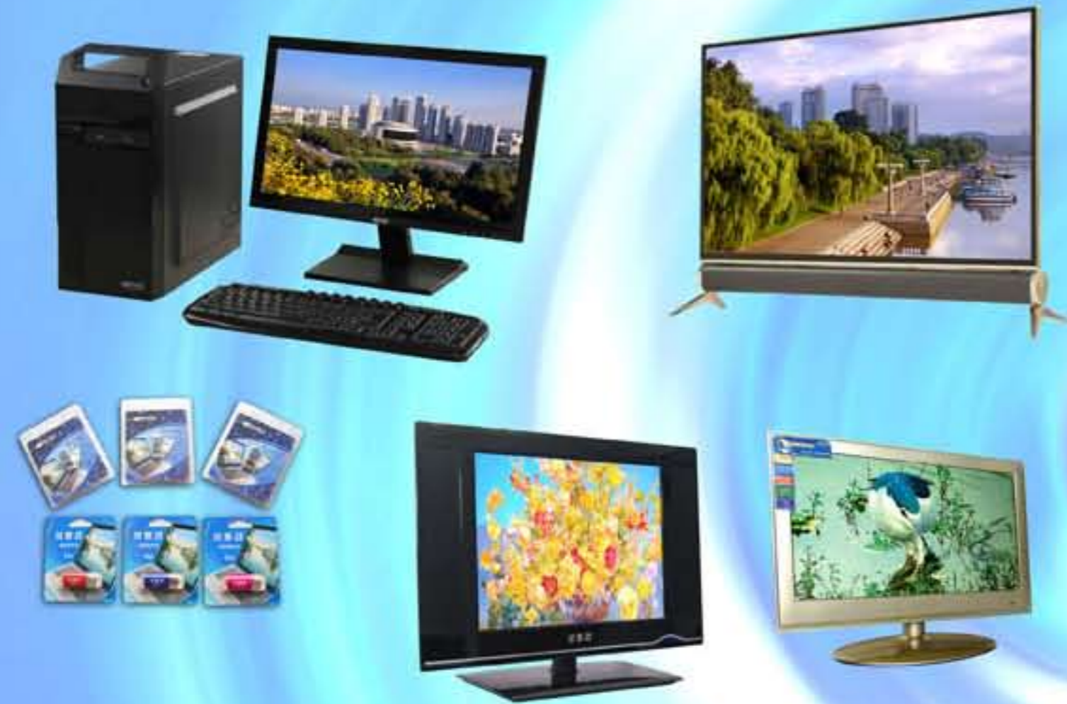
Some of the factory's products.

The Pothonggang Electronic Goods Factory renders a contribution to making the national economy IT-based and providing the people with a better cultural life. The factory started its operation in June Juche 102 (2013) with the assembling of the LED TV sets. It has undergone a tremendous change thanks to the sincere efforts of its officials and workers to make their products win favour among the people. With a viewpoint that quality improvement depends on their high level of technical knowledge and skills, the workers have studied advanced technology and shared their experiences at the factory's sci-tech learning space. The factory ensures strict observation of technical regulations and standard manuals of operation for all the production processes, as well as technical inspection by means of the frequency generator and aging test, fully guaranteeing the products' stability. The program developed by the technicians plays a big part in finding out inferior elements. The factory now turns out LED TV sets, various kinds of PCs and USBs. The Pyolmuri- and Pothonggang-brand electronic goods of the factory are drawing more public attention day by day.