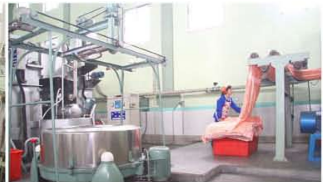
Modernization of the production lines is carried out by dint of spirit of self-reliance and self-development to improve the quality of the goods.