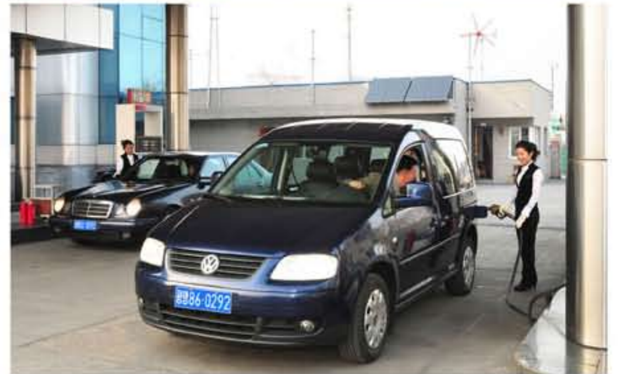
They produce electricity for business management by making use of natural energy sources.