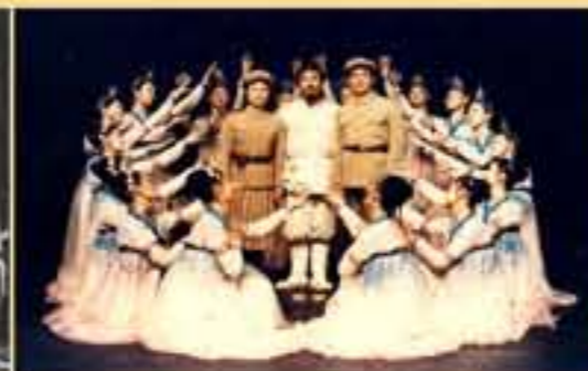
A scene from the revolutionary opera Tell O Forest [Juche 61 (1972)].