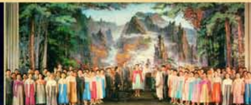
A scene from the revolutionary opera Song of Mt Kumgang [Juche 62 (1973)].