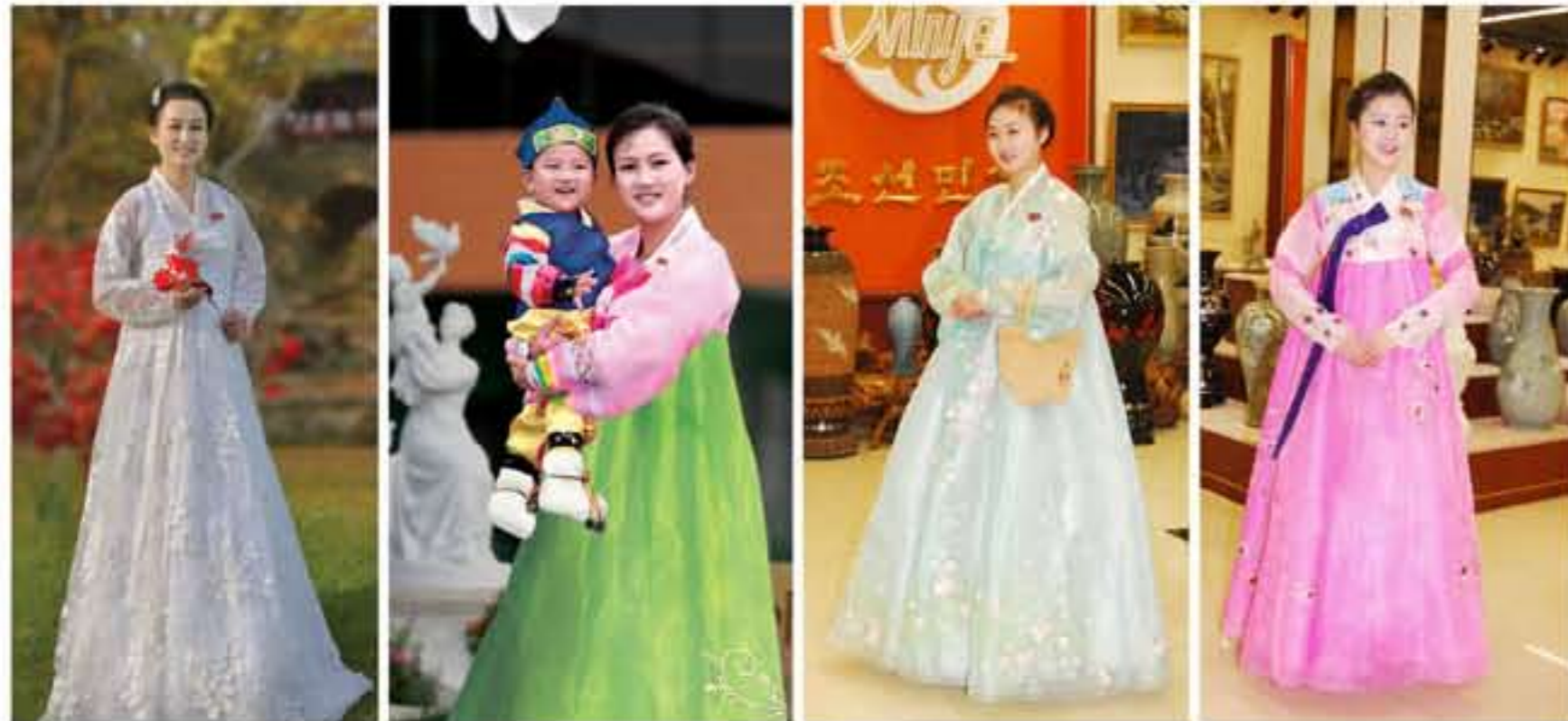
Traditional costumes for Korean women are being developed in line with the socialist lifestyles and modern aesthetic sensibilities.