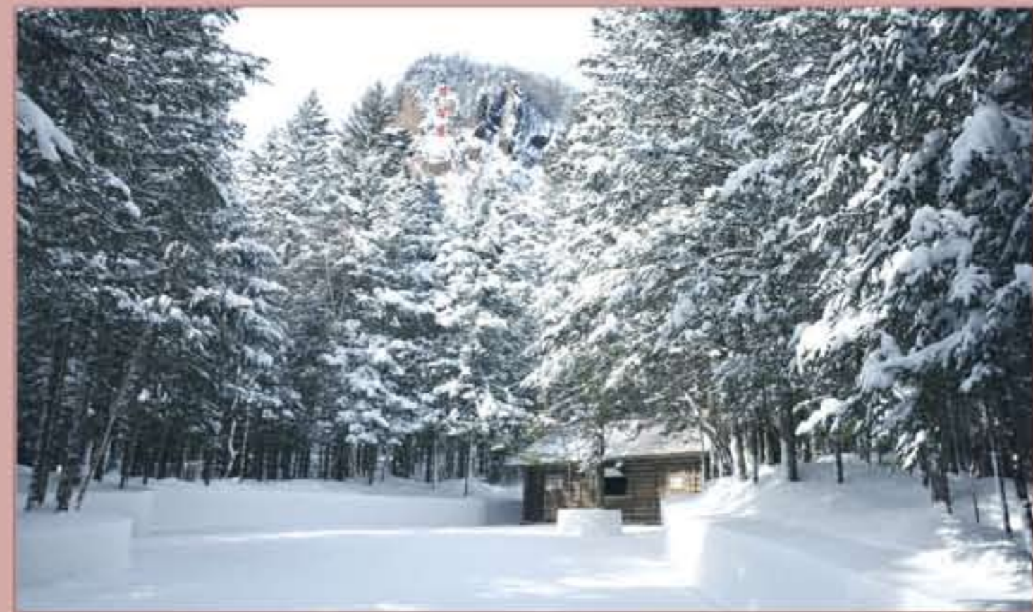
Snowscape of the Native House.