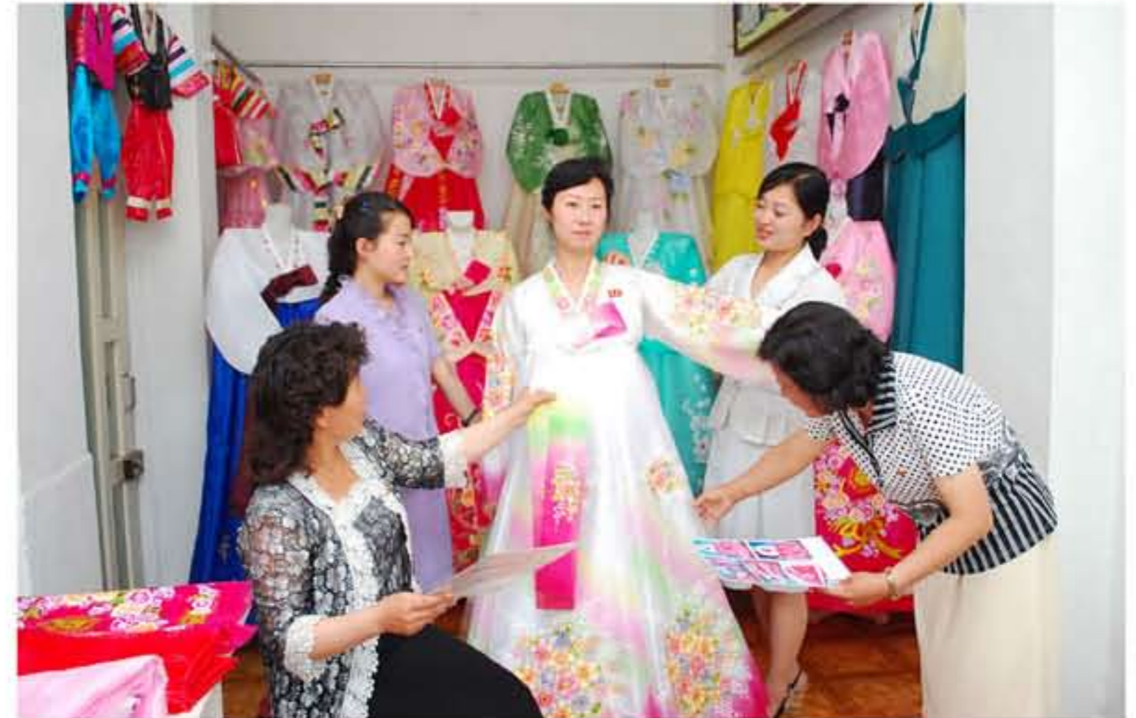
Discussions are held to promote the excellence of the ennobling and beautiful Korean costumes.