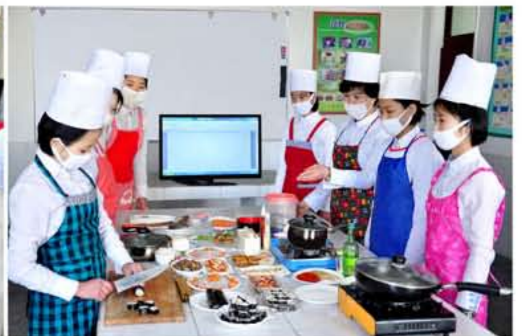
Students acquire versatile knowledge in the improved educational environment.