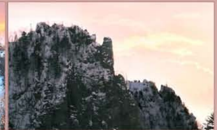
Sunrise Rock, Winged-Horse Rock and Sword Rock.