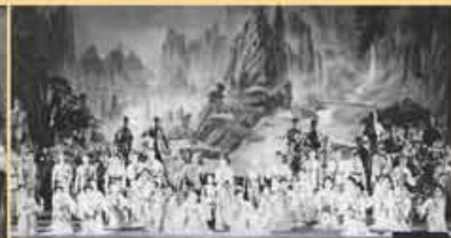
A scene from the folk opera Eight Fairies in Mt Kumgang [Juche 57 (1968)].