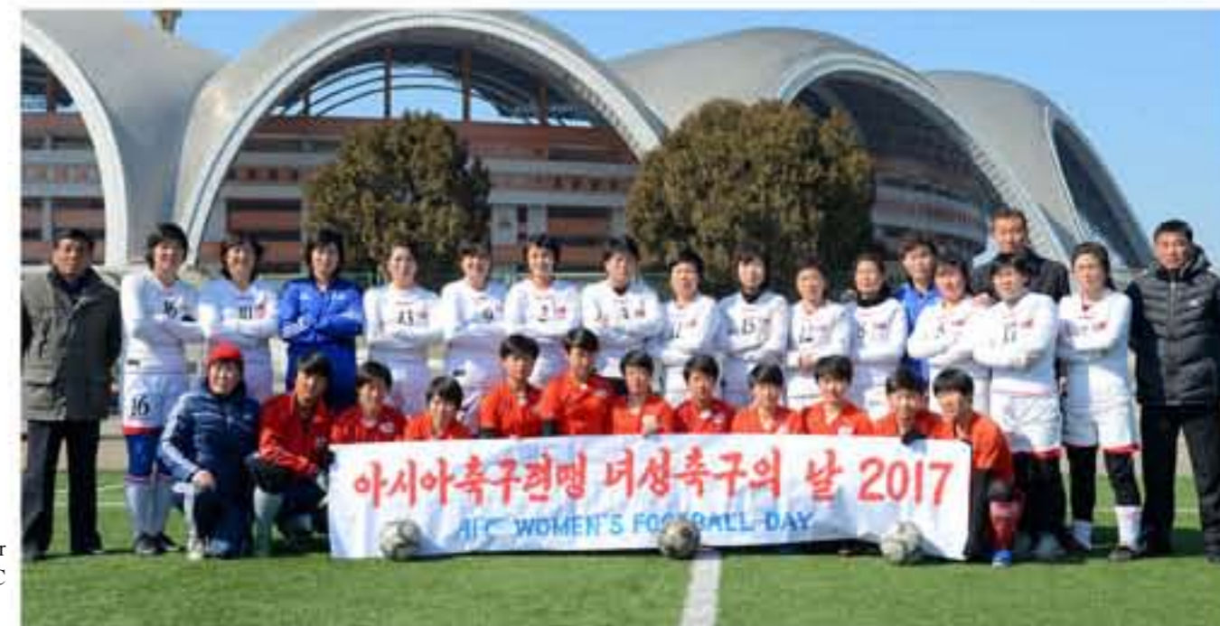
A workshop, a preview and other functions are held to mark the AFC Women's Football Day.