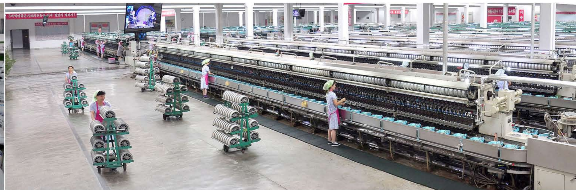
Miraculous innovations have been made in metal, chemical, light industry and other sectors of the national economy in the fierce flames of creating the Mallima speed flaring up across the country.