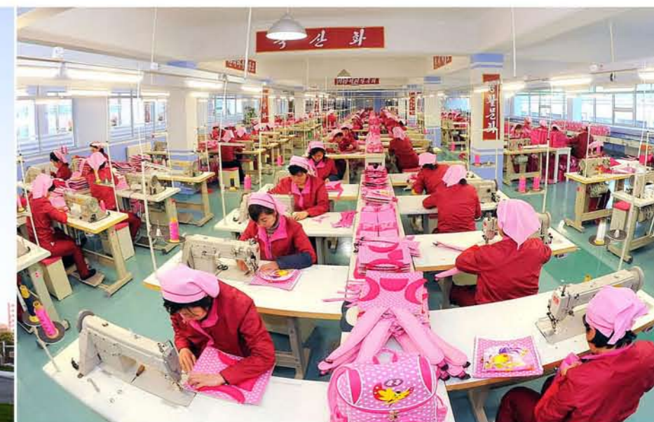
Under the sagacious leadership of Supreme Leader Kim Jong Un the Korean people are achieving world-startling, miraculous successes with the spirit of self-reliance and self-development as the dynamic force.