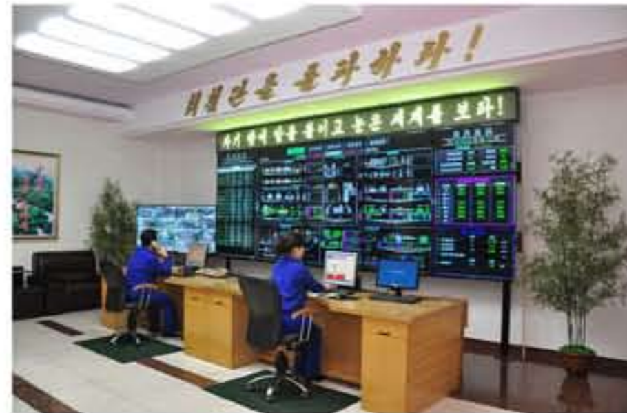
IMS control room.