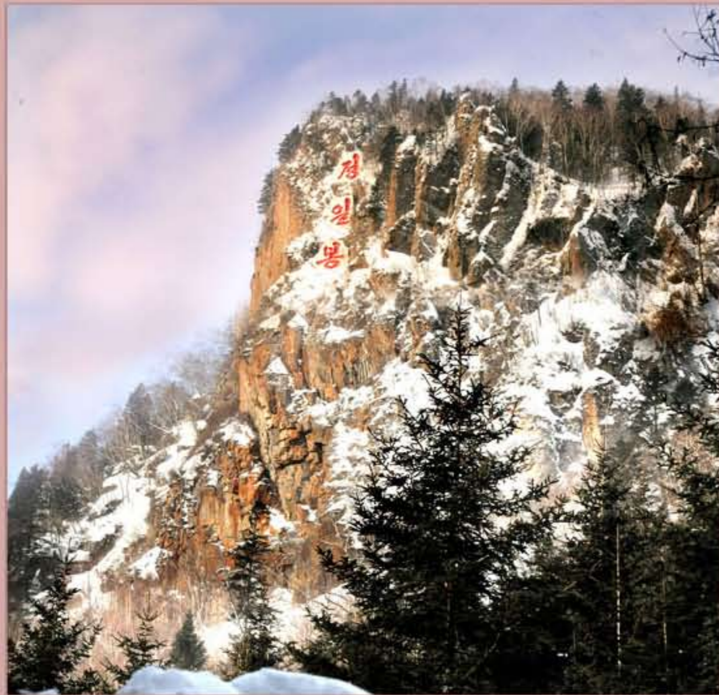
Most Sublime Jong Il Peak.