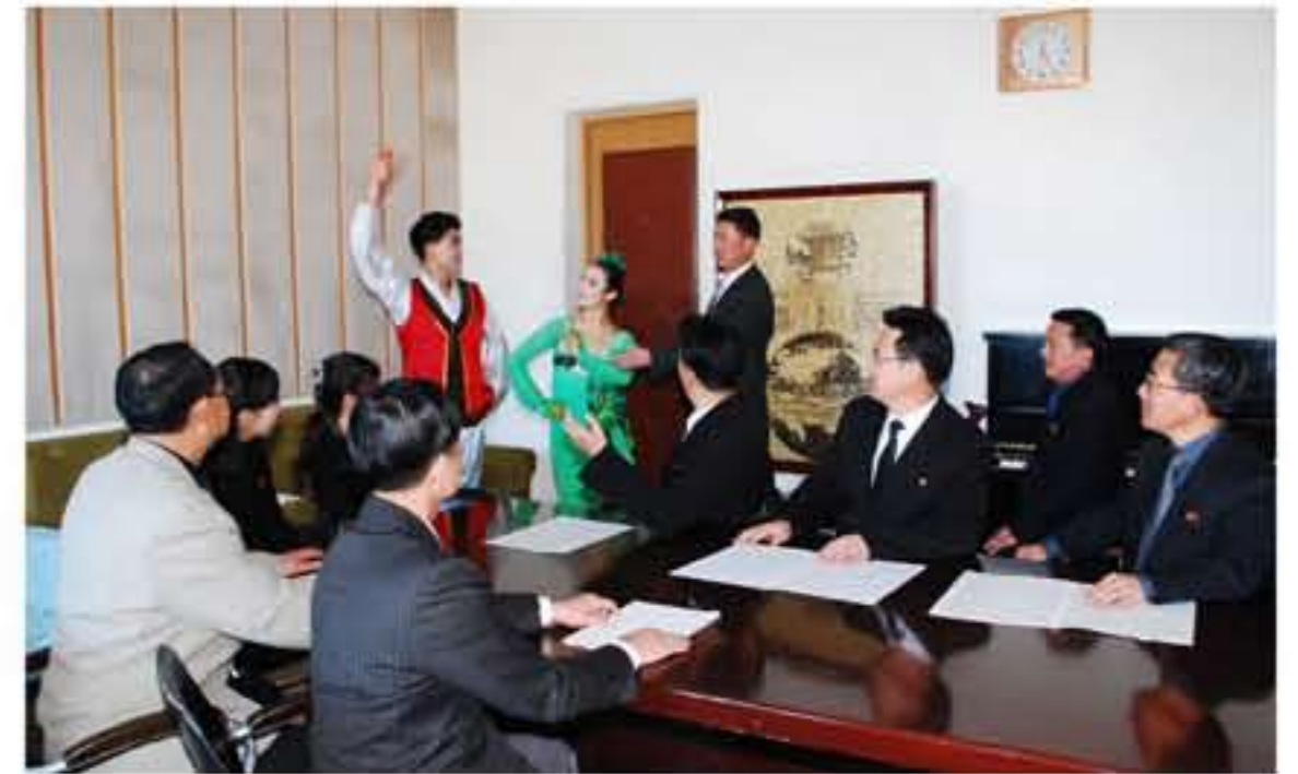
Creators and artistes devote their efforts to produce excellent pieces rich in national sentiments.

Article: Choe Ki Song