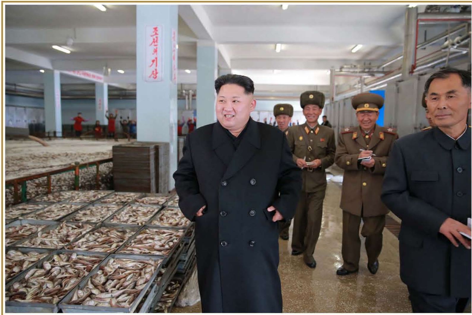
The respected Supreme Leader Kim Jong Un inspects the August 25 Fishery Station of the Korean People's Army [November Juche 105 (2016)].