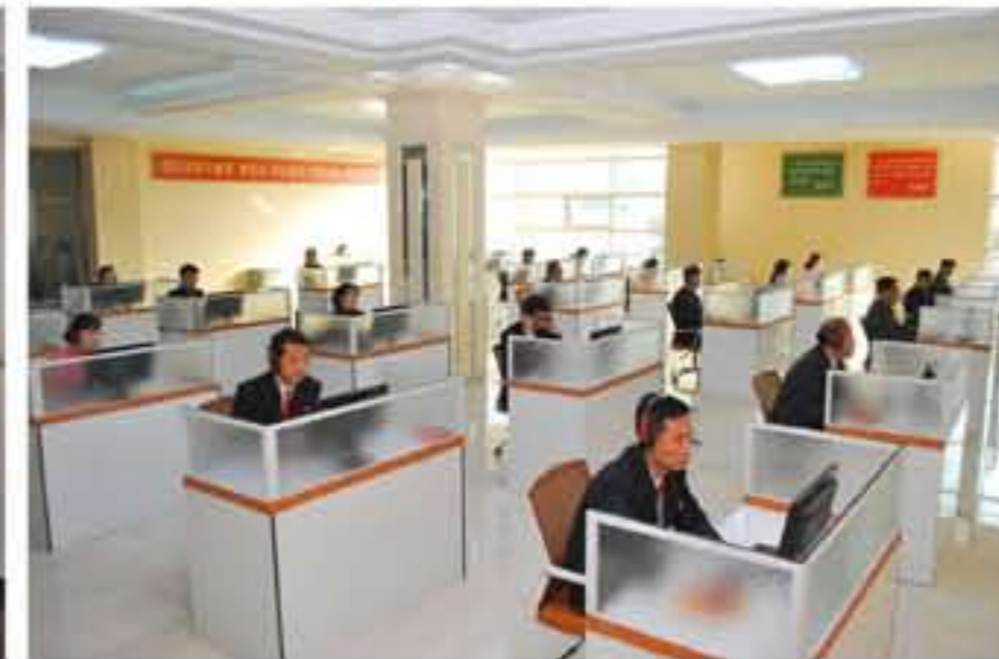
They acquire advanced science and technology at the sci-tech learning space of the factory.