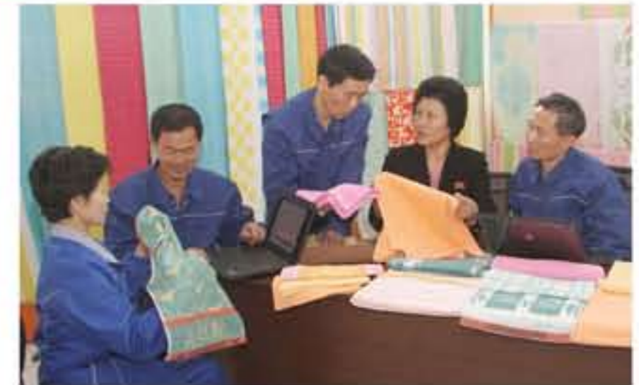
Creative opinions of the workers realize in product designs.